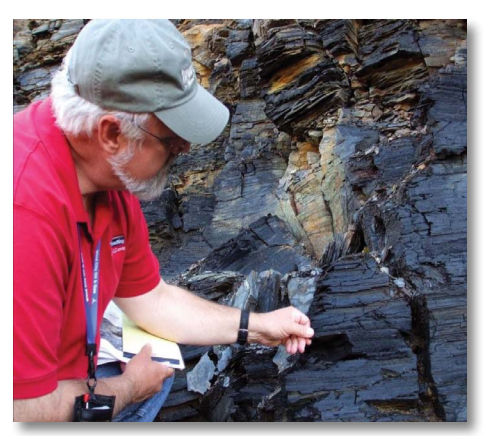
Natural gas is sometimes trapped inside of organic rich black shale (source: http://geology.com/energy/shale-qas/). Photo courtesy of ALL Consulting.

Consequently, shale resources are contributing to a rejuvenation of domestic natural gas supply in the United States. The U.S. Energy Information Administration (EIA) reports that U.S. shale gas production has increased 12-fold over the last decade and reserves have increased substantially, and now constitute about 19 percent of technically recoverable domestic natural gas. Shale gas (23 percent of the total), coalbed methane and tight gas combined now account for 58 percent of U.S. production . This increased domestic supply has helped reduce the need for imports while enhancing U.S. energy security.