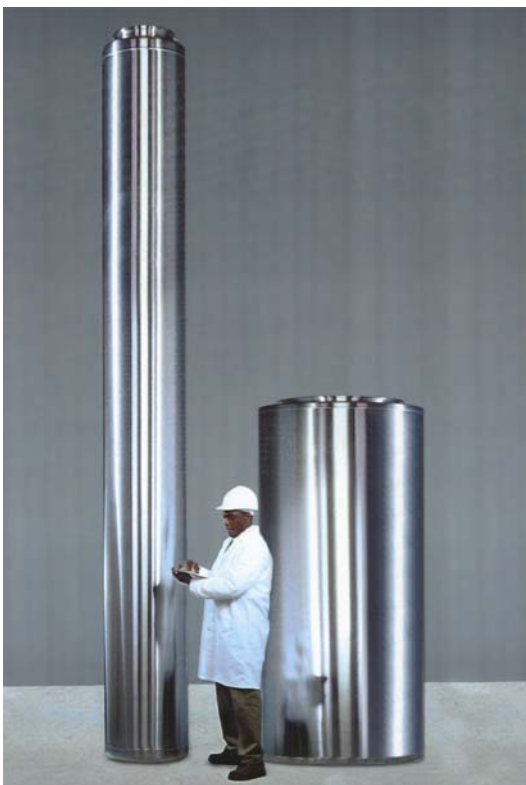
HLW and LAW stainless steel canisters

High-level vitrified waste is poured into stainless steel canisters that are 2 feet in diameter and about 14 feet tall. The filled high-level waste canisters, each weighing more than four tons, will be temporarily stored at Hanford. Eventually, the high-level waste containers will be shipped to a federal geological repository deep underground for permanent disposal.