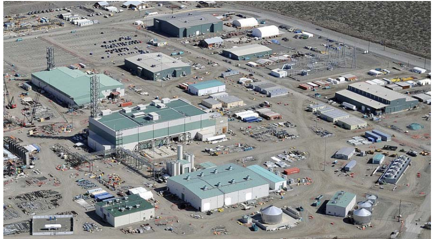
WTP in May 2012

www.hanfordvitplant.com www.hanfordvitplantsafety.com