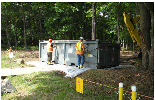
(Above) Soil Excavation and Waste Packaging in Progress