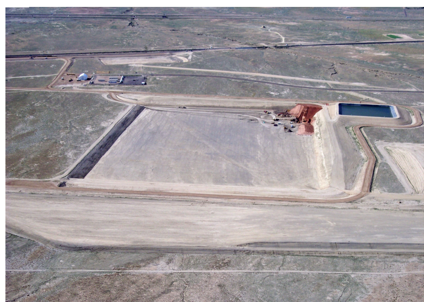
( Right ) Closer view of excavated portion of the disposal cell looking south. Tailings placed in the cell as of June 2, 2009, appear as reddish color.

For more information on EM Recovery Act work, please visit <u>http://www.em.doe.gov/emrecovery/,</u> <u>http://www.recovery.gov/</u>, and <u>https://recoveryclearinghouse.energy.gov/</u>. Feel free to send questions and comments to EMRecoveryActProgram@em.doe.gov. Your feedback is welcomed.