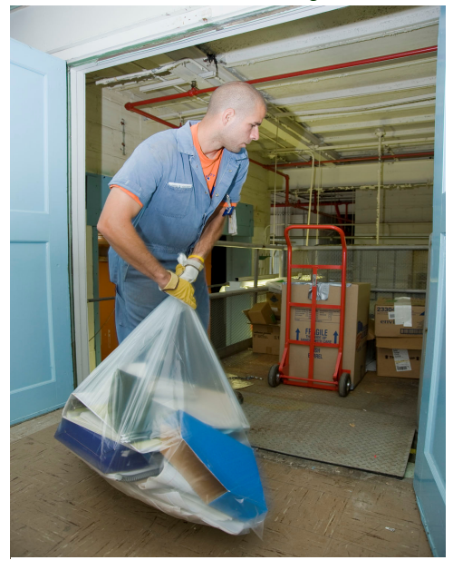
(Above) Workers remove legacy materials from Y-12's Beta 4 facility. Material removal in this facility was 13% complete at the end of June.

The Beta 4 (Building 9204-4) and Alpha 5 (Building 9201-5) facilities at the Y-12 National Security Complex have years of legacy material stored within them from past operations. In alone. Alpha 5 there is approximately 700,000 cubic feet of material, or roughly 1,728 standard dump truck loads.