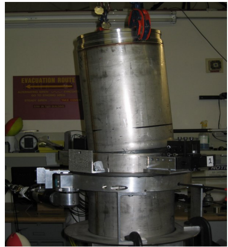
(Above) Innovative pipe cutting technology allows the Idaho Cleanup Project to access waste materials inside a HFEF-5 canister.

The Idaho Cleanup Project is taking on a new waste management challenge that creates new jobs and paves the way for future project opportunities. Remote