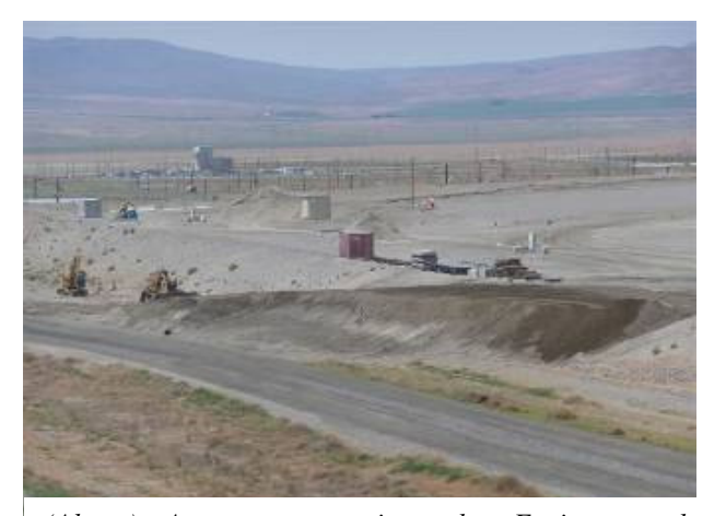
(Above) A new ramp into the Environmental Restoration Disposal Facility is being built to increase transportation safety by improving traffic patterns. The ramp and other infrastructure improvements are being made to ensure the facility continues to operate safely and compliantly as waste volumes increase from other Hanford contractors.

(Below) In late June, DelHur Industries, a subcontractor to River Corridor Closure Project manager Washington Closure Hanford, completed removal of a 250,000-cubic-yard stockpile to accommodate expansion of the Environmental Restoration Disposal Facility.