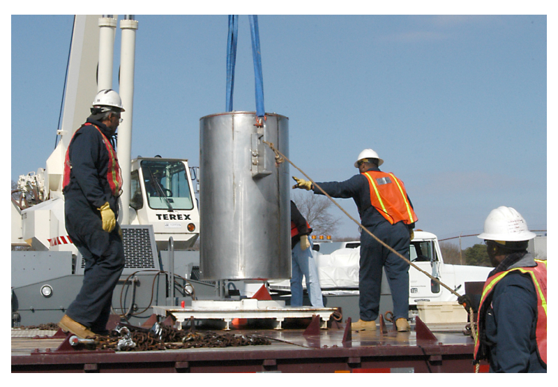
(Above) Workers moving shipping cask to transport trailer.