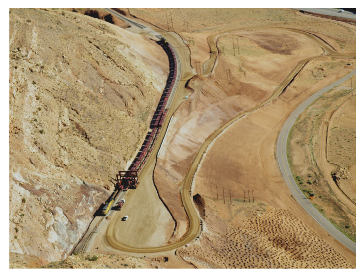
(Above) Aerial view looking north at 22 railcars on track at Moab Project site and the one-way haul road that crosses State Route 279 (in right center of photo).