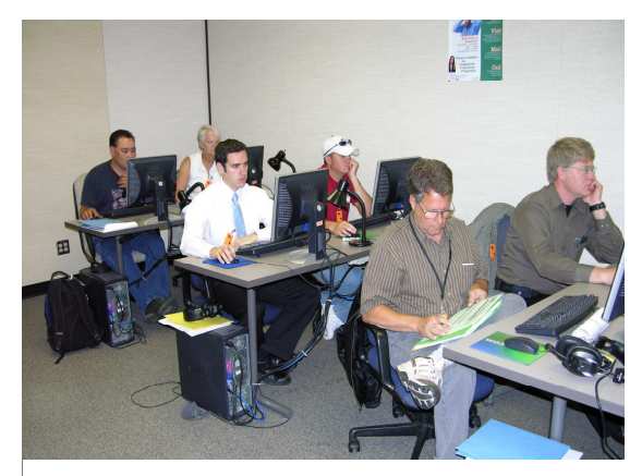
(Above) Newly hired Idaho Cleanup Project employees receive new hire orientation training during a June orientation session in Idaho Falls, Idaho.

Over a hundred new faces have already joined the ICP workforce, both in offices and at work sites across DOE's Idaho Site. The ICP is ramping up its workforce to complete new work scope assigned to the ICP under the Recovery Act.