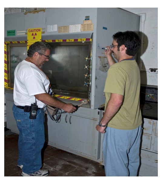
Radiological control technicians characterize Building 9735 for waste disposal. Four additional Y-12 facilities will be demolished with Recovery Act funding.

Additionally, project performance baselines, including resource-loaded schedules and project execution plans for both the initial 12-weeks and the full duration of the projects, have been submitted for approval. A subcontracting opportunity is under development for hazardous material abatement.