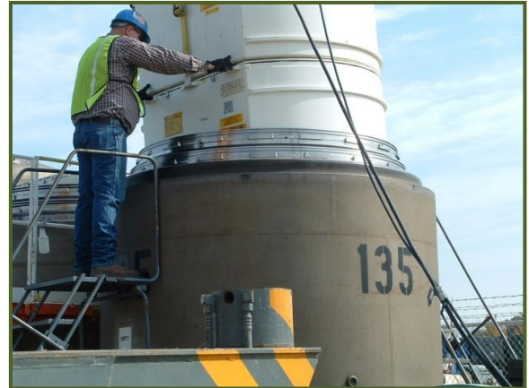
Mobile loading operations load contact-handled TRU waste into a TRUPACT-II shipping container.

Additional personnel was needed to set up for accelerated activities at the sites, due to the varied infrastructure and capabilities at each site. Thirty-six workers, funded by the Recovery Act, have received assignments at those sites to perform waste characterization activities and to certify and load the TRU waste into shipping containers for shipment to WIPP and final disposal.