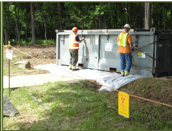
Packaging Contaminated Soil for Disposal