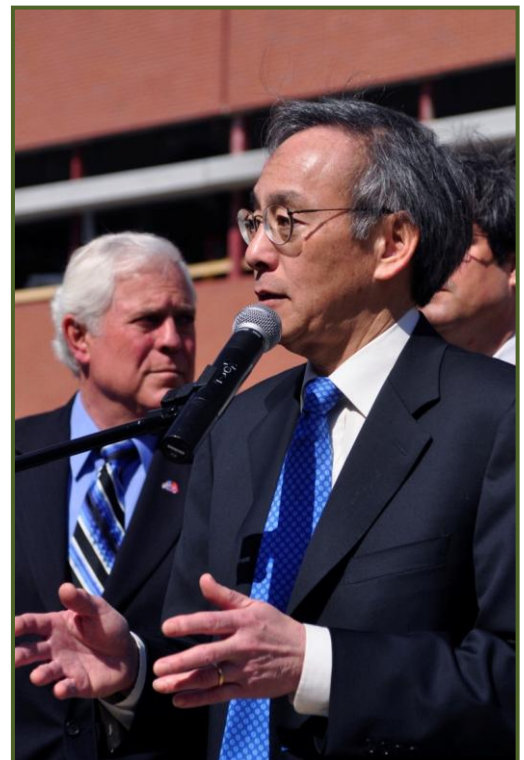
During his visit Secretary Chu spoke with reporters about the jobs that have been created at Oak Ridge using Recovery Act funds.

During a media event at the new $95 million Chemical and Materials Science Laboratory which is now under construction, Secretary Chu said nearly 2,000 jobs have been created or saved at Oak Ridge to date using Recovery Act funds.