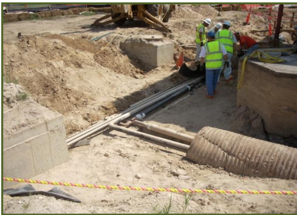
Removing Underground Waste Transfer Pipes