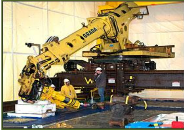
Remote Manipulator for BGRR Graphite Removal