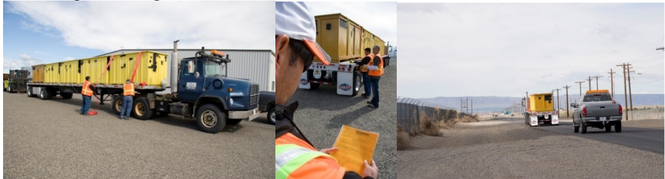
Workers at CH2M HILL work to safely remove backlog low-level waste soils off the Hanford Site.

Recovery Act funding provides the opportunity to finally disposition the waste, reducing the inventory of stored materials and reducing future storage costs.