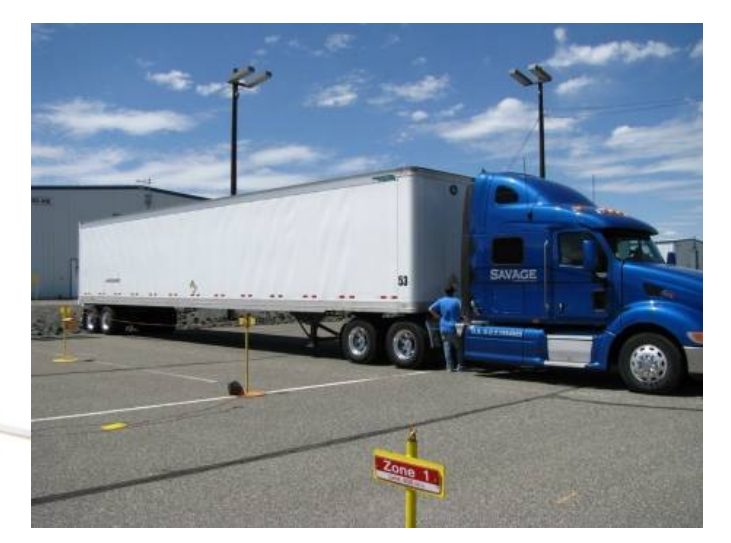
Recovery Act funds have allowed CH2M HILL to ship Legacy Low-Level Waste Oils from the Hanford Site's Central Waste Complex (above) to Perma-Fix Northwest in Richland, WA for processing, freeing up more room for solid waste that is being retrieved from burial grounds at the Hanford site.