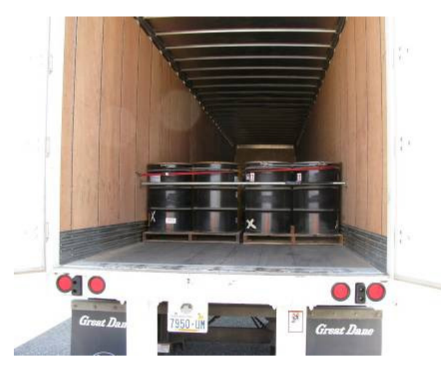
Using Recovery Act funds, CH2M HILL completed all scheduled fiscal year 2010 shipments of Legacy Low Level Waste Oils that had been stored in Hanford's Central Waste Complex since the 1990s.

Legacy waste is waste that has been in storage for several years. This work reduces a significant portion of the backlog of legacy, low-level waste that had been building up at Hanford for several years.