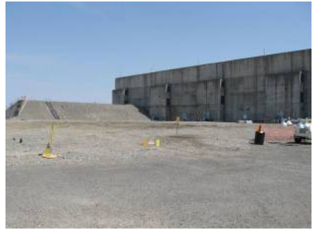
After demolition: Contractor CH2M HILL finished demolishing all 15 large tanks in July and disposed of the demolition debris in the Environmental Restoration Disposal Facility at the Hanford Site.