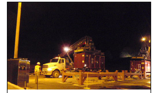
A reach stacker lifts a container off a haul truck.

In addition, the Moab Project is supplementing the 32.5-ton-capacity