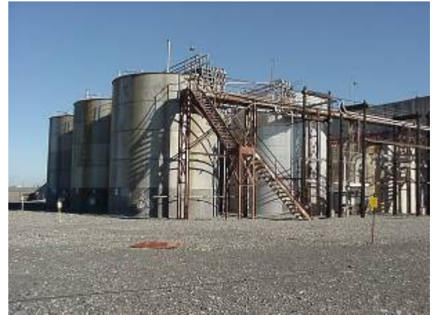
Before demolition: ten 100,000-gallon tanks and five 40,000gallon tanks stood next to U Canyon, a former chemical separations plant at the Hanford Site in Washington State.