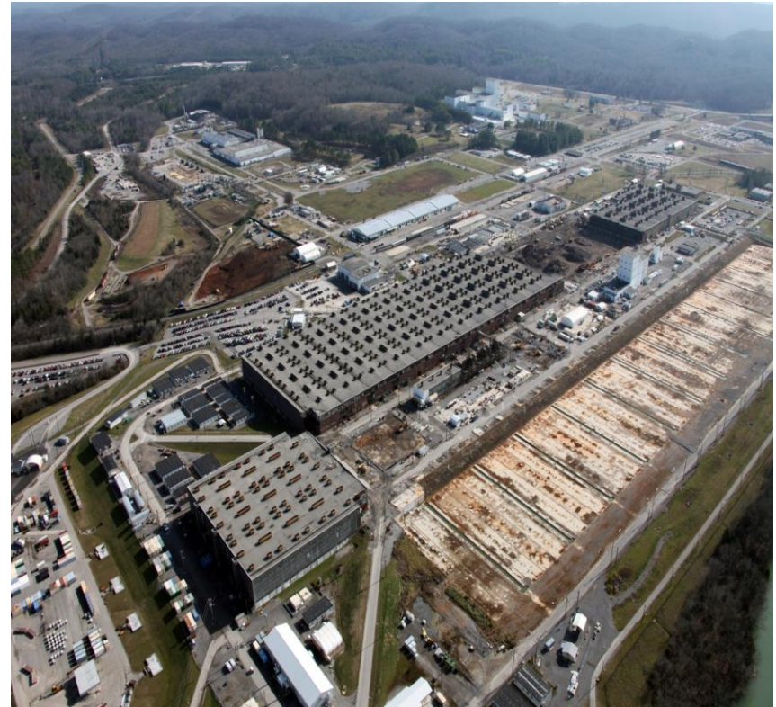
K-25 East Wing Demolition at Oak Ridge, TN