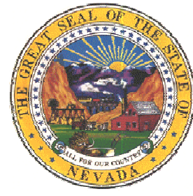
Nevada Division of Environmental Protection (NDEP)