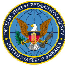
Defense Threat Reduction Agency (DTRA)