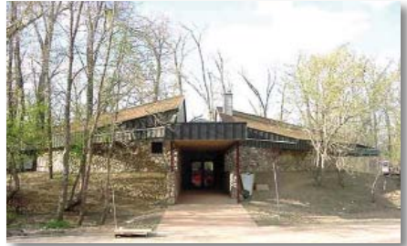
The Ft. Mandan Visitor Center in North Dakota is a showcase for incorporating CCPs, including wallboard from synthetic gypsum, flex-crete blocks, carpet, ceramic tile, acoustical ceiling tile, shingles, wall stucco, mortar, paint, cultured stone, and 70 percent fly ash replacement in concrete.

When properly managed, CCPs offer society environmental and economic benefits without harm to public health and safety. Research supported by the U.S. Department of Energy's (DOE) Office of Fossil Energy (FE) has made an important contribution in this regard.