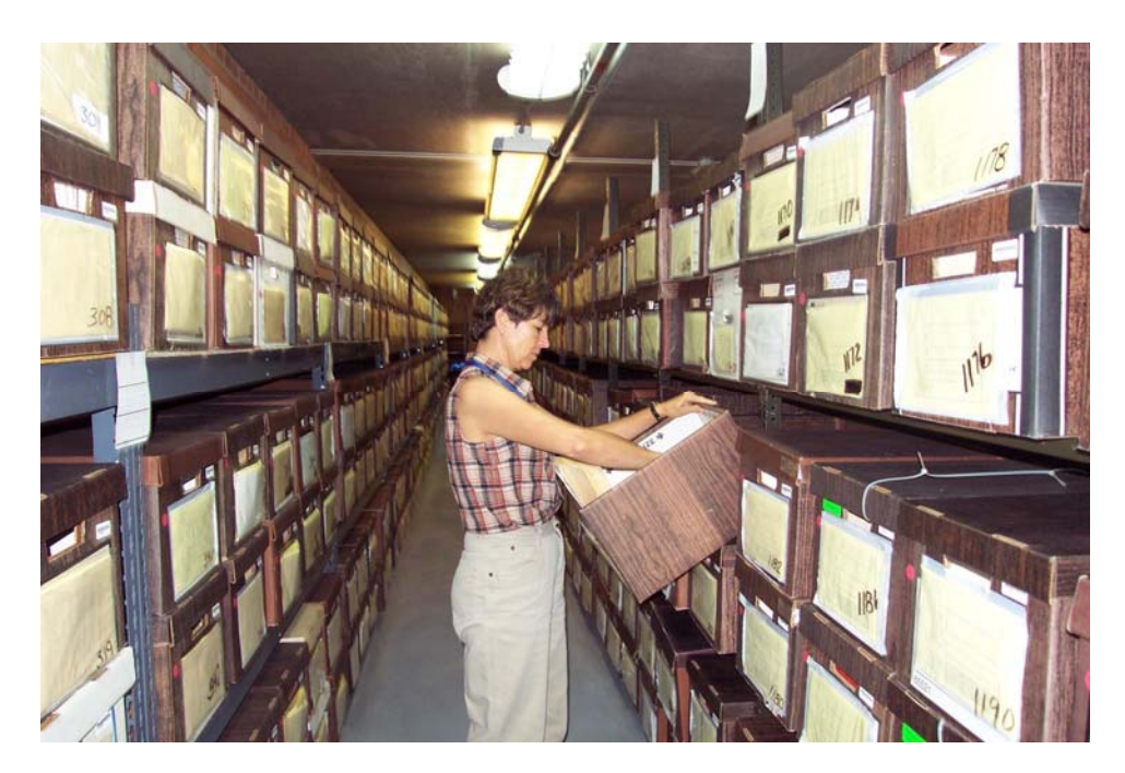
Fig.. 2. Active records storage at the DOE-LM office in Grand Junction, Colorado, provides access to information used by technical staff at that location.

Records generated through ongoing DOE-LM FUSRAP activities are managed according to LM procedures (Fig. 2). Information is needed by staff at various locations. Paper records are not suitable for organizations such as LM, which is distributed over a wide geographic area. Currently, FUSRAP records are available through the LM records management system. Pertinent documents are scanned and managed using this system, which allows access to document images at any LM location.