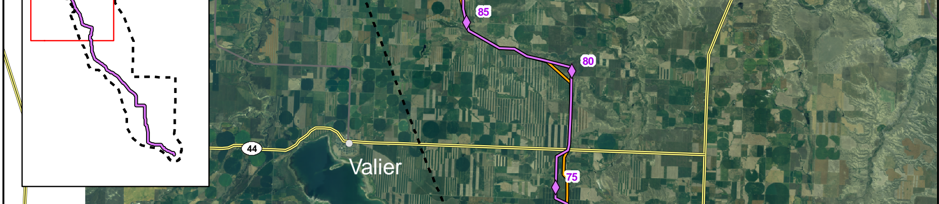
FIGURE 1.3-3 AGENCIES' PREFERRED ALIGNMENT NORTH

APPLICANT'S PROPOSED ALIGNMENT ALT 2 MAJOR HIGHWAYS Ζ MAJOR HIGHWAYS AGENCIES' PREFERRED ALIGNMENT ш - SECONDARY ROADS \diamond AGENCIES' MILE MARKERS Ċ NOTE: ALT = ALTERNATIVE CITIES AND TOWNS \bigcirc ш ALIGNMENT END AND EXIT POINTS