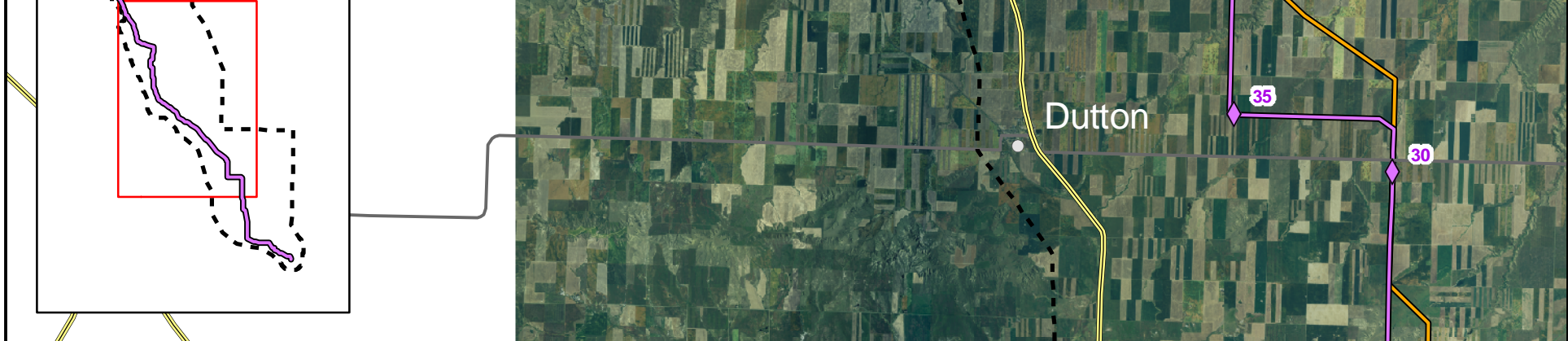
FIGURE 1.3-2 AGENCIES' PREFERRED ALIGNMENT MIDDLE