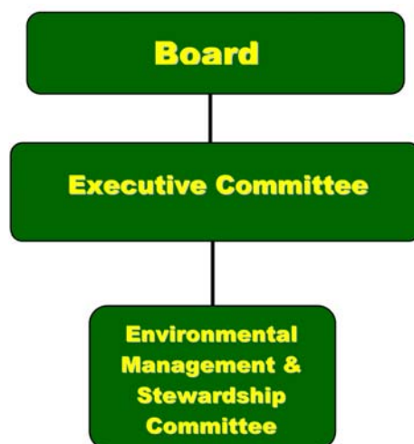
Figure 1. FY 2017 organizational structure

Each year the Board holds a planning meeting to determine how best to address its mission and what its committee structure should be. A summary of the 2016 meeting is available on the ORSSAB website at http://energy.gov/orem/downloads/orssab-annual-planning-meeting-august-2016 . The FY 2017 organizational structure is shown in Figure 1. As allowed by ORSSAB Bylaws, other committees may be formed as needed during the year to address specific issues.