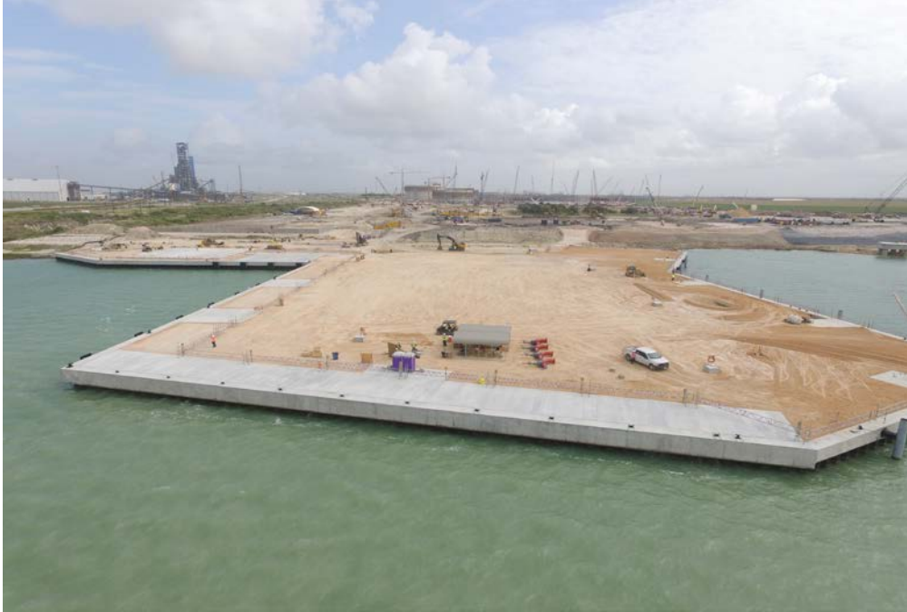
Marine Offloading Facility (MOF)