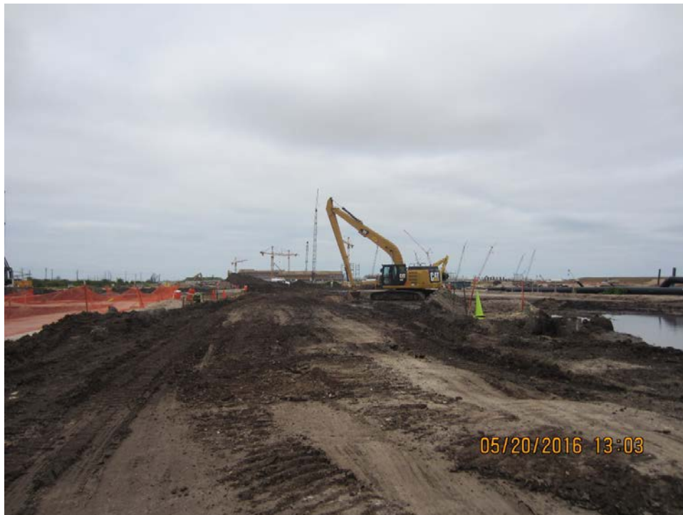
OSBL - Permanent Building Excavation