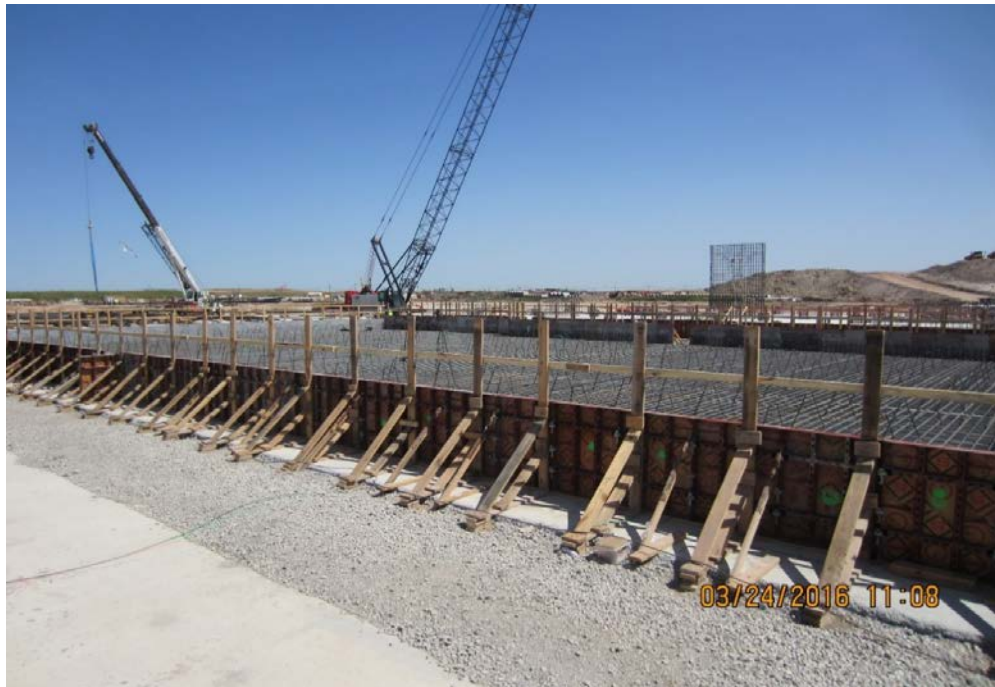
Train 2 – Pour 6