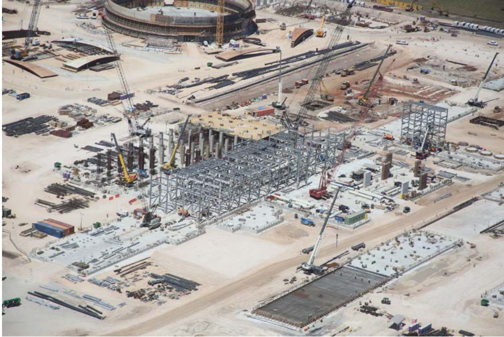
Train 1 Compressor Building and Cryo Rack