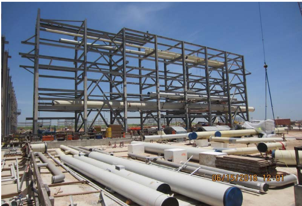
Train 1- AG Pipe Installation