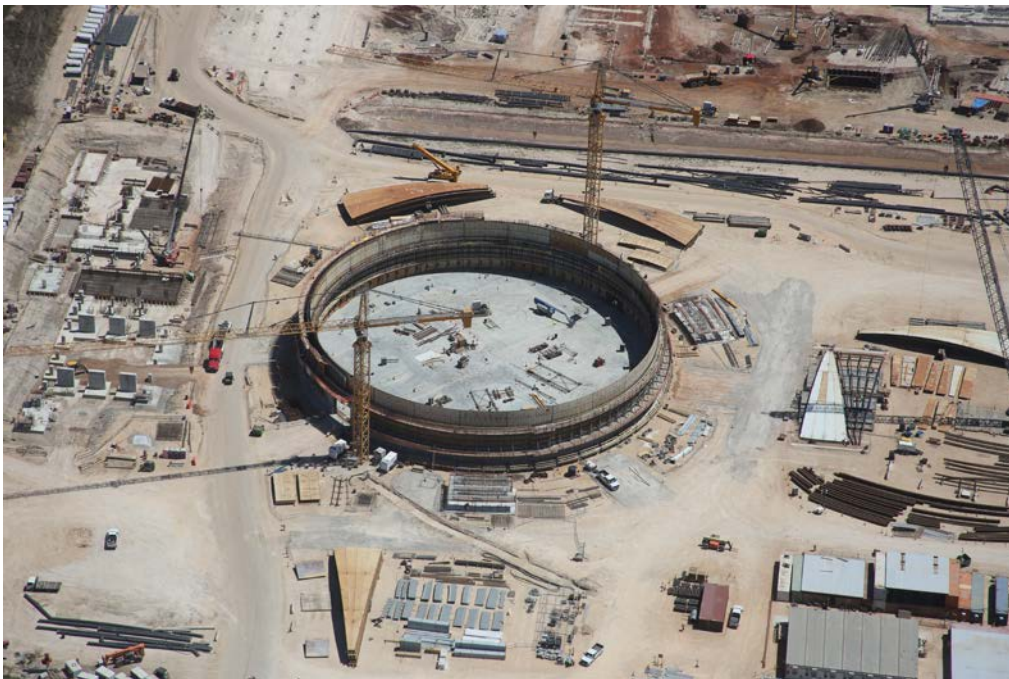
Tank A with third ring erected