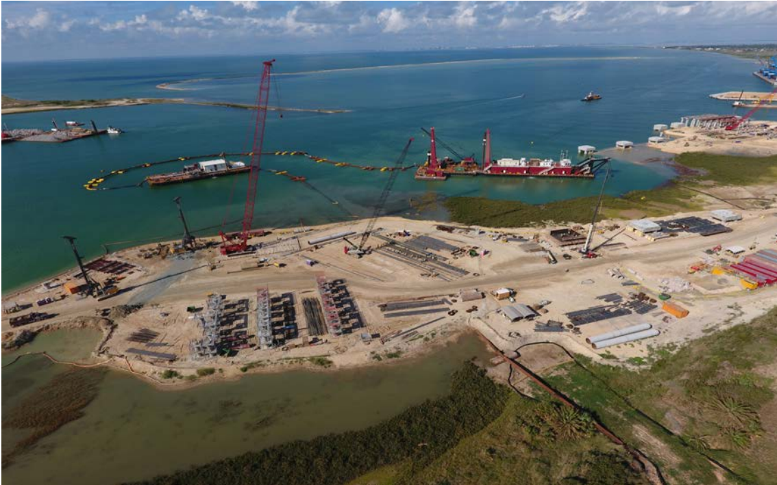
Marine East Berth