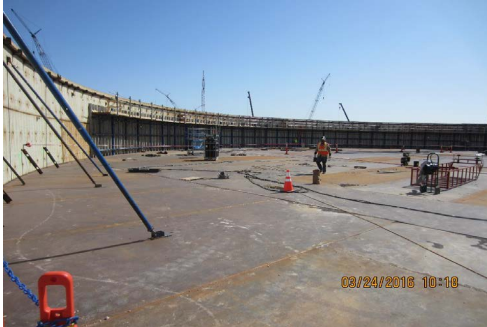
LNG Tank C – Interior wall