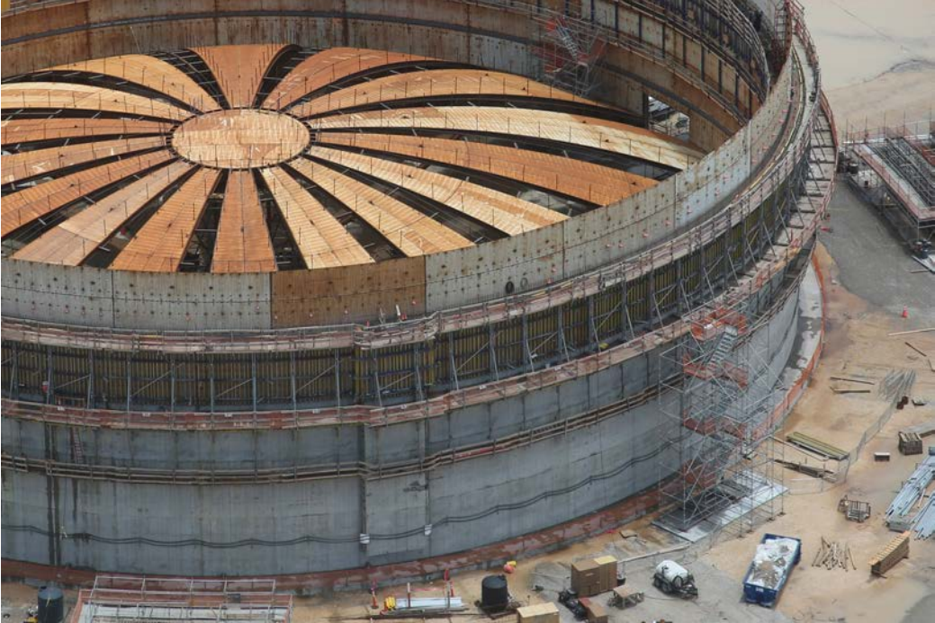
Tank A roof panels