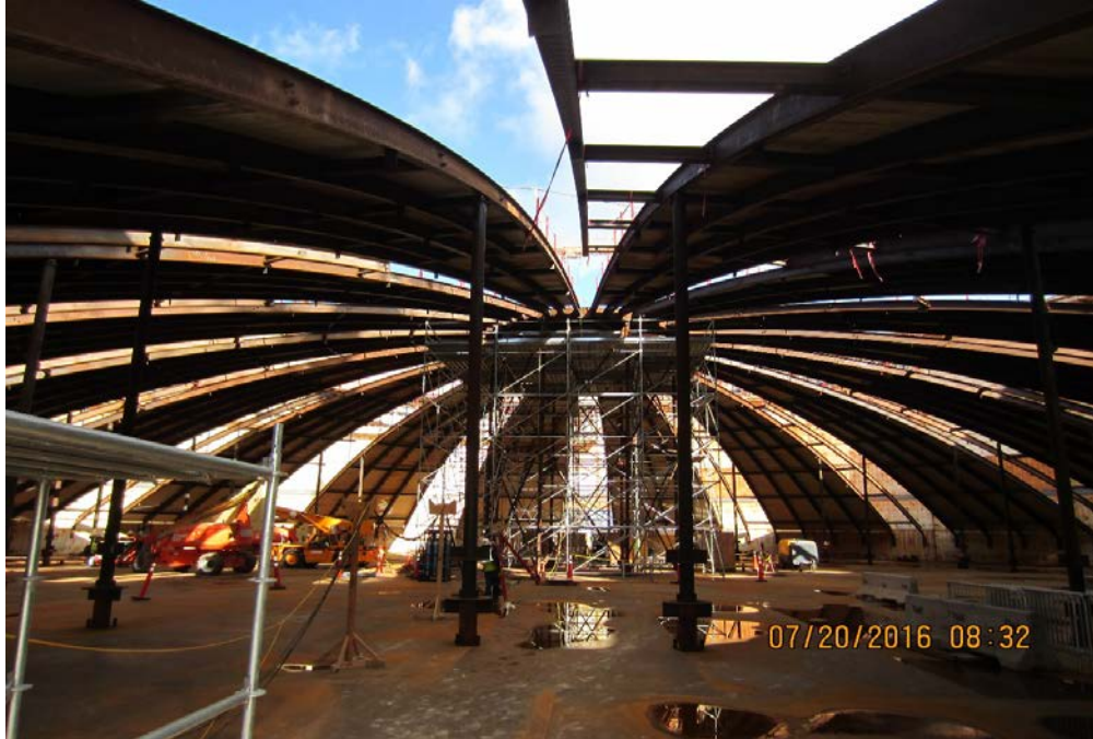
LNG Tank C - Installation of Jack Rafters