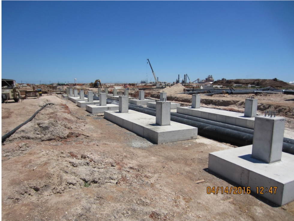
OSBL - at T2 rack foundations