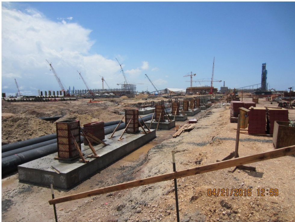
OSBL - at T3 rack foundations