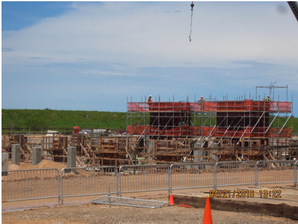
OSBL - Ethylene Refrigeration Storage Vessel