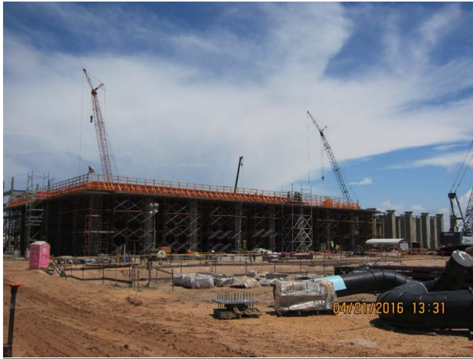
Train 1 –Propane deck shoring