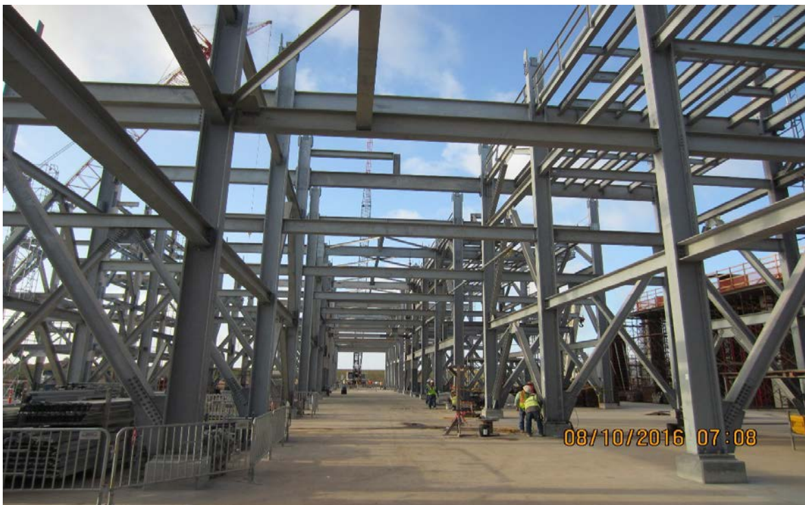
Train 2 –Cryo Rack Steel and A/G Pipe Installation