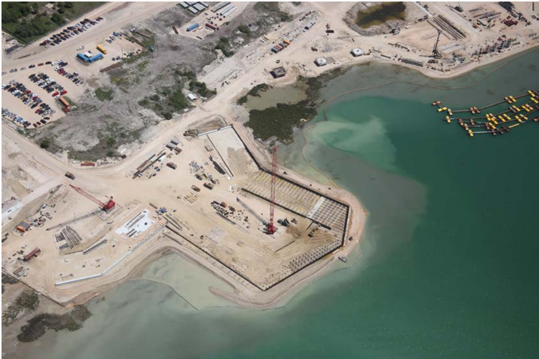
Material Offloading Facility (MOF) well under construction