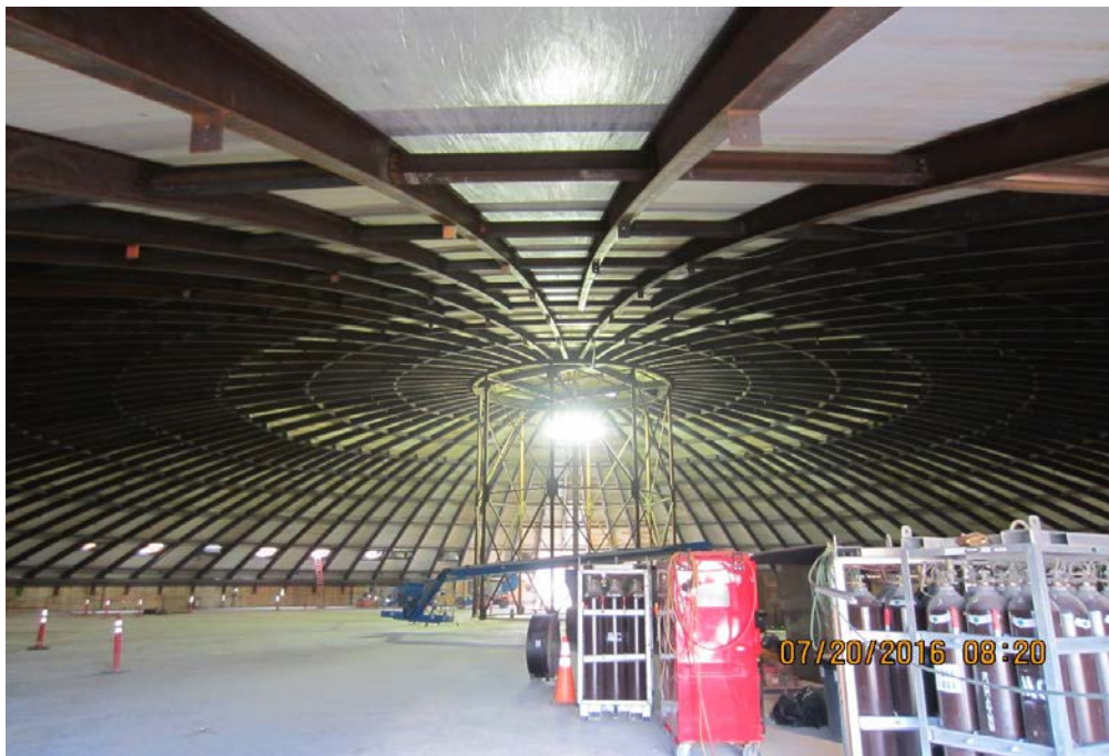
LNG Tank A - Roof Deck Plates and Cut-Outs