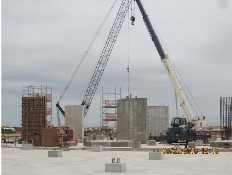
Train 2 – Wall Form