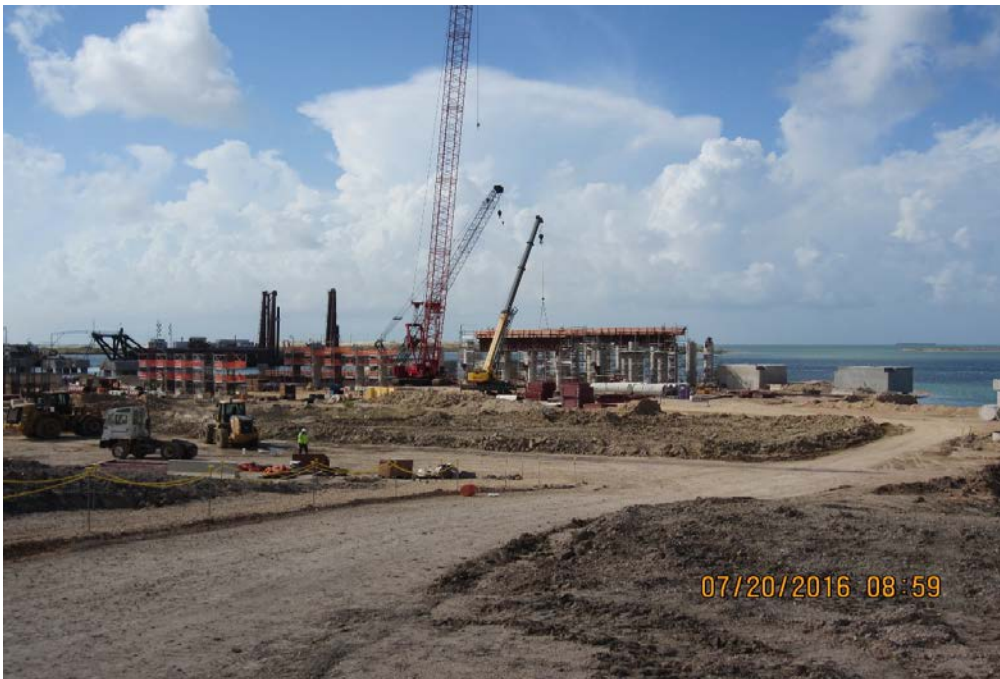
OSBL - MOF West Jetty Formwork