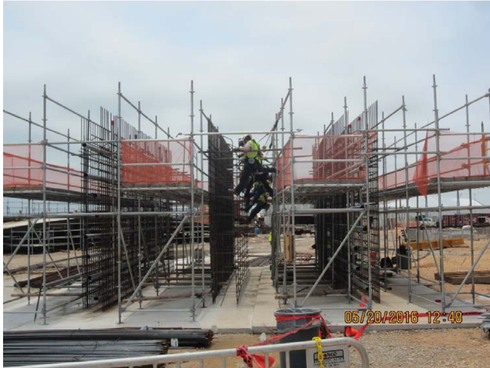
LNG Tank A – Rebar Installation