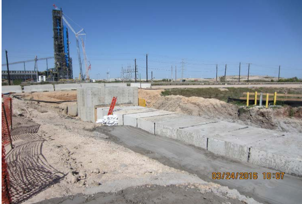
Infra- Culverts at WB1