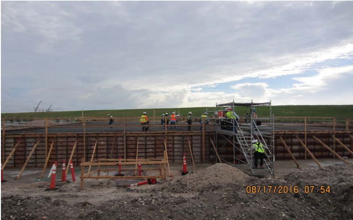
OSBL Flare Foundation Rebar Installation