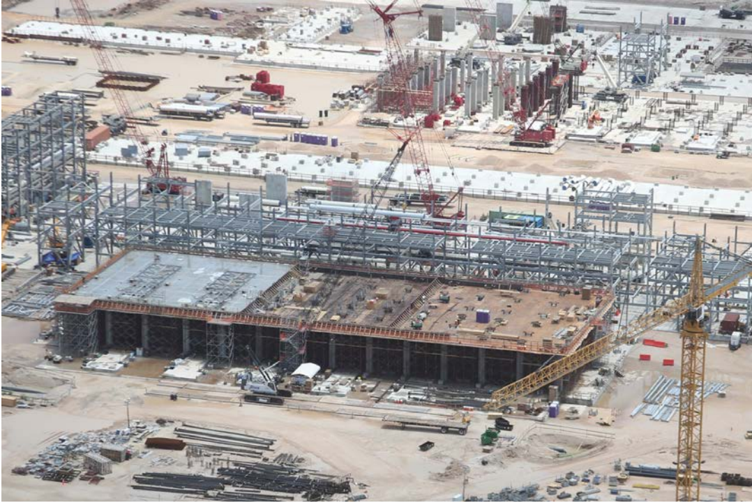
Train 1 Compressor Building and Cryo Rack