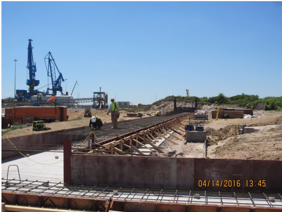
Marine – retaining wall for warehouse No.2