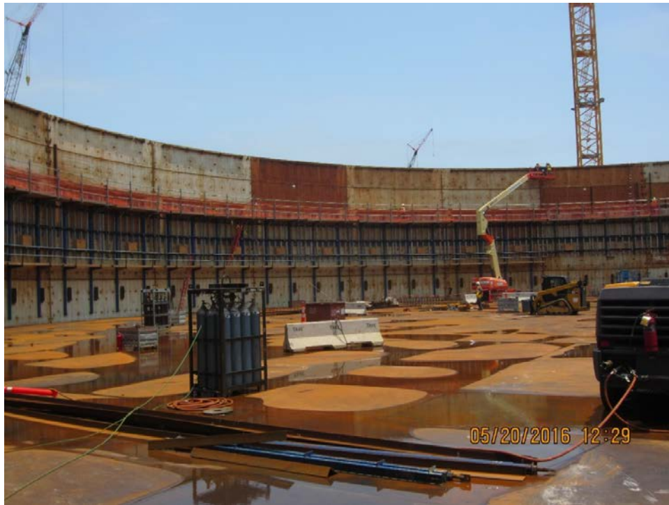
LNG Tank C - Interior Walls