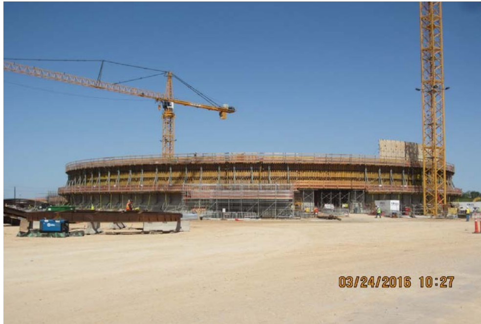
LNG Tank A - Outer Wall