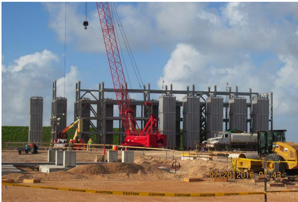
OSBL - Vaporizers Set