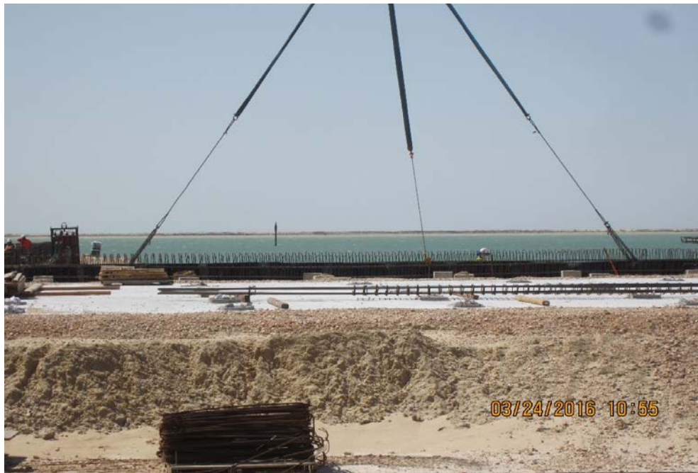
Marine – Bulkhead Cap Installation