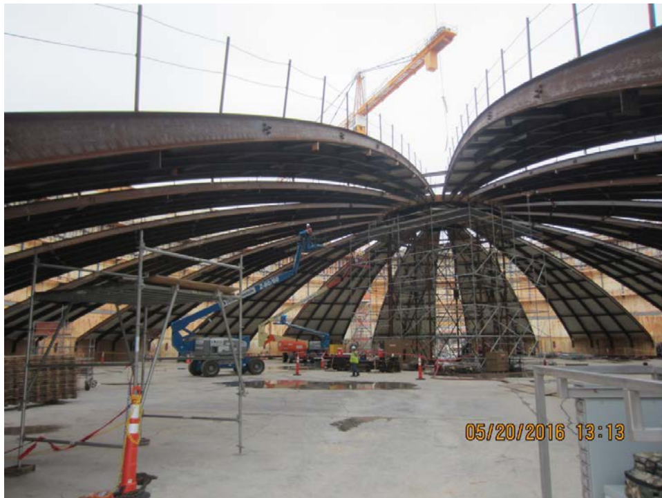
LNG Tank A – Roof Panels