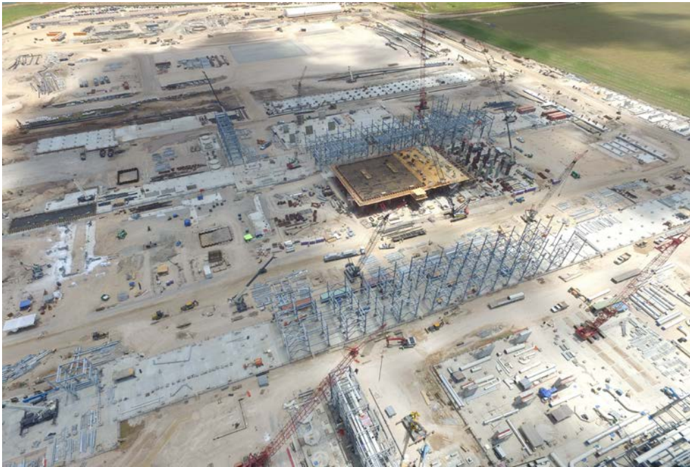
LNG Train 2