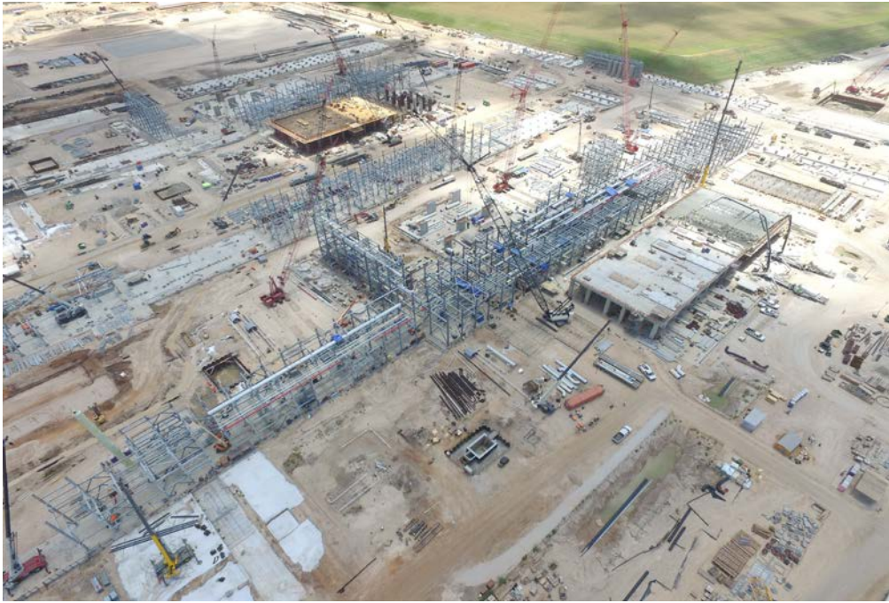
LNG Train 1