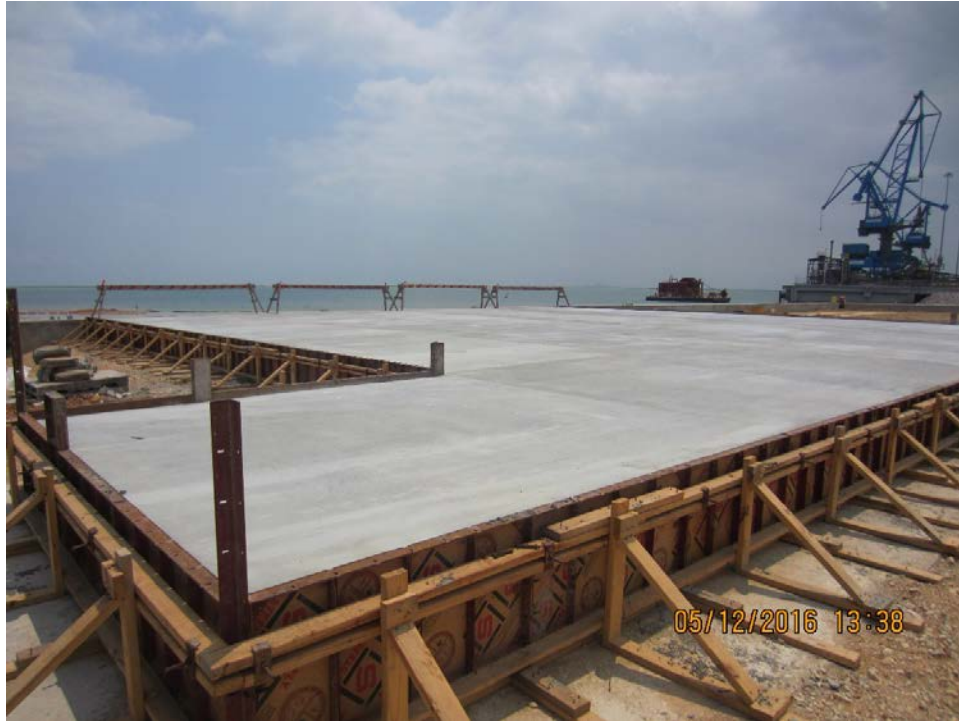
OSBL – MOF RORO Slab