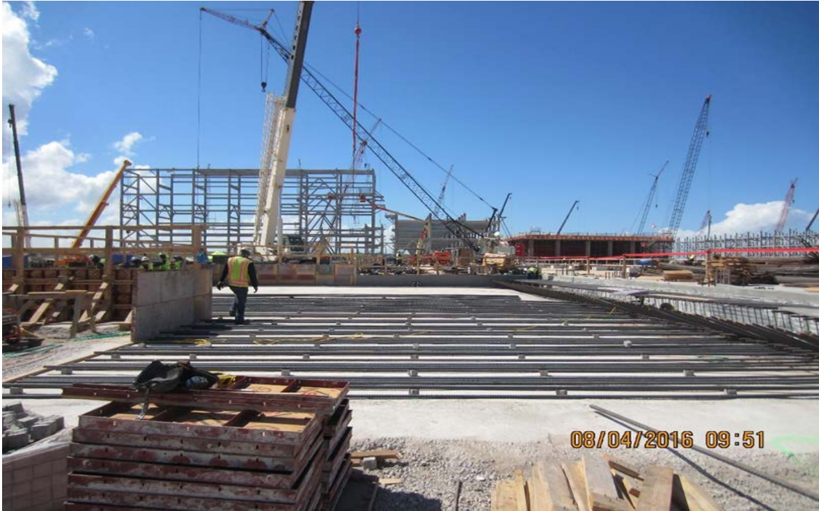
Train 2 - Condensate Stabilization Area Foundation Installation