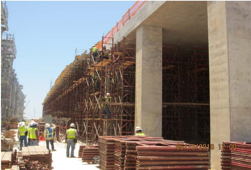
Train 1 – Propane Deck Shoring Removal