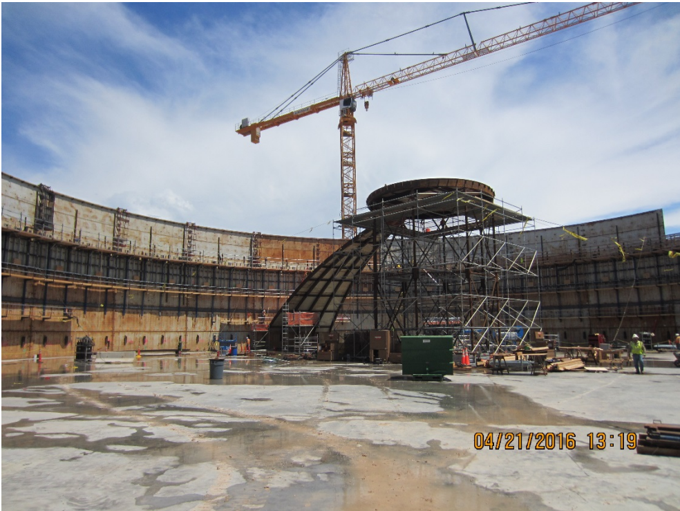
LNG Tank A – Roof petals