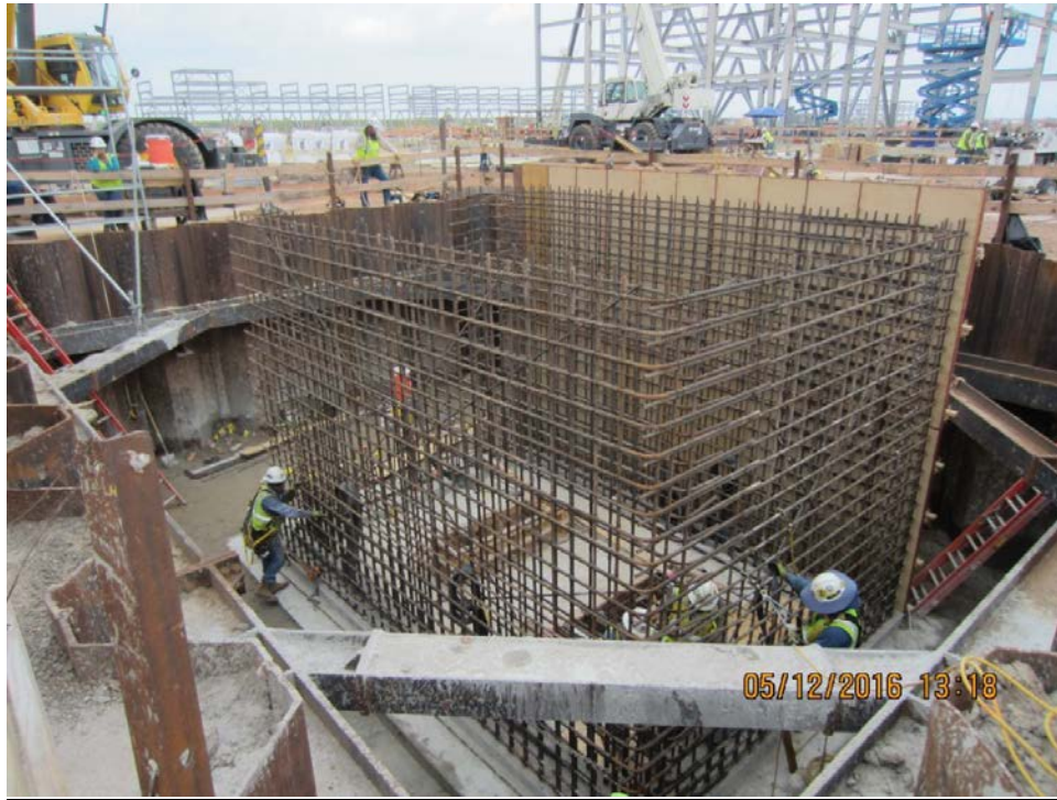
Train 1 – Amine Sump Walls