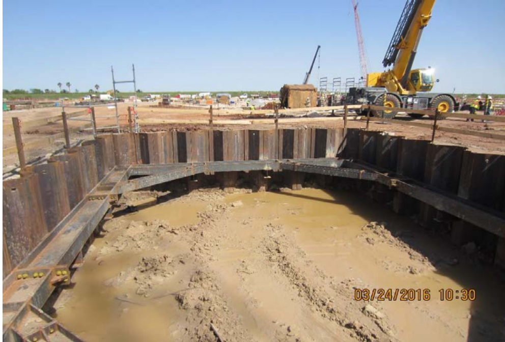
Train 1 – Amine Sump Walers