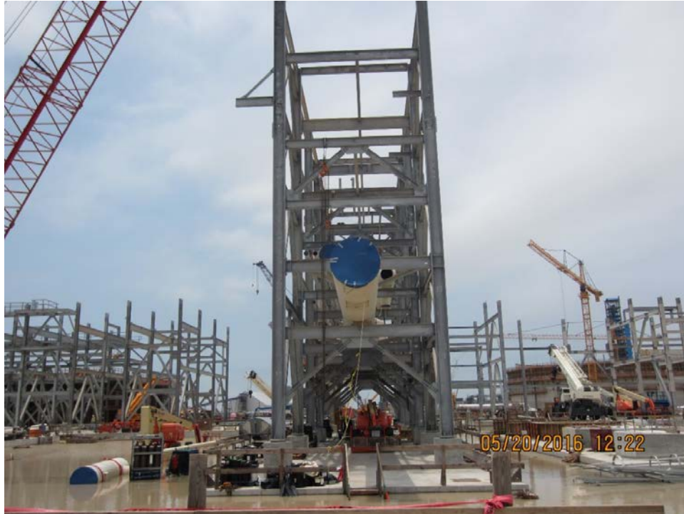
Train 1 - AG Pipe