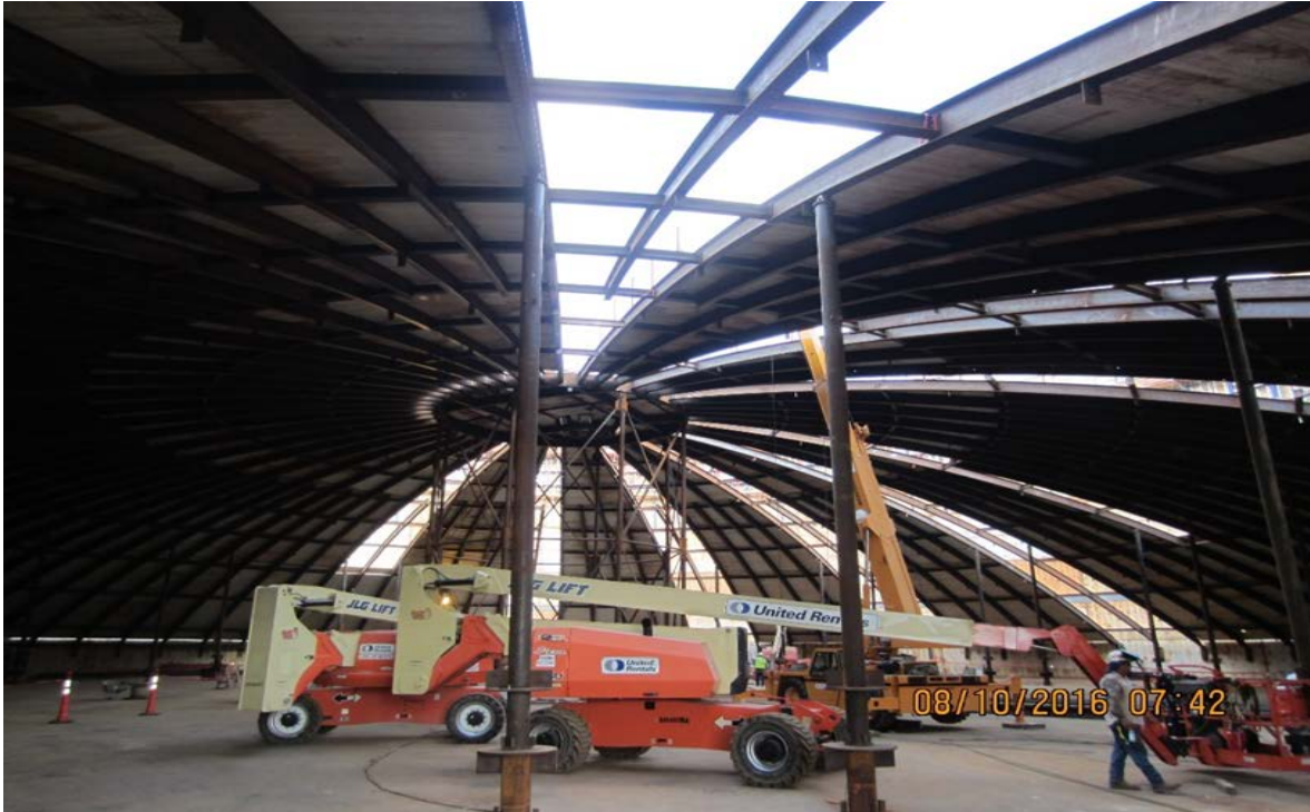
LNG Tank C - Roof Plates Construction