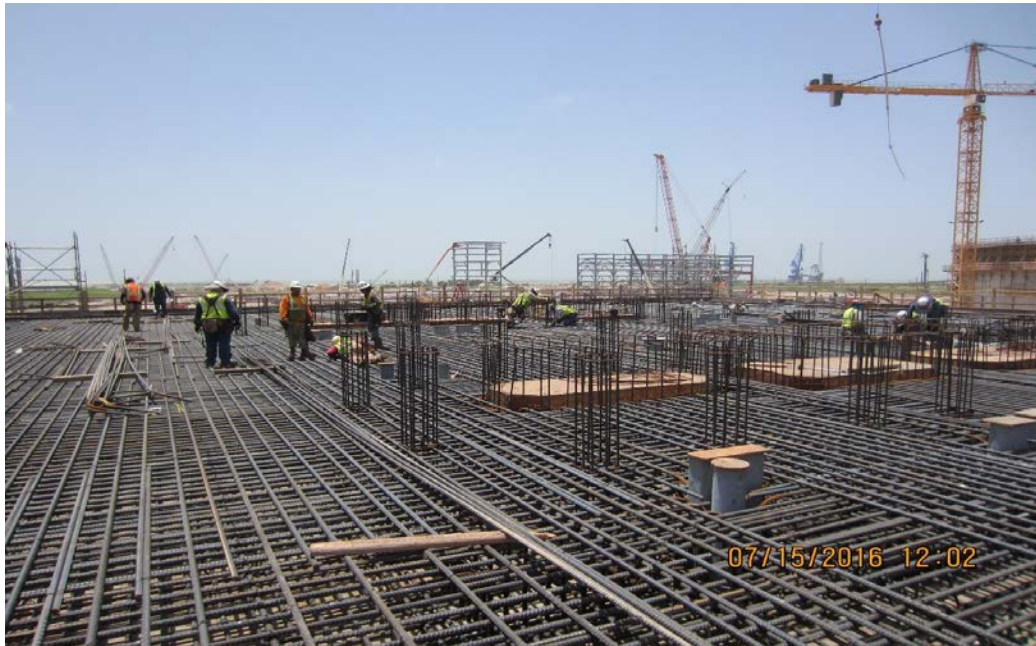
Train 1 - Methane Deck Rebar Installation