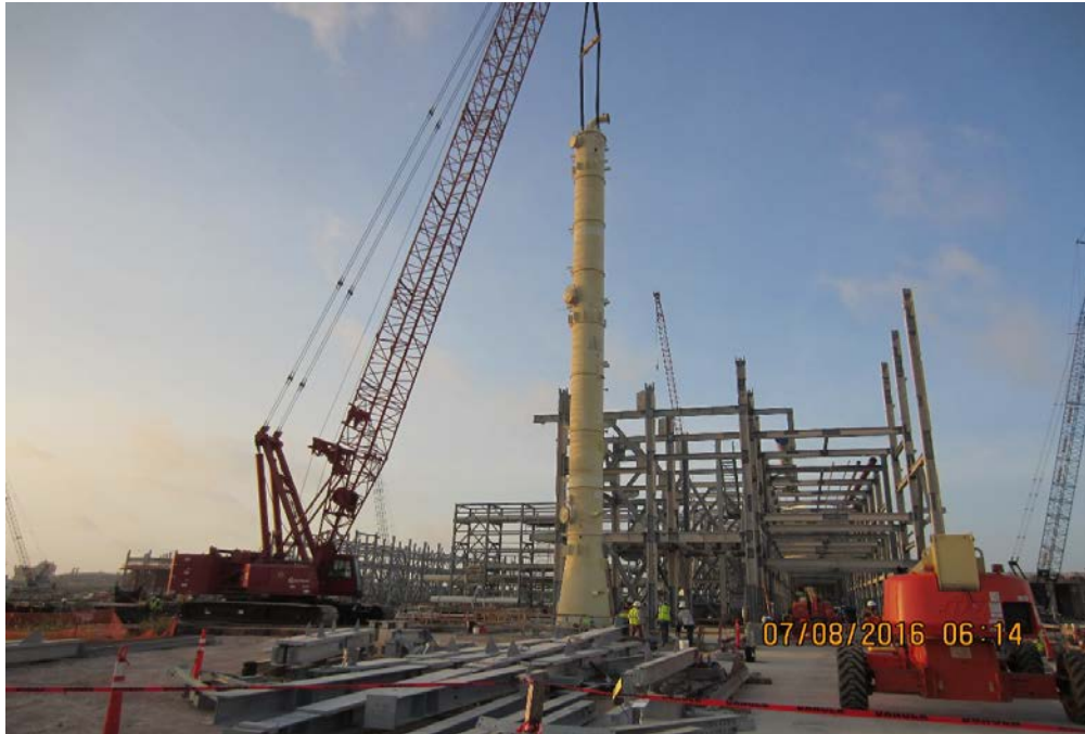
Train 1 - Setting Condensate Stabilizer