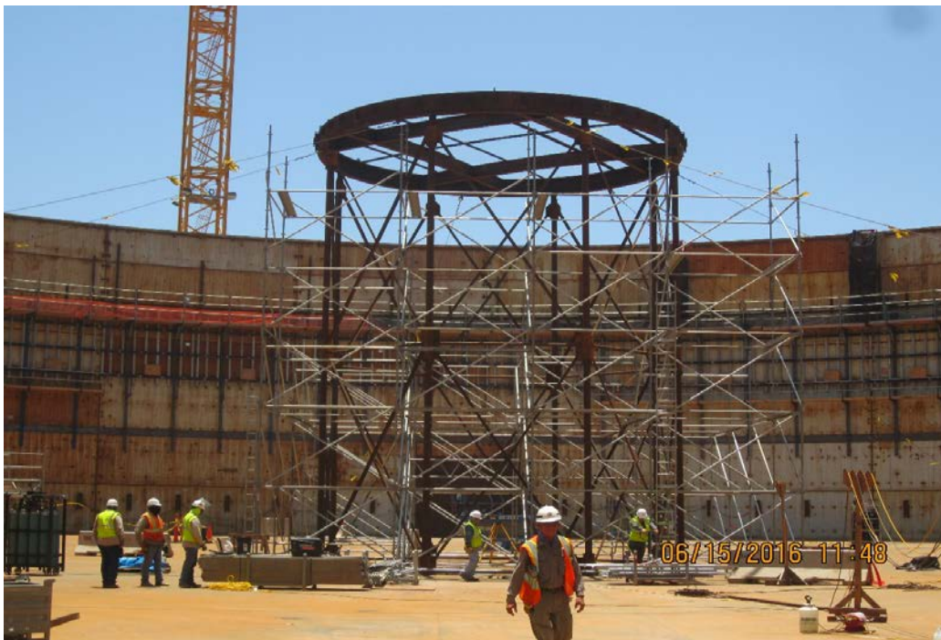
LNG Tank C – Interior Bull Ring Assembly