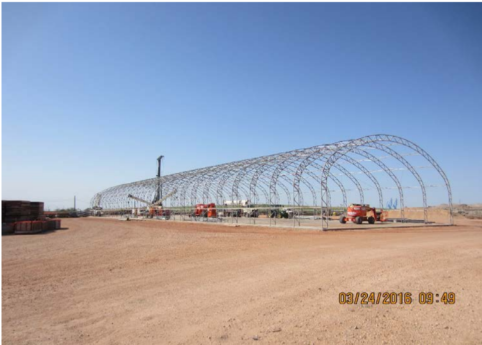
Lunch Tent near CMT