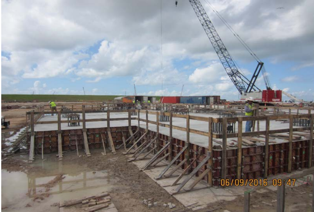
Train 2 – Foundation