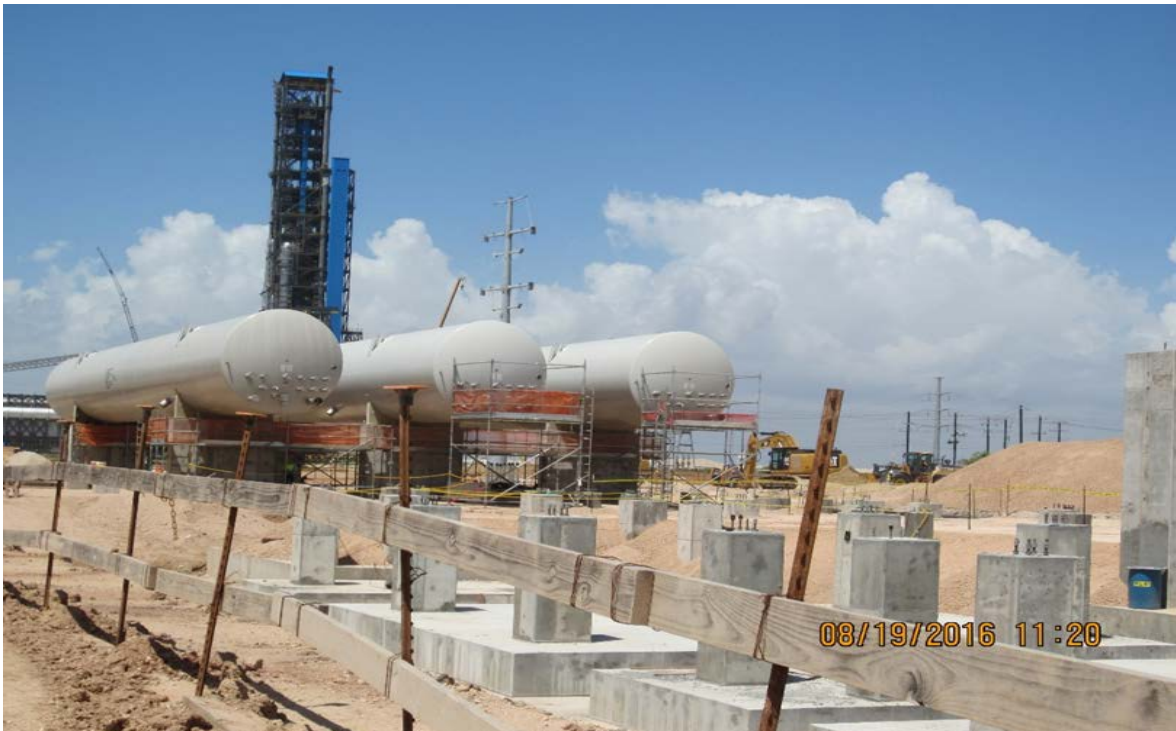
OSBL – Completed Setting Ethylene Storage Drums