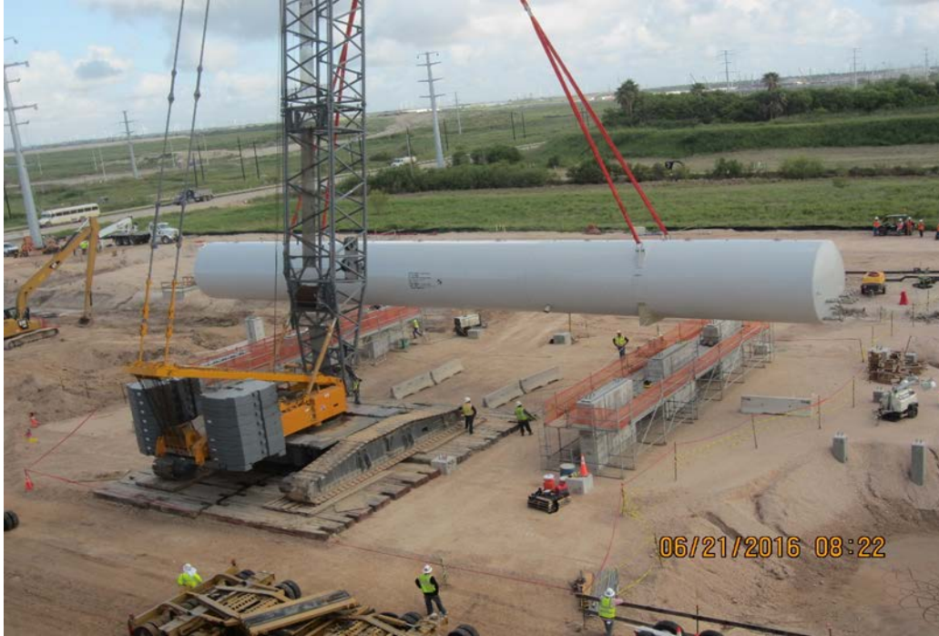
OSBL – Setting Ethylene Drum