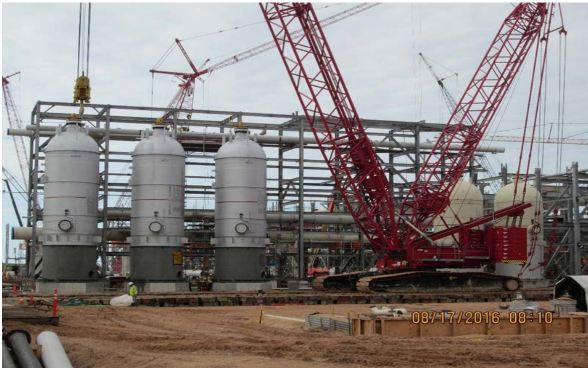
Train 1 –Molecular Sieve Dehydrators and Mercury Removal Beds Setting