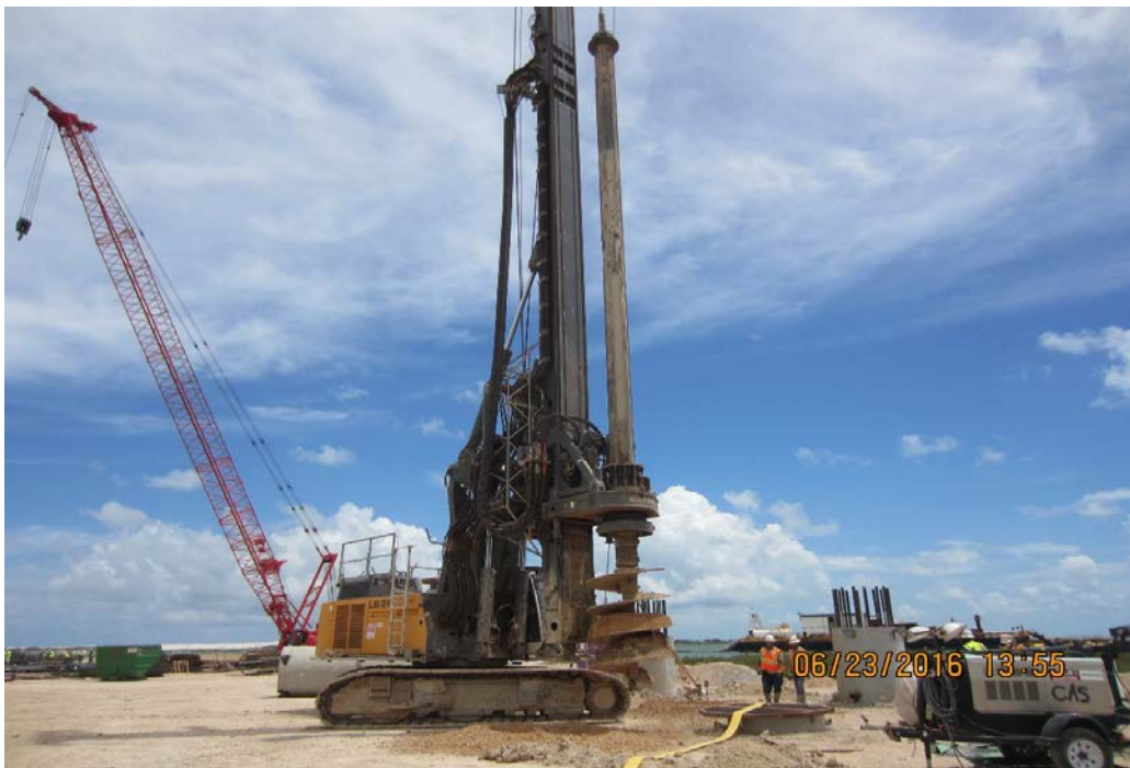
OSBL – East Jetty Shaft Drilling