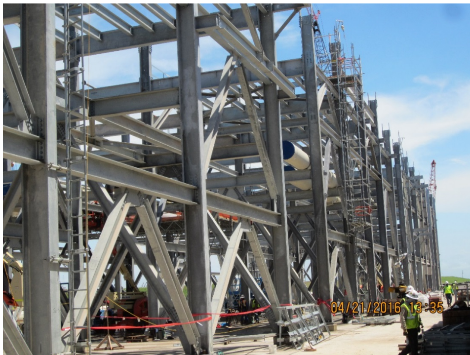
Train 1 – Steel and AG pipe