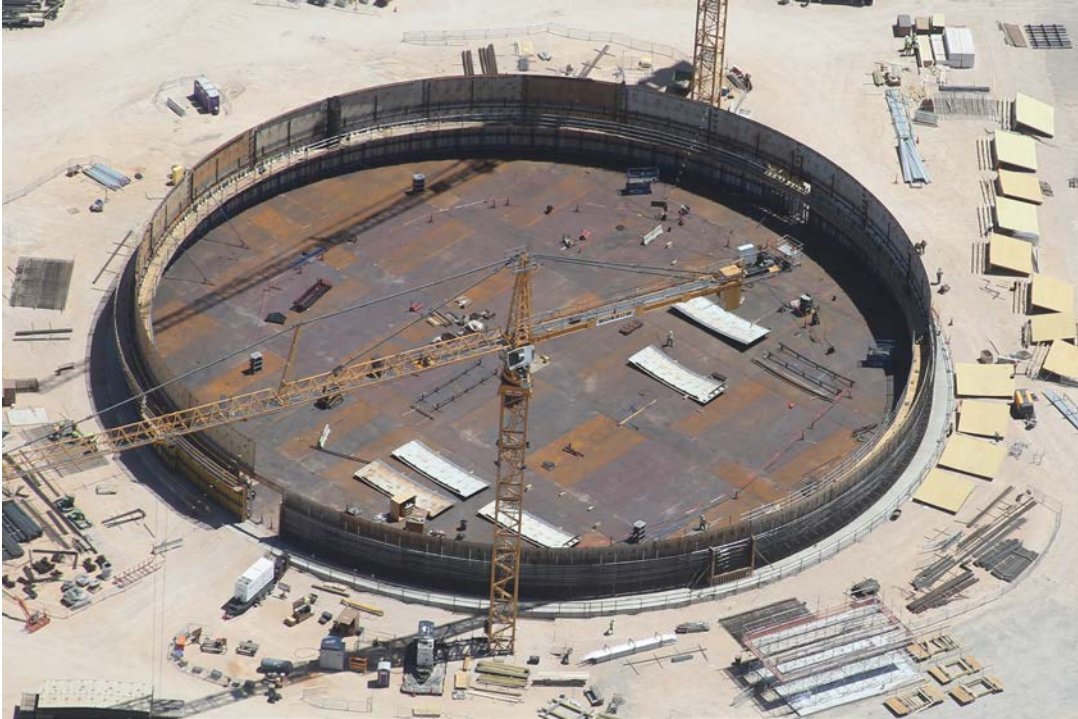
Tank C with the outer vapor barrier floor plate installed