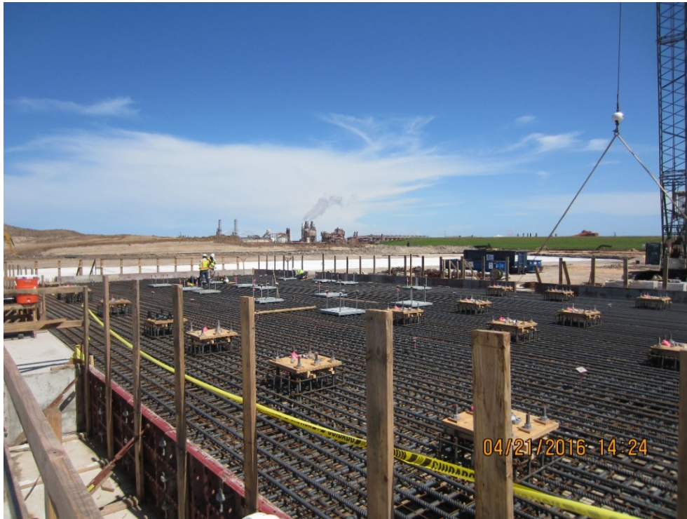
Train 2- Ethylene Cold Box foundations