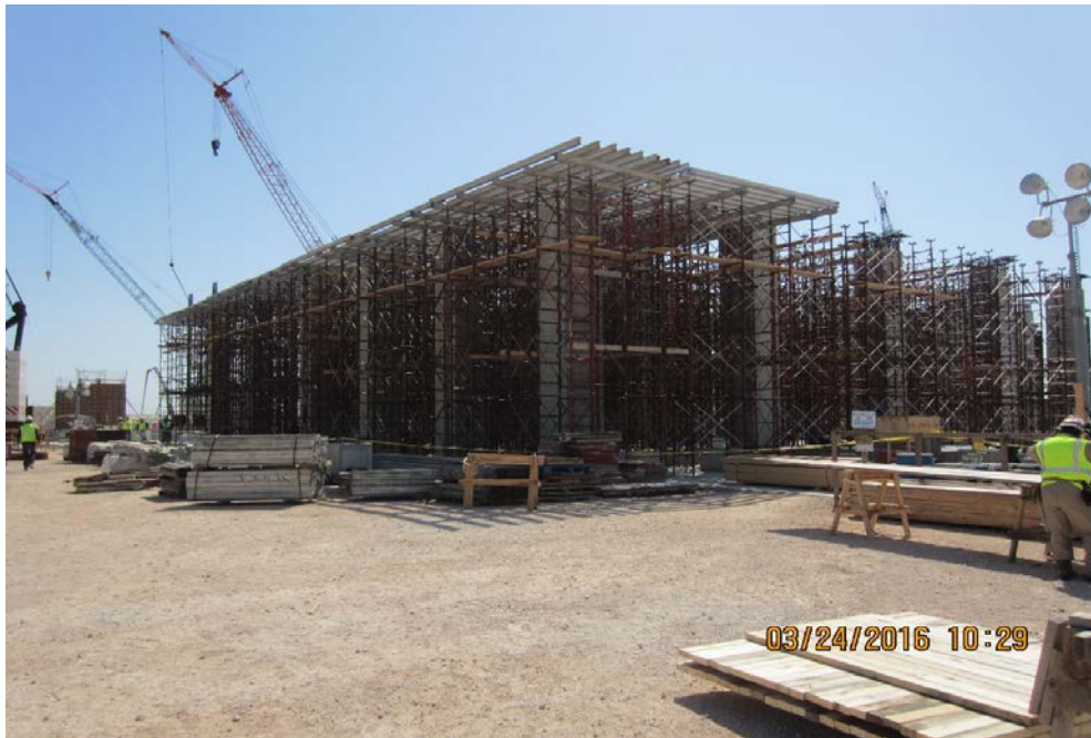
Train 1 – Propane Deck Shoring