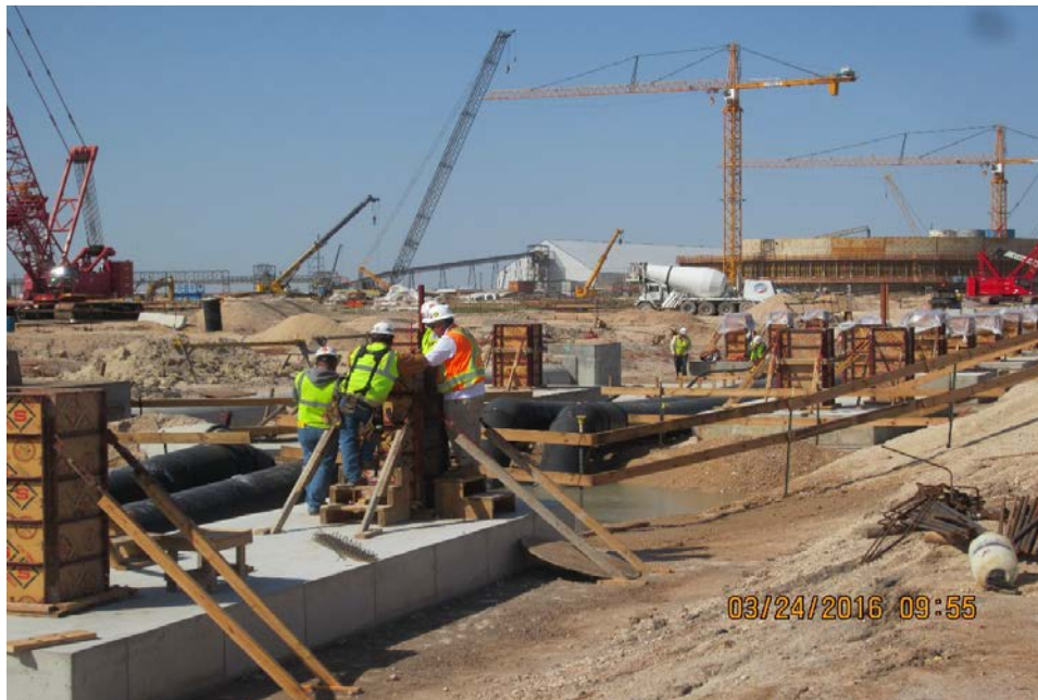
OSBL – Pedestals