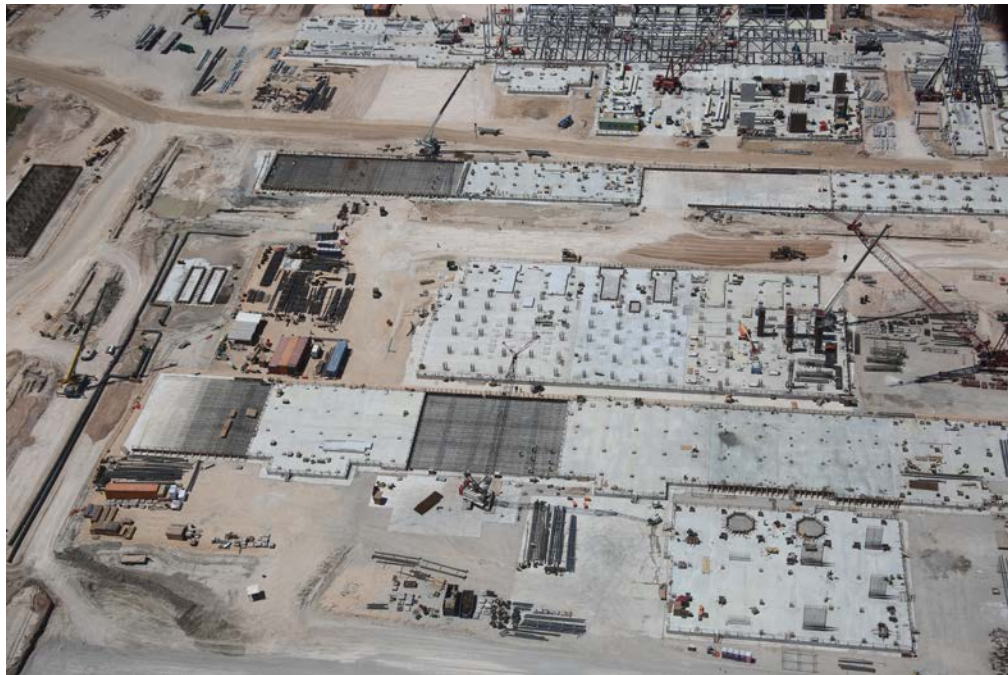
Train 2 Foundation work