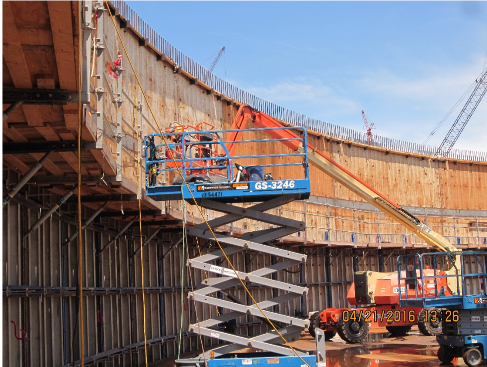
LNG Tank C - Wall lift 2