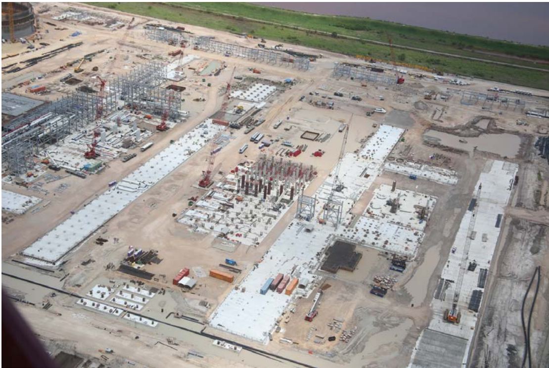
Train 2 Foundation Work and Wall Form