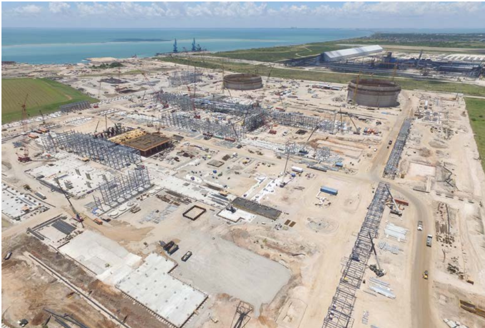
Overall Site View