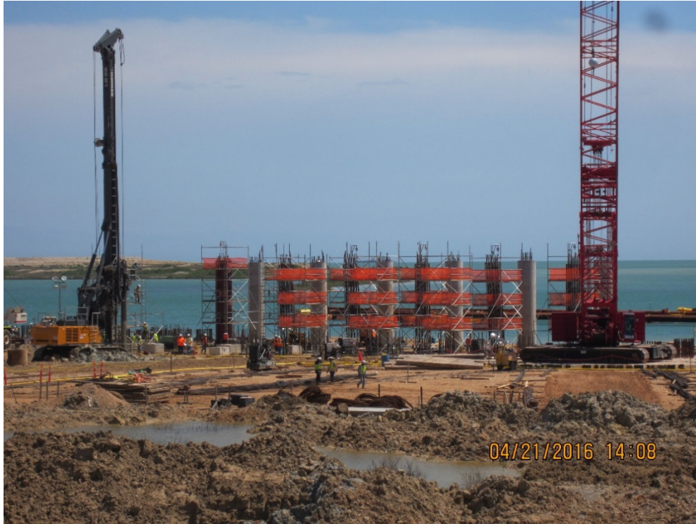
Marine – West Jetty loading platform columns