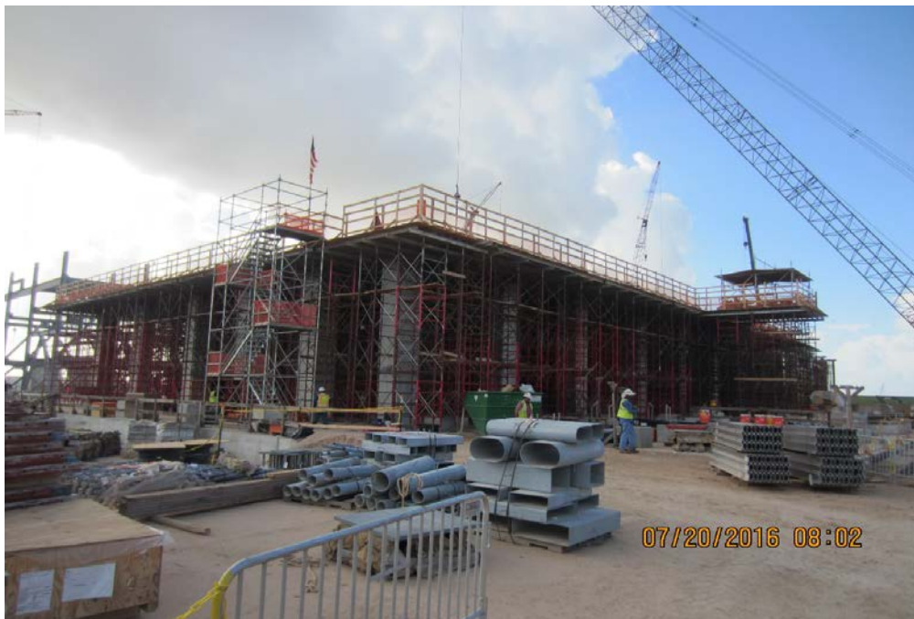
Train 2 - Compressor Deck Shoring