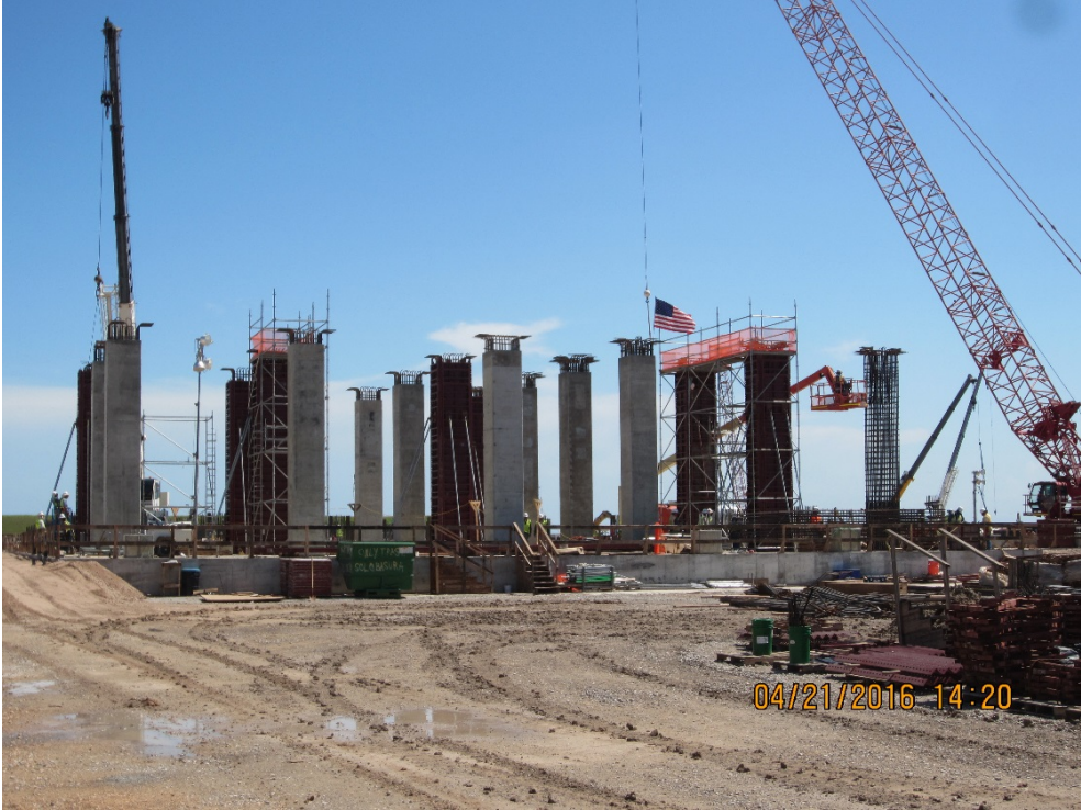
Train 2 – Propane Columns