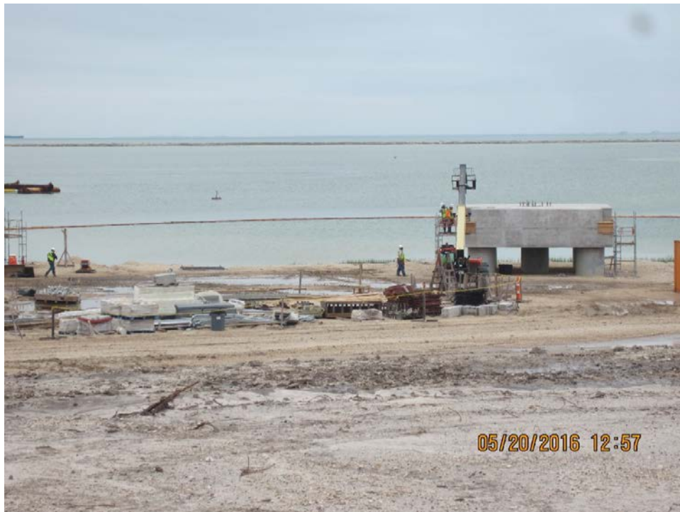
OSBL – West Jetty Mooring Dolphins