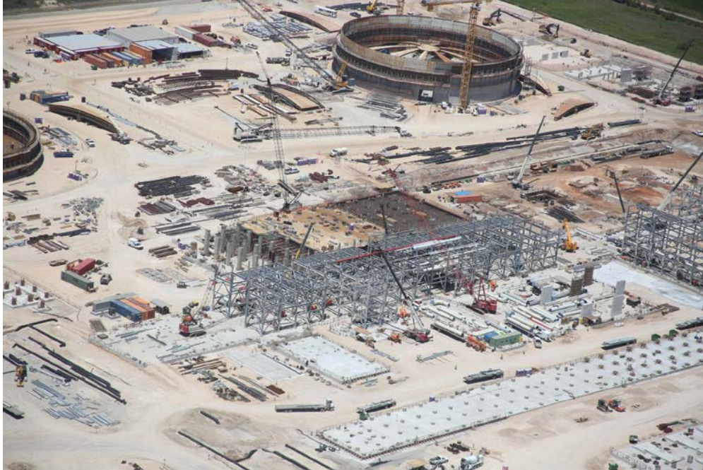
Train 1 Compressor Building and Cryo Rack