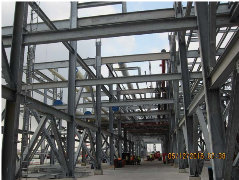
Train 1 – Pipe Rack