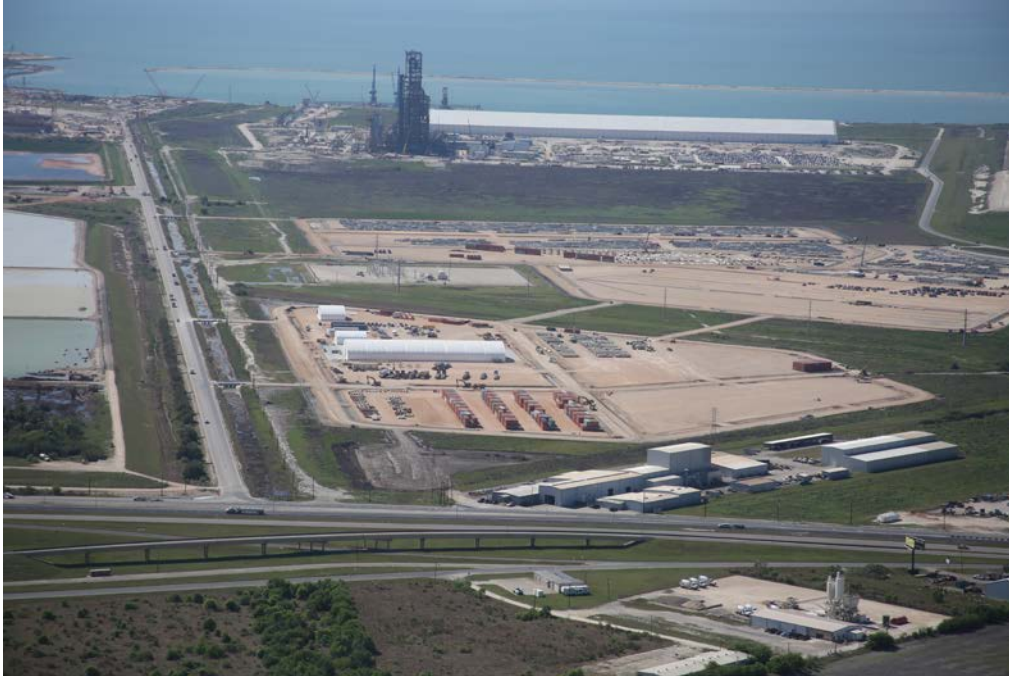
Developed laydown areas