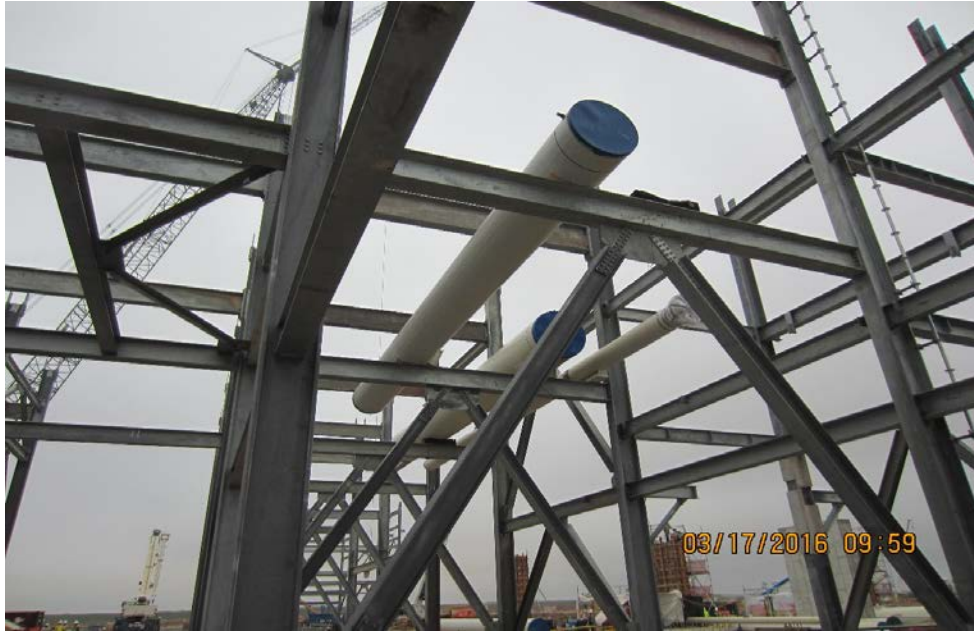
Train 1 – AG Pipe Installation