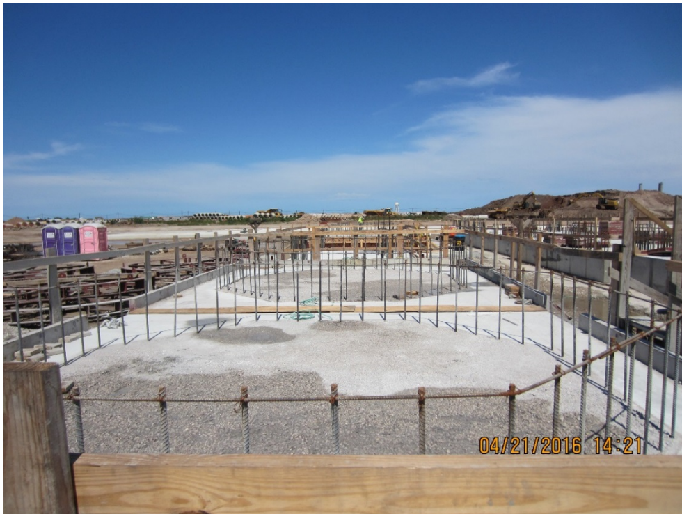
Train 2 – Mercury removal foundations