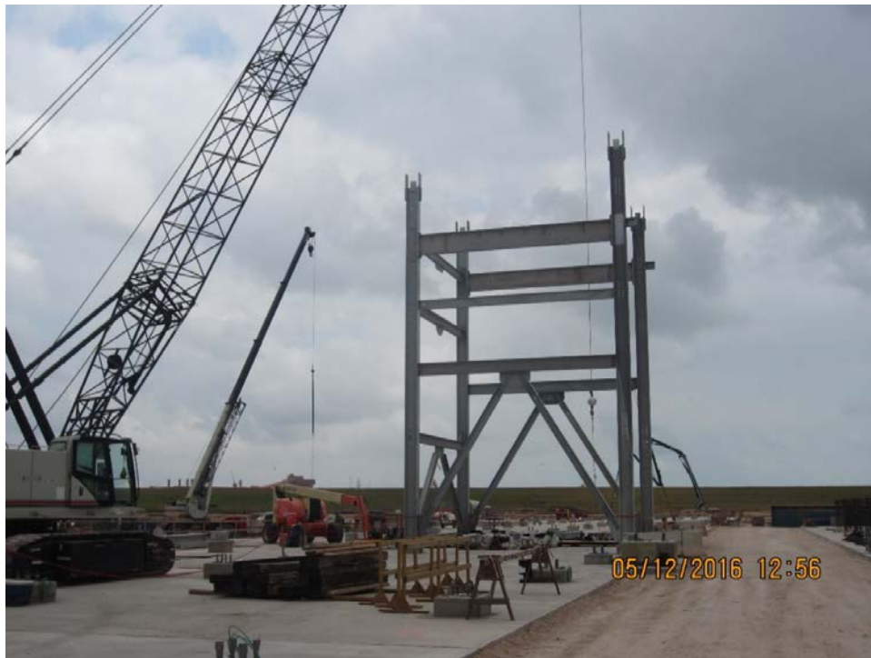
Train 2 - Pipe Rack