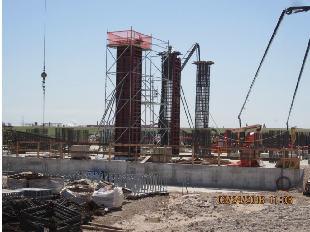
Train 2 – Propane Columns