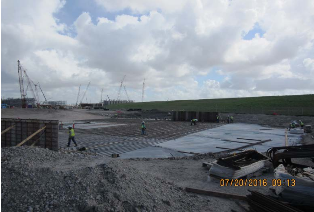
OSBL - Flare Foundation Rebar