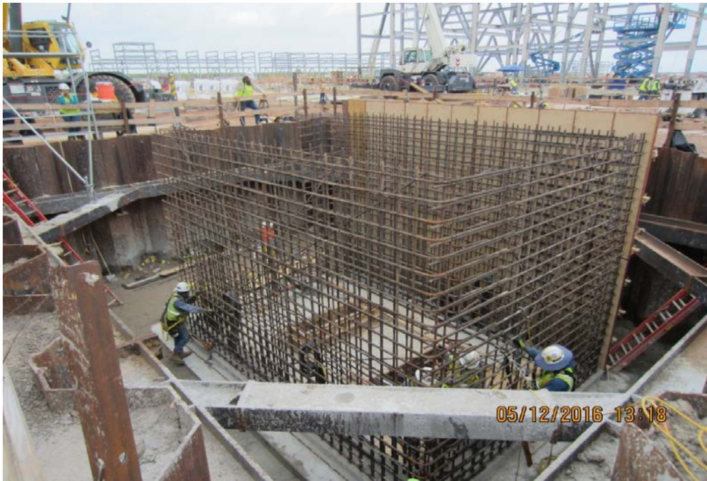
Train 1 – Amine Sump Walls