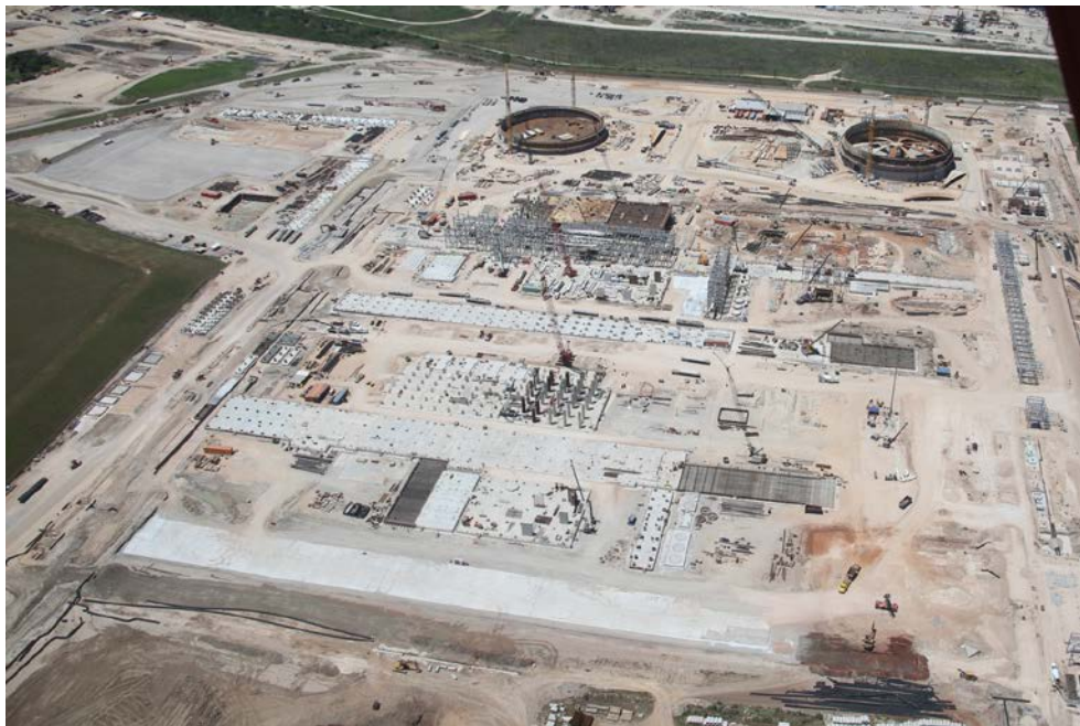
Train 2 Foundation work