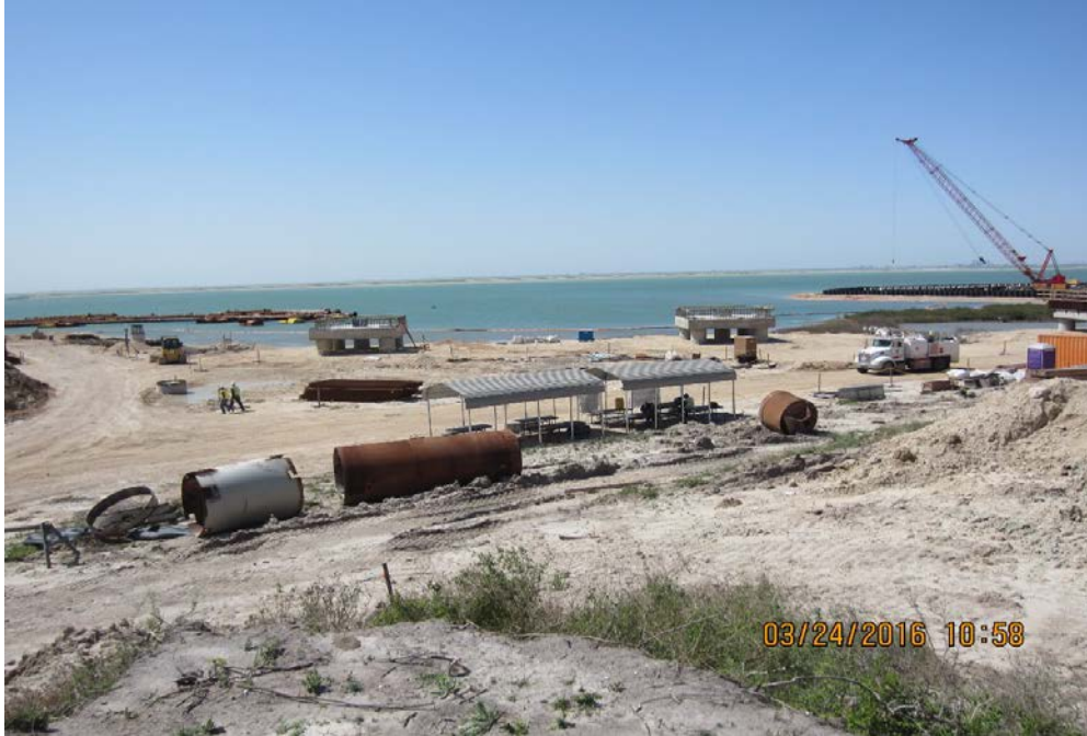
Marine - Mooring Dolphin Concrete Caps