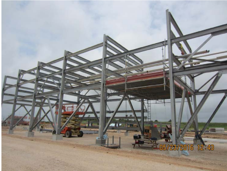
OSBL – Install A/G Pipe