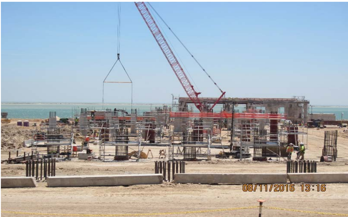
OSBL -MOF West Jetty Platform Columns