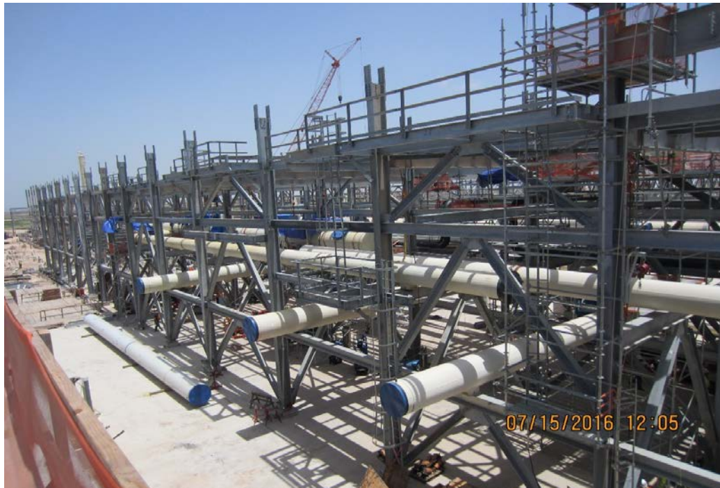
Train 1 - AG Pipe Installation