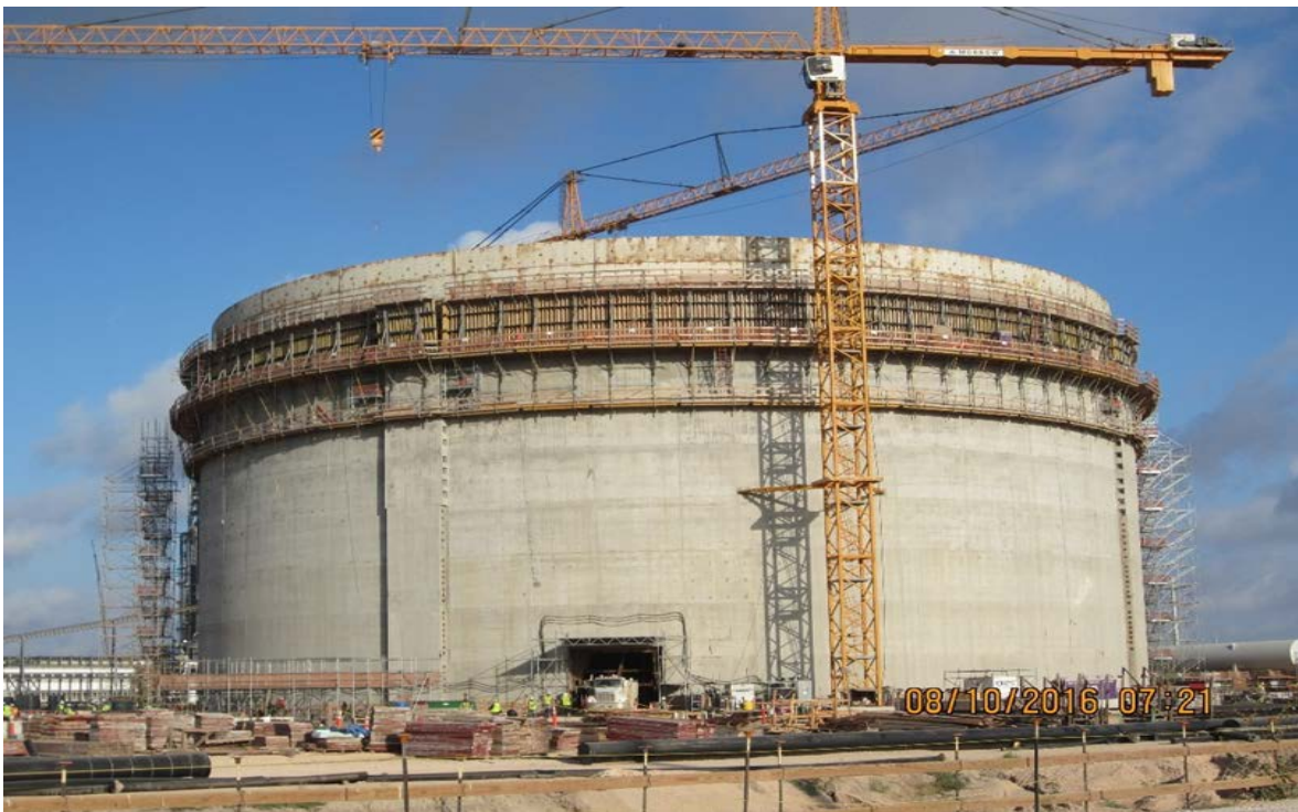
LNG Tank A –Completed eighth wall lift rebar and formwork installation