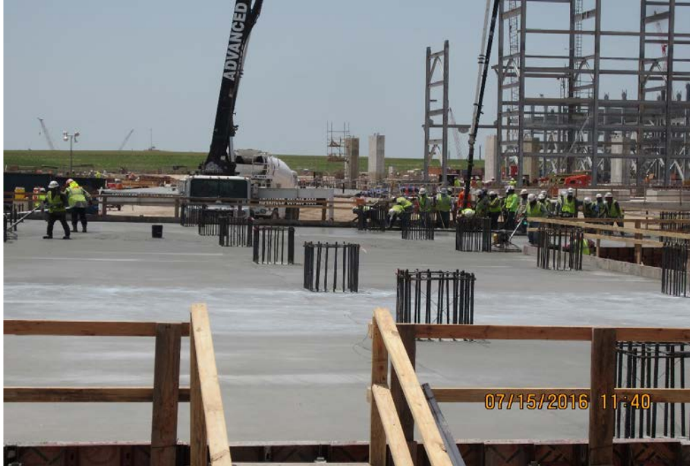
Train 2- Propane Condensers Pour 6