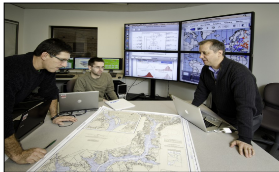
PNNL scientists and engineers can now connect and collaborate in this visualization lab—a space previously housing energy inefficient servers.

PNNL got more than they bargained for when sustainability and information technology managers consolidated five inefficient data centers into modern spaces and relocated four centers into a facility that uses a geothermal heating/cooling system. With a shift in space, cooling the central data center is now 50 percent more energy efficient and is yielding an annual energy cost avoidance of approximately $25,000.