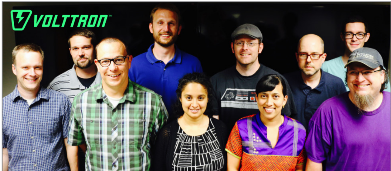
PNNL's VOLLTRON™ development team