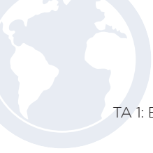
Table 10 Water-Energy Nexus