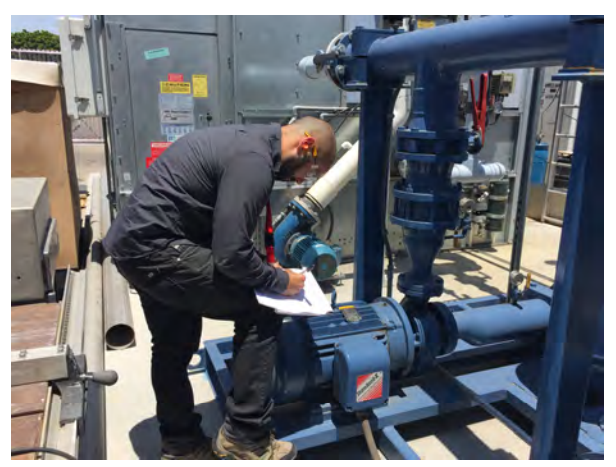
An Industrial Assessment Center (IAC) student examines pumps at an industrial facility.