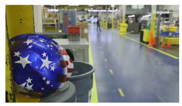
A September 2014 video developed by Legrand in partnership with DOE highlights Legrand's commitment to energy performance improvement, including the Supply Chain Initiative. View the video at <a href="https://www.youtube.com/watch?v=QLsAo2Y1QJ8">https://www.youtube.com/watch?v=QLsAo2Y1QJ8</a>)

As of 2015, UTC has recruited six suppliers into the program and Legrand has recruited eight. Both companies' supplier cohorts have set energy baselines, established energy metrics, and received industrial assessments at no cost. To date, 12 assessments have been conducted for supplier facilities, identifying 56 total energy-efficiency improvement recommendations with collective potential savings of $1.1 million a year and an average simple payback of less than a year (see Table 1).