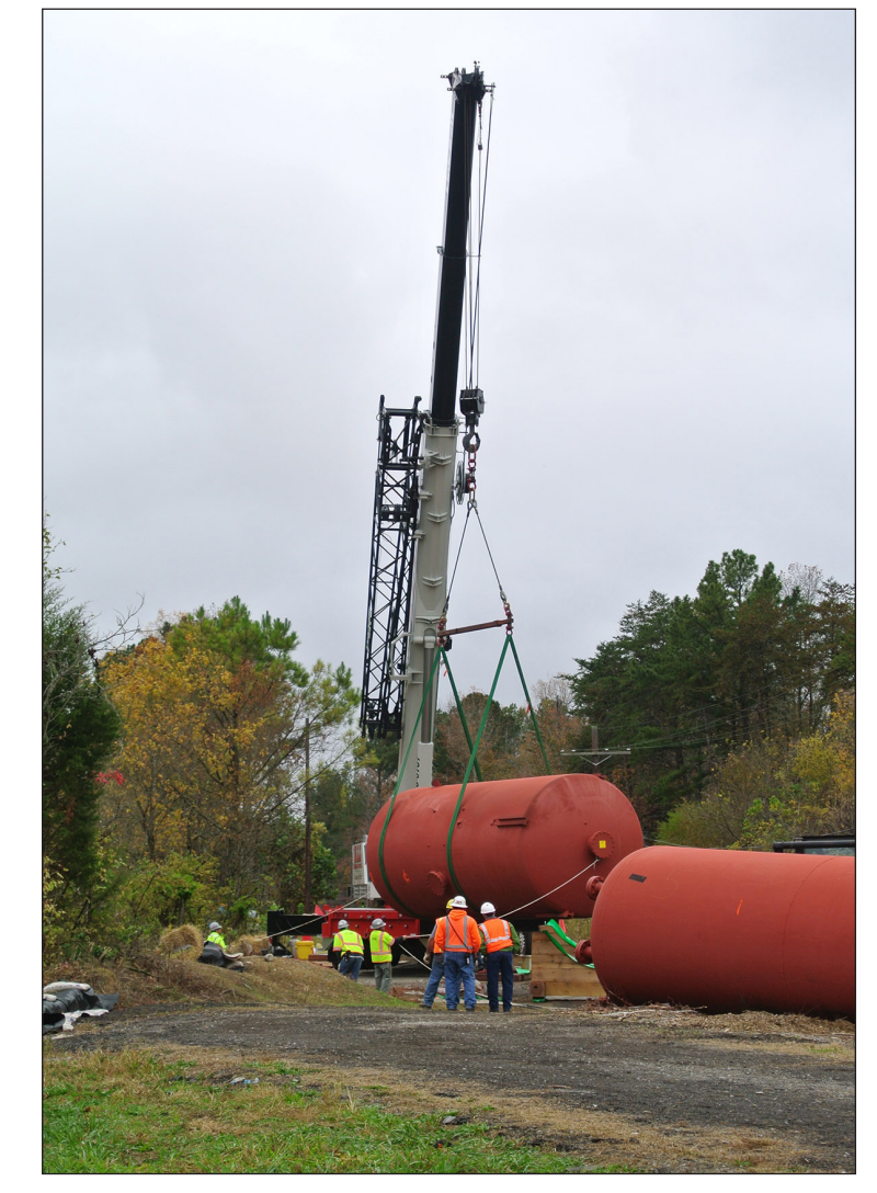
Abandoned tanks at the Y-12 Complex

The tank removal project was completed in FY 2013. Based on characterization results, two tanks were sent to the sanitary