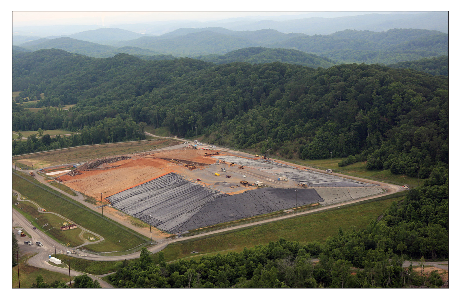
CERCLA Waste Facility

as well as wastes regulated under the Resource Conservation and Recovery Act and Toxic Substances Control Act from CERCLA-regulated cleanup work associated with the Oak Ridge Reservation. Potential wastes include soil, sludge, sediments, solidified waste forms, stabilized waste, vegetation, building debris, personal protection equipment, and scrap equipment.