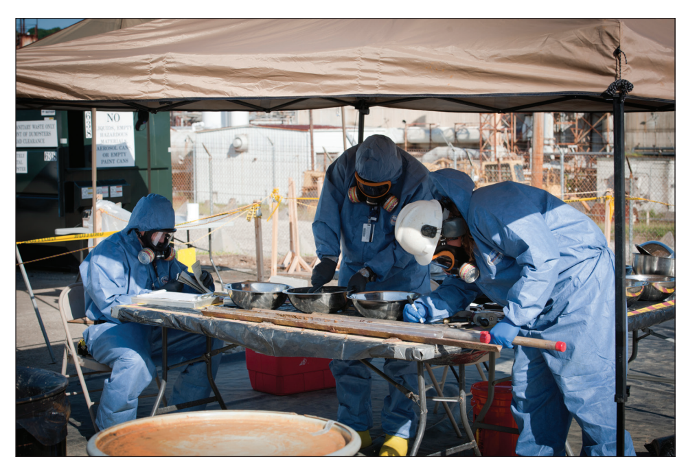
Workers prepare a soil sample for containerization at Exposure Unit 9

Characterization results were presented in a Technical Memorandum and indicated that a remedial action is required in the former 81-10 Area for protection of the industrial work force. The proposed remedial action is excavation of a 45-ft by 70-ft