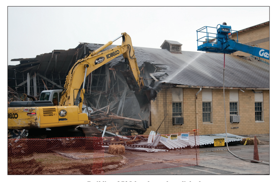
Building 9735 has been demolished.

The other six buildings that once comprised Engineering Row were demolished in 2008. Building 9735 was a two-story, masonry (glazed terra cotta tile), wood-truss structure with a slab-on-grade foundation. The south end consisted of a twostory rectangular structure with a former basement that housed a