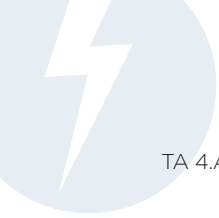
Table 4.A.5 Challenges and Desired Outcomes for Gasification and Coal/Biomass-to-Liquids

Gasification and CBTL - Develop advanced Gasification Systems 27 and Coal/Biomass-to-Liquids (CBTL) technologies 30 to reduce the cost and increase the efficiency of converting coal into power and transportation fuels with near zero carbon emissions.