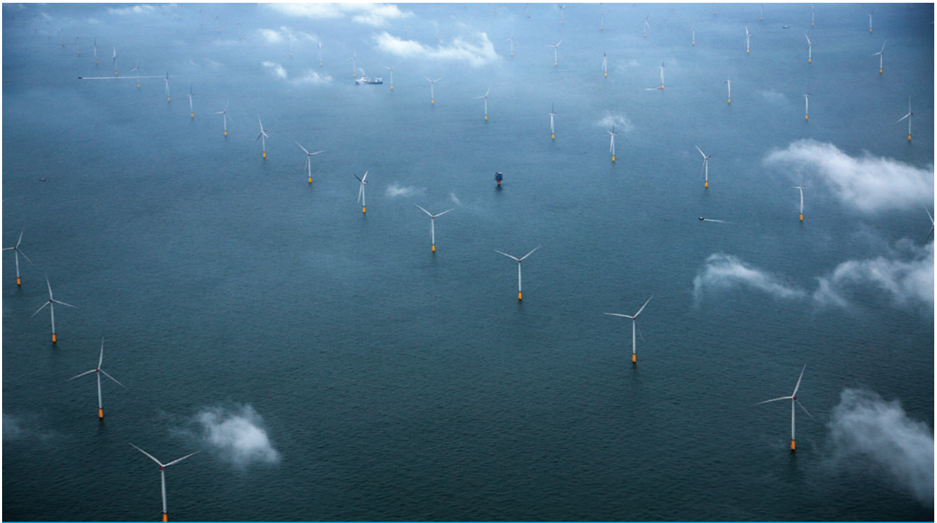
Aerial photography of the London Array wind farm.

information collected under A2e is being placed in the public domain and is accessible through the A2e Data Access Portal. Based on these results, new instruments will be developed to validate wind-plant inflow models and turbine wake interactions. Owner-operators looking to optimize plant production also require advanced flow monitoring integrated into plant level control systems.