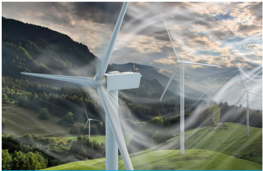
Illustration by NREL depicting the System Management of the Atmospheric Resource by Turbines (SMART) wind plant of the future to better understand how the Earth's atmosphere interacts with wind plants and maximizing energy extraction from the wind. Illustration by Josh Bauer, NREL 31411