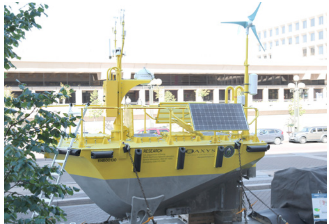
The WindSentinel™ is a floating LiDAR device that accurately measures wind speed and wind direction offshore at turbine hub-height and across the blade span.

Monitoring the behavior of the wind resource is critical to operating the wind plant for maximum energy production and cost performance. Accurately measuring the inflow, both spatially and temporally, is also essential in characterizing the wind resource and providing high-fidelity data for validating inflow prediction models. A field-test campaign conducted by