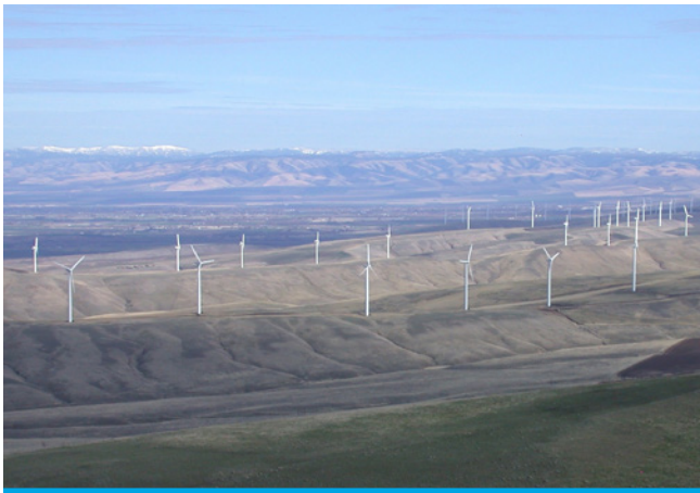
The 300-MW Stataline Wind Energy Center is located on VanSycle Ridge between the states of Washington and Oregon.

local flows into and around the wind plant in order to develop plant-level control capabilities.