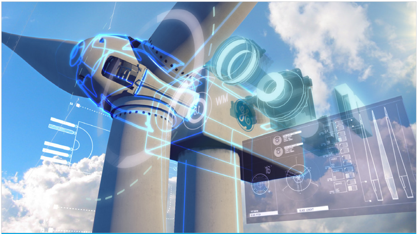
An industry example of a digital Wind Farm illustrating a 2 MW modular turbine individually configured to optimize performance across the wind farm. Illustration by GE Renewable Energy

Attaining future performance goals requires high-fidelity modeling and high-performance computing resources coupled with new state-of-the-art observations to examine and resolve the fundamental physics barriers limiting wind plant cost and performance. Understanding the atmospheric inflow and interaction with large wind farms and facilitating the development of next-generation SMART plant technologies will help achieve future wind penetration levels by lowering LCOE and mitigating technical barriers to wind plant deployment.