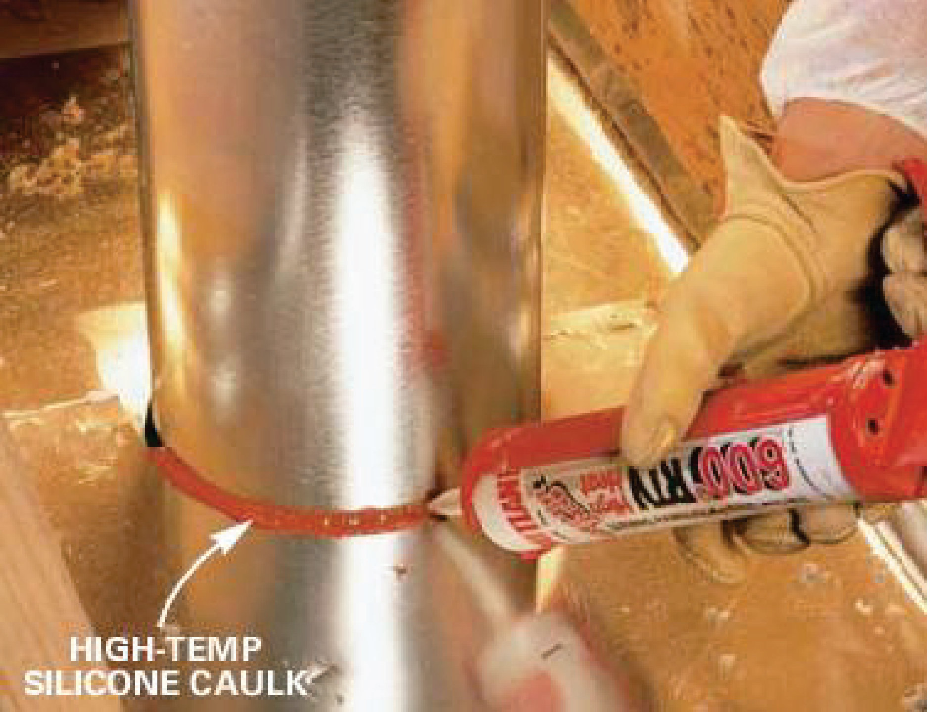
HIGH-TEMP SILICONE CAULK