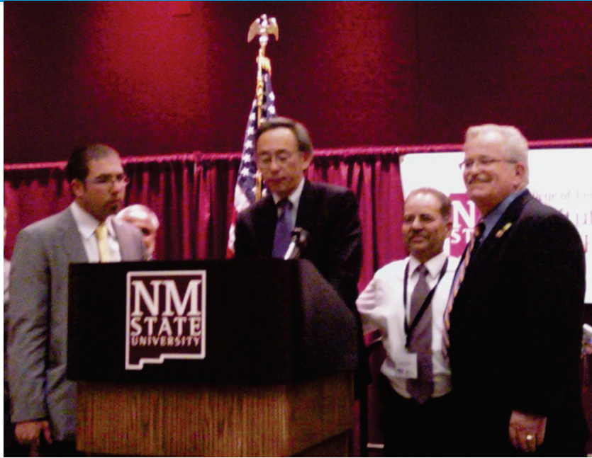
2009 DOE Secretary at RE conference and NM Congressman Harry Teague (NM-Las Cruces)