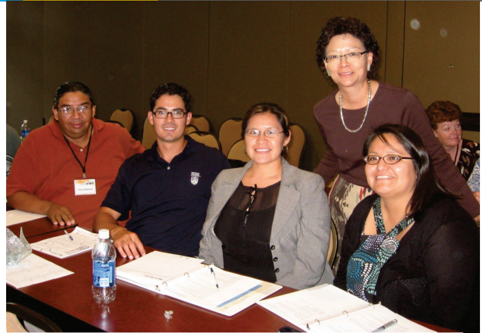
2009 Interns participation at SWRE (AZ – Flagstaff)