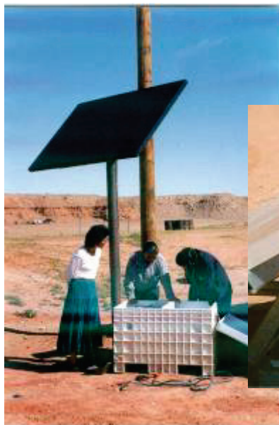
Business potential realized