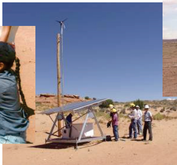
Battery bank powered by hybrid design