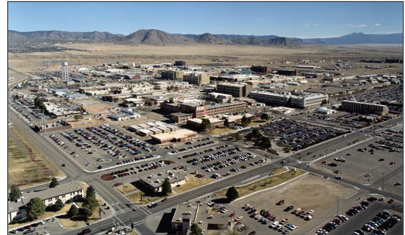
New Mexico Site - Albuquerque, New Mexico