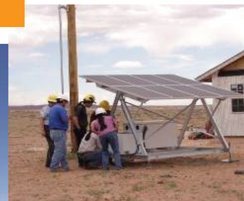
Economic Development: Units assembled on Navajo Nation