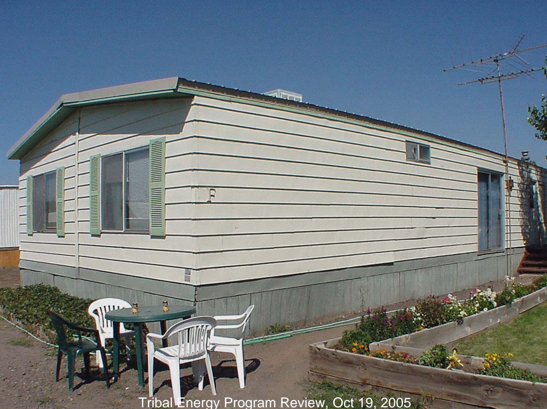
Tribal Energy Program Review, Oct 19, 2005