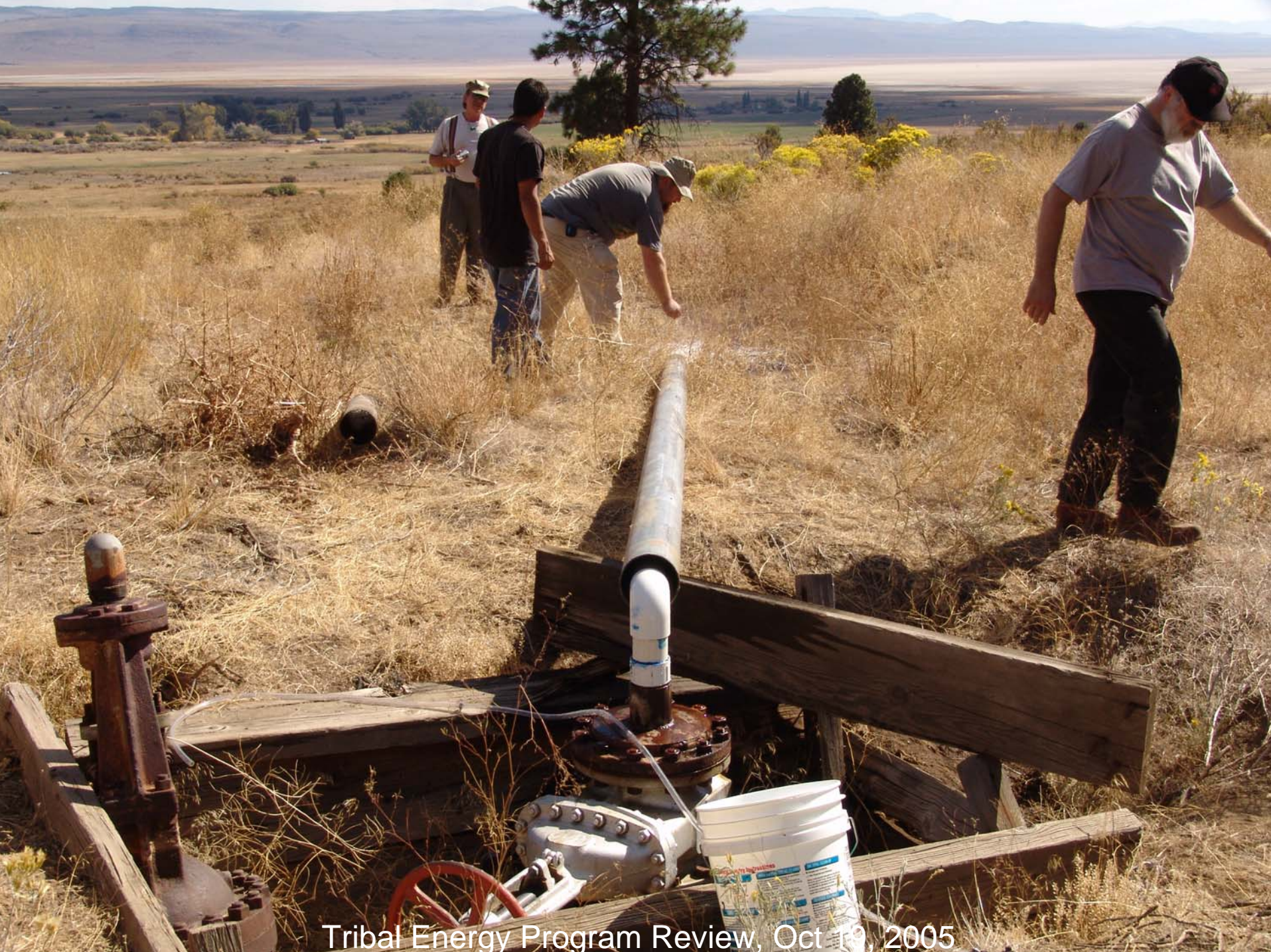
Tribal Energy Program Review, Oct 19, 2005