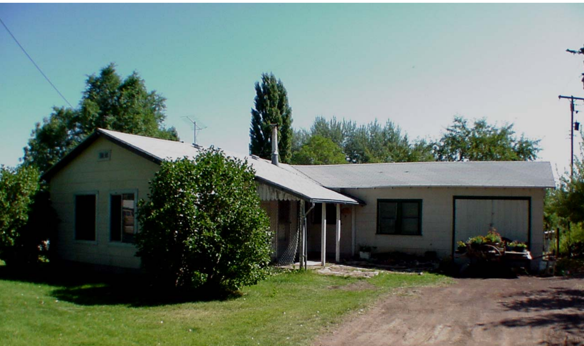
Tribal Energy Program Review, Oct 19, 2005