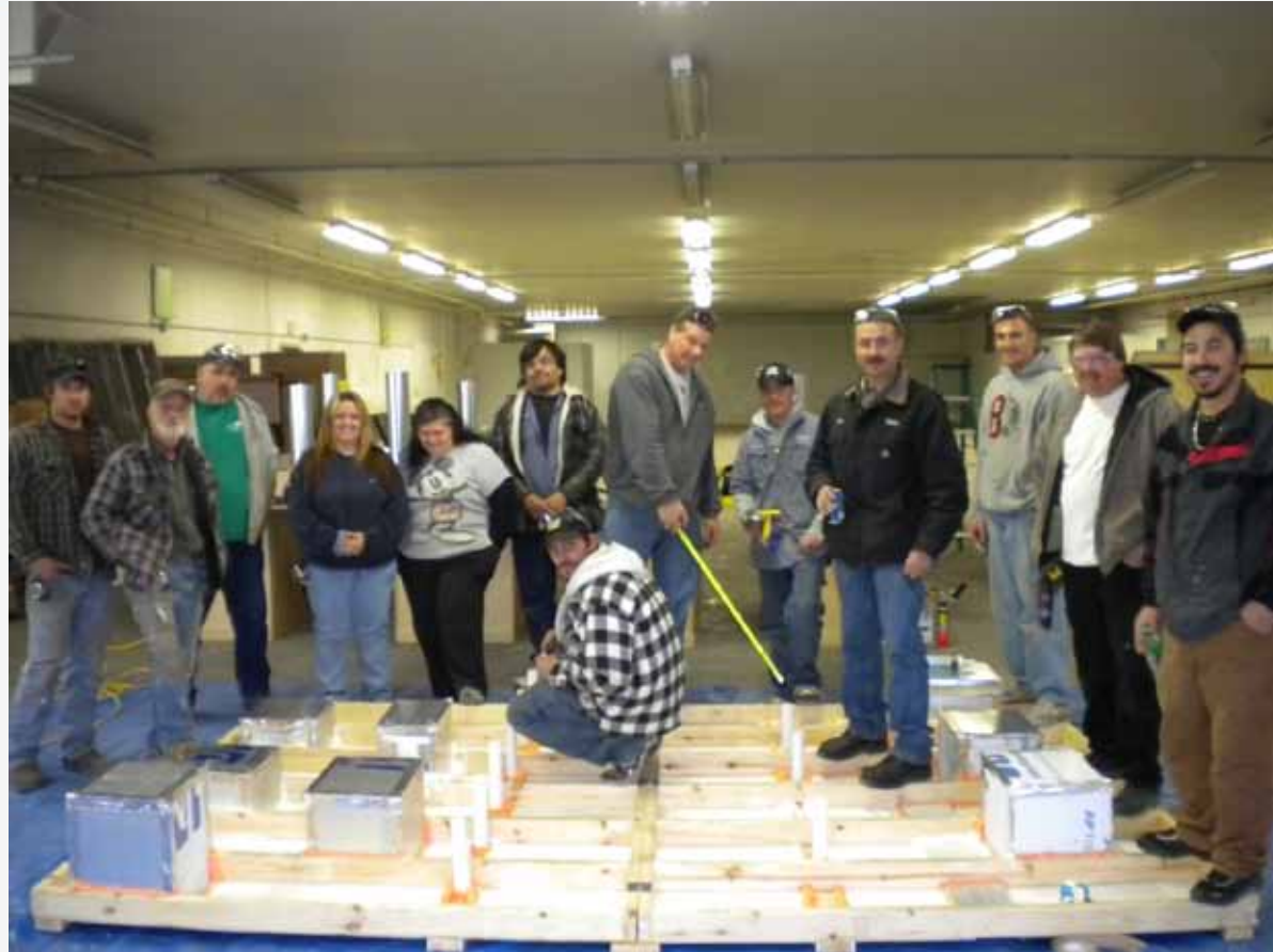
Keweenaw Bay Indian Community Training Baraga, Michigan