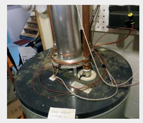
Instrumented water heater at a field-test site