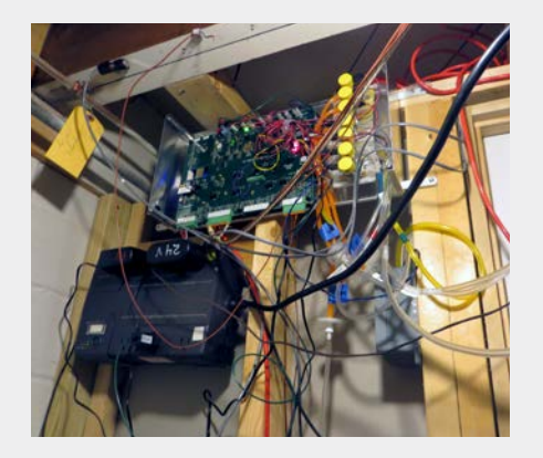
Field data collection hardware

For more information see the Building America report Combustion Safety Simplified Test