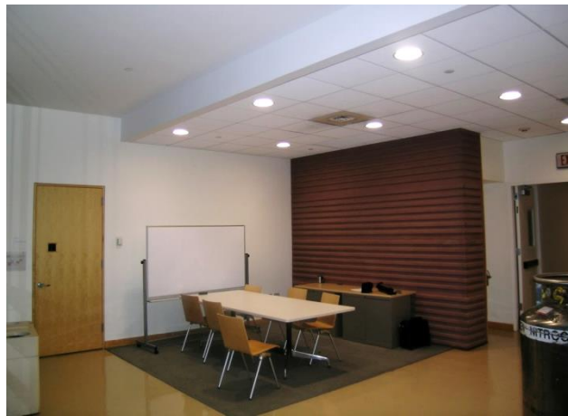
Figure 6: Conference area 200 COR, showing the downlights that were converted from CFL to LED.