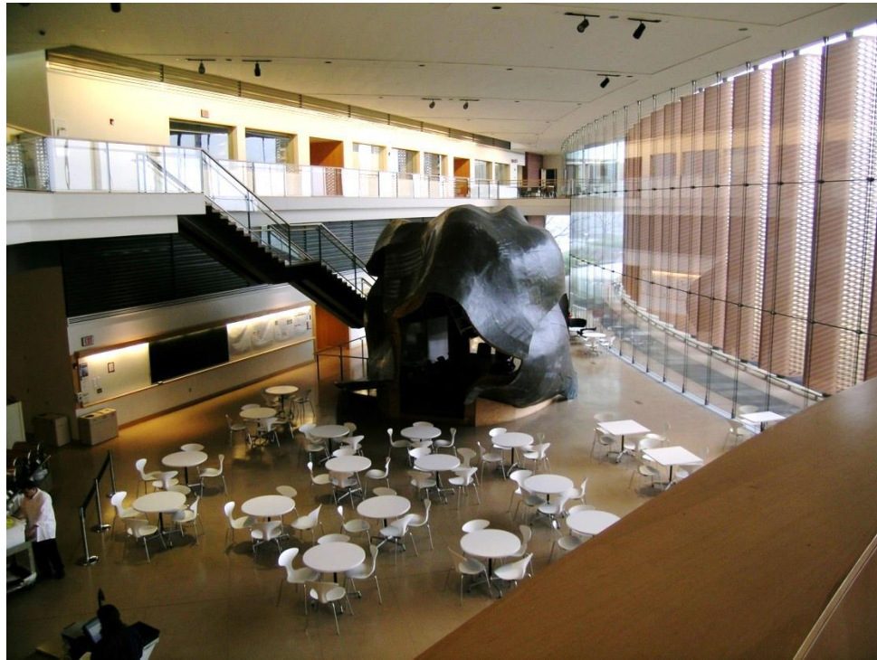
Figure 2: Two photos of the atrium space in Princeton University's Carl Icahn Laboratory, showing the two-story glass curtain wall and the external shading structures. The large sculpture was designed by Frank Gehry, and houses a conference room. The interior walls form the boundary for the laboratory wings, and were originally illuminated with linear fluorescent cove lighting. The fluorescent lamps in these luminaires were replaced with LED retrofit kits.

Most of the original lighting in the laboratory and office spaces consisted of recessed 2x2 fluorescent troffers, with supplemental linear fluorescent cove lighting in perimeter areas and a relatively small number of recessed 2x4 fluorescent troffers. Of the 564,000 kWh of energy used annually for lighting in the facility, about 43% was from the 2x2 fixtures and 30% from the 4' linear lamp fixtures. Figure 3 shows a typical lab space, with the