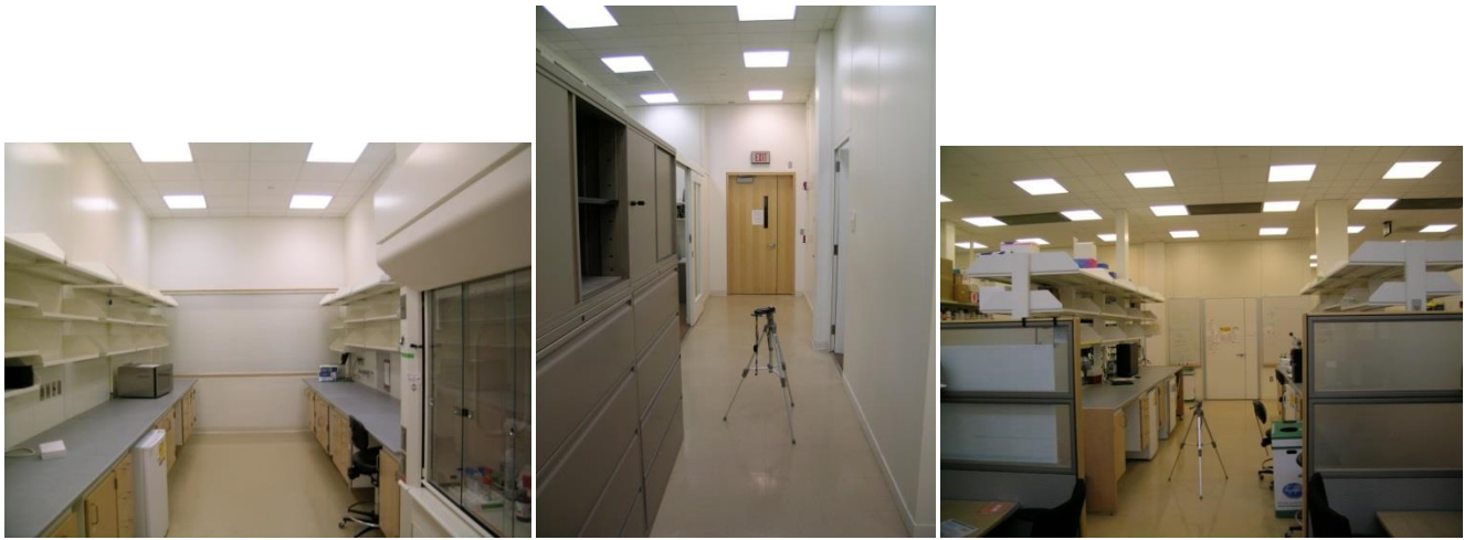
Figure 5: Room 222 (left), Corridor 233 (center), and Lab Area 110 (right).