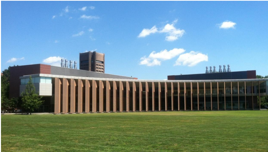
Figure 1: The Carl Icahn Laboratory at Princeton University. The external shade structures are shown at the front of the photo; these devices automatically track the sun to provide shading for the two-story atrium. The two laboratory wings extend above the atrium roof line, one on the north (left side of the photo) and one on the east (right side of the photo).

While the University has implemented many exterior lighting projects and a few smaller interior projects, 4 the Carl Icahn Laboratory of the Lewis-Sigler Institute for Integrative Genomics is the first building-wide interior LED project. The Carl Icahn Laboratory is a 98,000 square foot facility, with two separate three-story wings (a basement level plus two above-ground levels) that are connected by a curving, two-story atrium space. The building was designed by Rafael Viñoly and completed in January 2003. The curving two-story glass atrium curtain wall is shielded by 31 external vertical louvers, each 40 feet tall, that automatically rotate with the sun to maximize shade, minimize thermal loading, and reduce cooling load. The computer-controlled aluminum louvers are patterned to project a double-helix DNA-style shadow onto the atrium floor as a dynamic interplay of light and shadow. Figure 1 and Figure 2 show the primary architectural features of the facility.