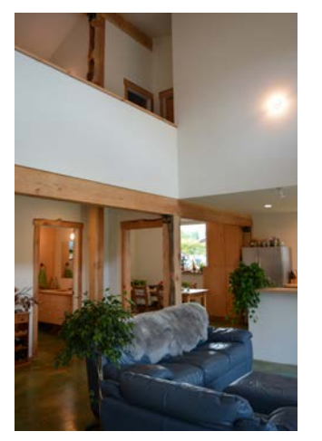
The home's concrete floors provide thermal mass for passive heating and cooling.

In this home, in addition to the HRV, Clifton also experimented with an earth tube ventilation system. The earth tube is a 4-inch-diameter pipe that passes through the ground to bring outside air into the home after being tempered by the roughly 55-degree ground temperatures. Clifton installed four loops of pipe around the foundation of the home at a depth of 2 feet and a length of 100 feet before he backfilled. One end opens outside of the home and one end opens inside the home. When the range hood fan operates, it passively draws outside air into the home through the tube. Because of the tempering effect of the earth, even if outside temperatures are 20 degrees, the air entering the home will come in at a temperature of about 50 to 55 degrees, said Clifton, who is monitoring