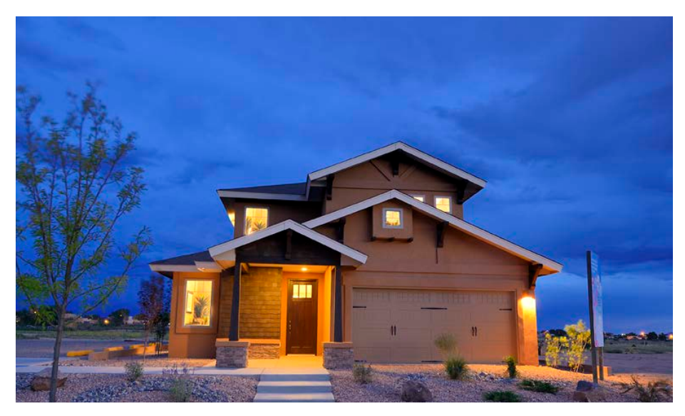
Palo Duro uses xeriscaping with native plants and water-conserving irrigation practices to limit water usage.

The home's high-efficiency heating and cooling system includes mini-split heat pumps with a heating efficiency of 9.5 HSPF and a cooling efficiency of 16.5 SEER. The minisplits were installed above the main floor ceiling and ducts were run between the floors of the two-story home. Keeping the ducts out of the unconditioned attic minimizes the number of holes in the ceiling deck, which could be air leakage points, and also improves the efficiency of the heating and cooling system, which doesn't have to overcome the temperature extremes often found in unconditioned attics. To help ensure healthy air in the draft-free home, Palo Duro installed an energy recovery ventilator (ERV).