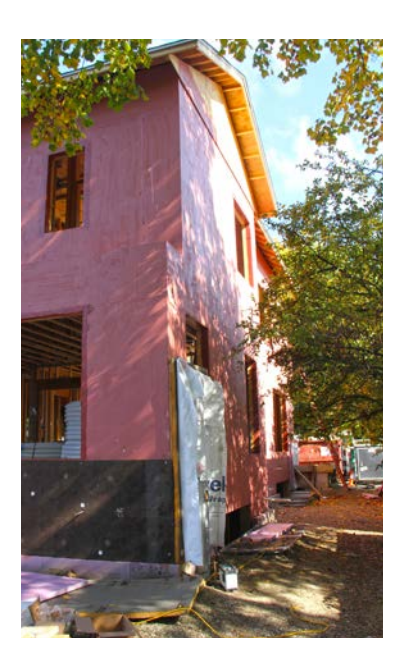
A liquid-applied weather-resistant barrier plus 4 inches of rigid foam exterior insulation help provide a superior building envelope.

imaging to determine if there were any density issues in the insulation installation. Weiss's crews also tested core samples of the fiberglass BIBs insulation and weighed them to ensure proper density. The home's airtightness was tested by Weiss again with the blower door after drywalling to check for improvements following implementation of airtight drywall techniques.