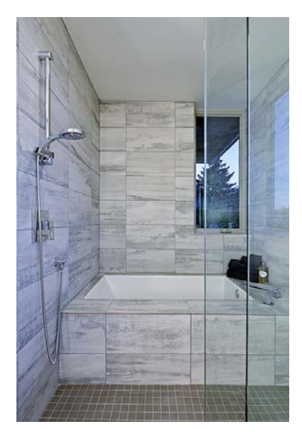
All of the home's plumbing fixtures are EPA WaterSense-labeled.

The home's heating system includes in-floor radiant heat with hot water provided by an on-demand gas-fired boiler. No air conditioner was installed because it will not likely be needed in the highly insulated home, which has windows and doors on all three levels for cross ventilation. However, conduit was roughed in for refrigerant should the home owners wish to install it in the future.