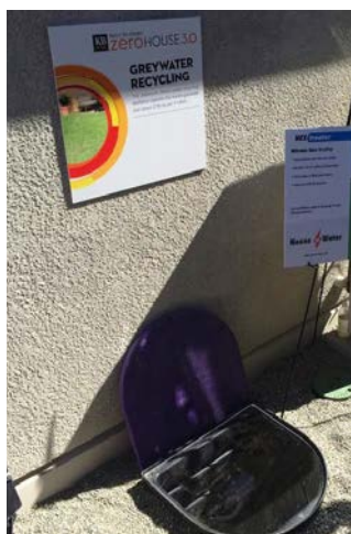
A greywater recycling system is one of many innovative features in the Double ZeroHouse 3.0.

The 2x4 16-inch on-center framed walls used advanced framing details like 2-stud corners, insulated headers, and ladder blocking at intersecting walls to provide more space in the walls for the R-15 dense-packed cellulose. A continuous layer of 1-inch-thick (R-4) EPS foam board is installed on the exterior walls. The taped rigid foam serves as a drainage plane behind the California one-coat stucco.