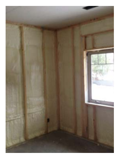
Three inches of closed-cell spray foam provide a low-permeable, air sealing and insulating layer in the wall cavities.

Ventilation to the tight home is provided by a heat recovery ventilator (HRV). The HRV provides balanced ventilation, bringing in and exhausting equal amounts of air. The two air streams cross in a heat exchanger that transfers heat from the warmer path to the cooler path to minimize heat losses in the winter and heat gains in the summer. The air passes through a high-filtration MERV 16 filter. In addition, exhaust fans in the bathrooms are controlled by motion detectors to remove moisture from showers and baths.