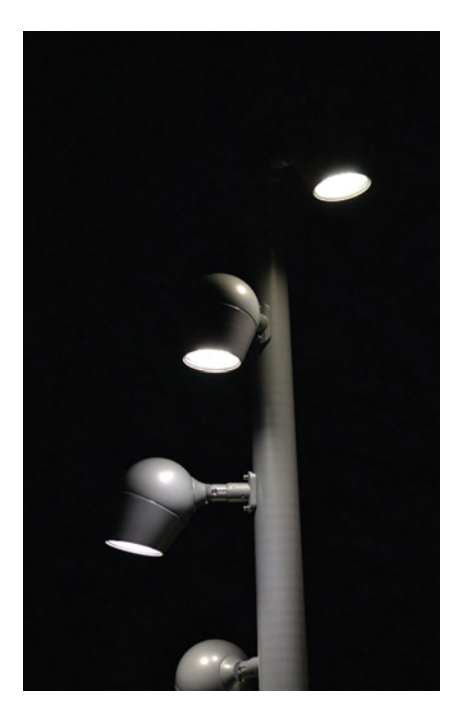
Selux Olivio pedestrian-scale luminaire rated Outstanding.

Among winning products, the various luminaire-driver-control configurations