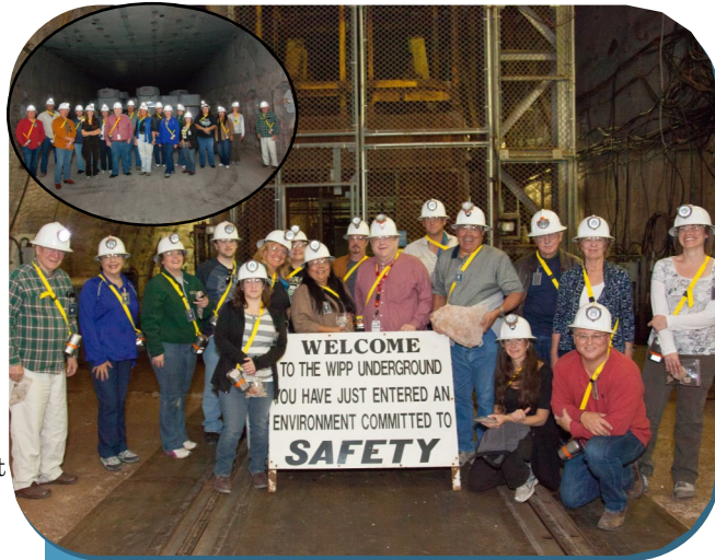
NNMCAB members and staff at the base of the elevator 2,100 feet underground at the WIPP site November 5, 2013 (PIP members in the disposal panel)

Permian Age "Waste Disposal Rooms carved out of 250-million-year-old salt formation"