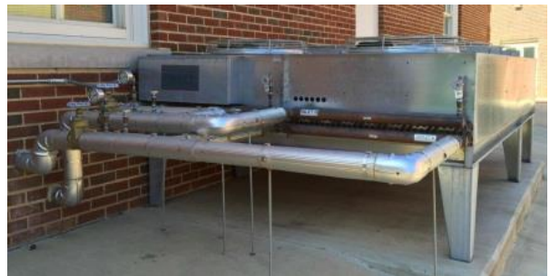
A typical industrial cooling tower on the University of Alabama campus

Industrial cooling towers are utilized to remove heat from a variety of sources such as machinery, furnaces and heated process, etc. Energy conservation measures (ECMs) for improving industrial cooling tower operation efficiency including fan and pump speed control have been proposed to IAC clients. However, a systematic and scalable, yet simple and relatively accurate, approach to estimate annual energy performance of industrial cooling towers is still lacking. Comparisons of an effectiveness-NTU method with an empirical model using field data from past AIAC clients will be conducted and a recommended model will be proposed. Total annual cost of operation with different ECMs will be estimated based on the proposed model and field measurements.