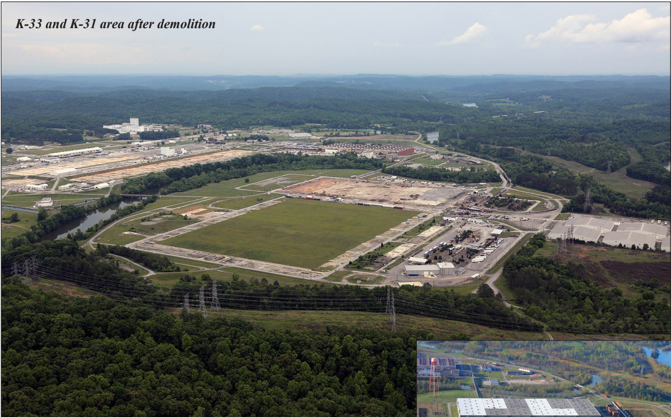
K-33 and K-31 area after demolition