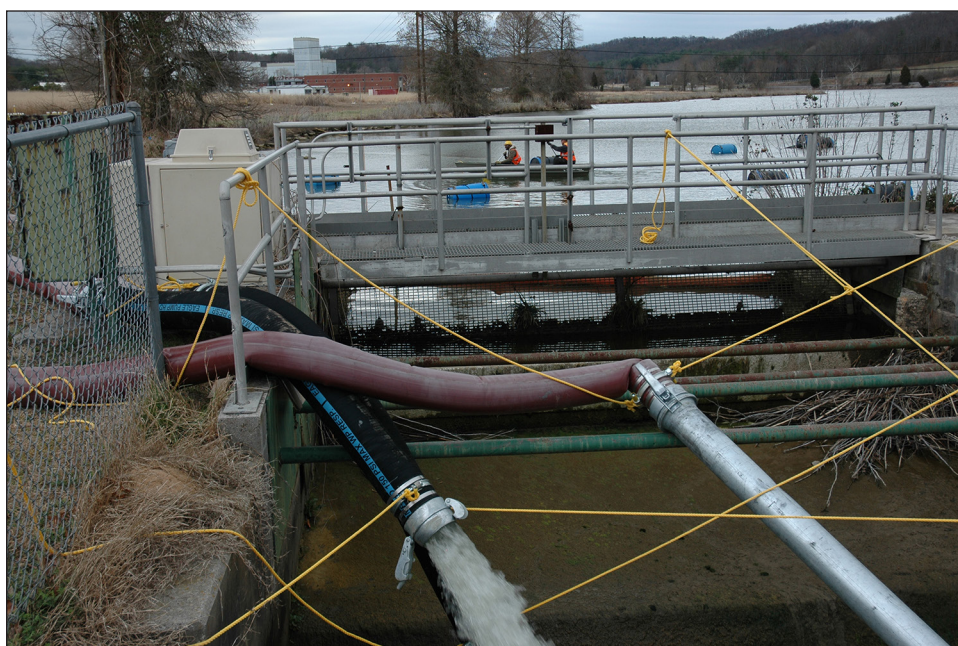
One of the contaminated ponds at ETPP being drained

Remediation of the ETPP 1007-P1 and 901-A Ponds and 720 Slough was completed using ecological enhancement. Ecological enhancement is an innovative approach to remediation that includes fish community restructuring, revegetation, and wildlife management. The goal is to establish a new condition within the ponds that reduces risk from polychlorinated biphenyls (PCBs) by enhancing components of the ecology that minimize PCB uptake. Actions completed were removing fish that bioaccumulate PCBs, restocking with fish (bluegill) that do not bioaccumulate PCBs, planting aquatic vegetation to limit sediment resuspension.