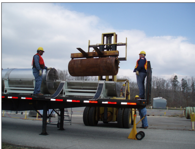
UF_6 cylinder being loaded for transport at ETPP

Following removal of the scrap material, remediation of contaminated soils was initiated in 2009. Radiological walkover surveys and soil sampling were used to define excavation areas. Approximately 67,000 yd 3 of contaminated soil and debris were excavated and transported to EMWMF for disposal between May 2009 and October 2010, including more than 11,000 yd 3 of asbestos-contaminated soil and debris. Approximately 500 yd 3 of more highly contaminated soil and debris were shipped for disposal at the Nevada National Security Site and the Energy Solutions facility in Clive, Utah.