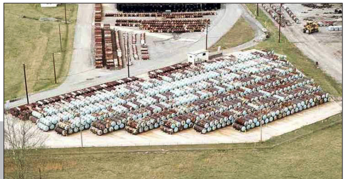
One of ETPP's cylinder yards before and after cylinder removal