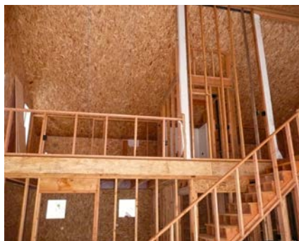
The SIP panels provide insulated attic spaces and cathedral ceilings.

unnecessary in the mild marine climate. One bathroom fan is set to exhaust continuously at a low speed to provide ASHRAE 62.2-required indoor ventilation. Makeup air is provided by a HEPA filtered vent duct. The intake duct has a damper that will open passively whenever the 80-cfm bathroom exhaust fans are operating. The ventilation duct is also equipped with its own fan to push fresh air into the home. The fan will come on full speed when the 206-cfm kitchen range