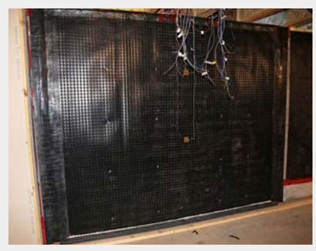
Nonadhered WSP with sealed perimeter