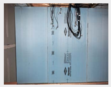
Rigid insulation with caulked joints

For more Information, see the Building America technical report, Cold-Climate Foundation Retrofit Experimental Hygrothermal Performance: Cloquet Residential Research Facility Laboratory Results , at buildingamerica.gov .