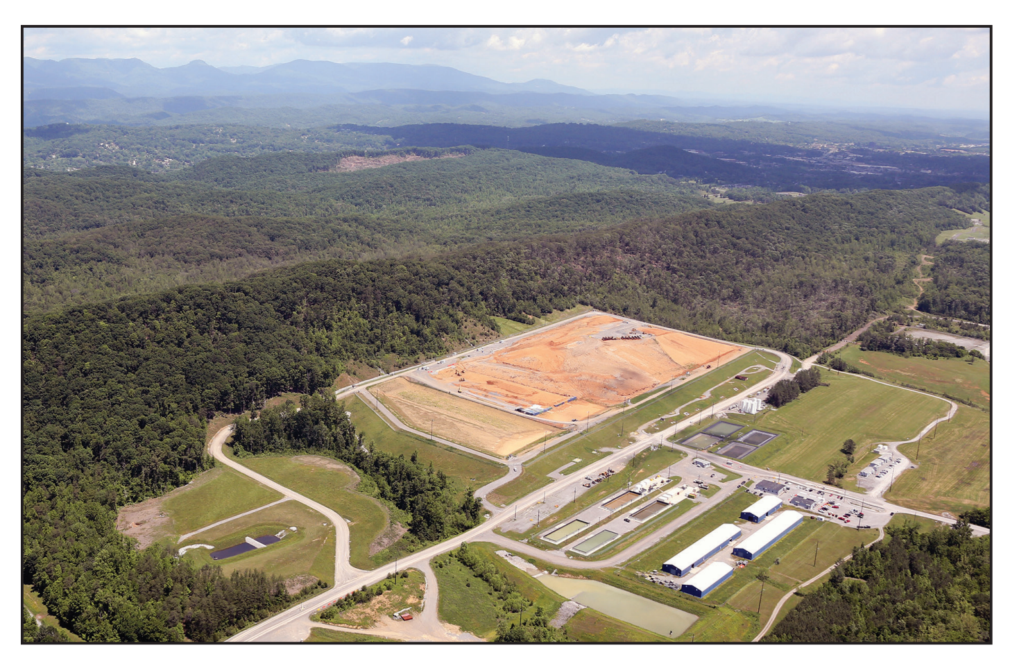
CERCLA Waste Facility

as well as wastes regulated under the Resource Conservation and Recovery Act and Toxic Substances Control Act from CERCLA-regulated cleanup work associated with the Oak Ridge Reservation. Potential wastes include soil, sludge, sediments, solidified waste forms, stabilized waste, vegetation, building debris, personal protection equipment, and scrap equipment.