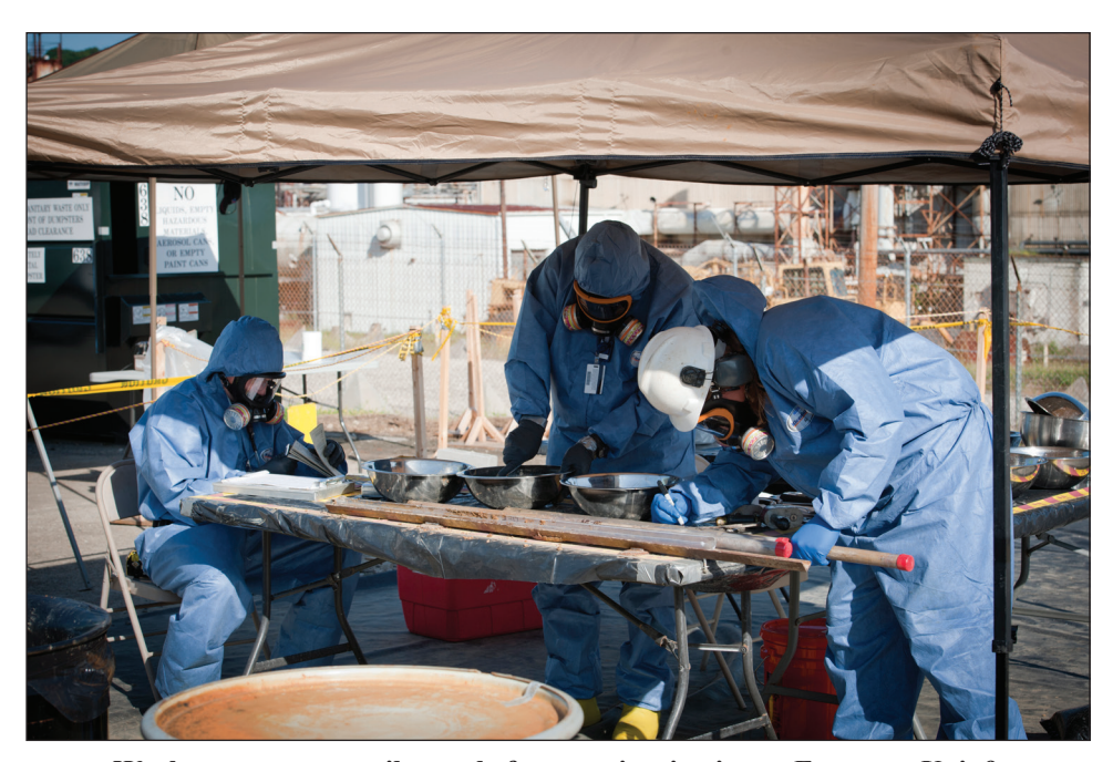
Workers prepare a soil sample for containerization at Exposure Unit 9

Characterization results were presented in a Technical Memorandum and indicated that a remedial action is required in the former 81-10 Area for protection of the industrial work force. The proposed remedial action is excavation of a 45-ft by 70-ft by 2-ft deep area with an estimated volume of 6,300 ft<sup>3</sup> of soil in the remedial action boundary. An RDR detailing the method of accomplishment, waste management, and waste disposition was submitted to EPA and TDEC ahead of the FFA milestone.