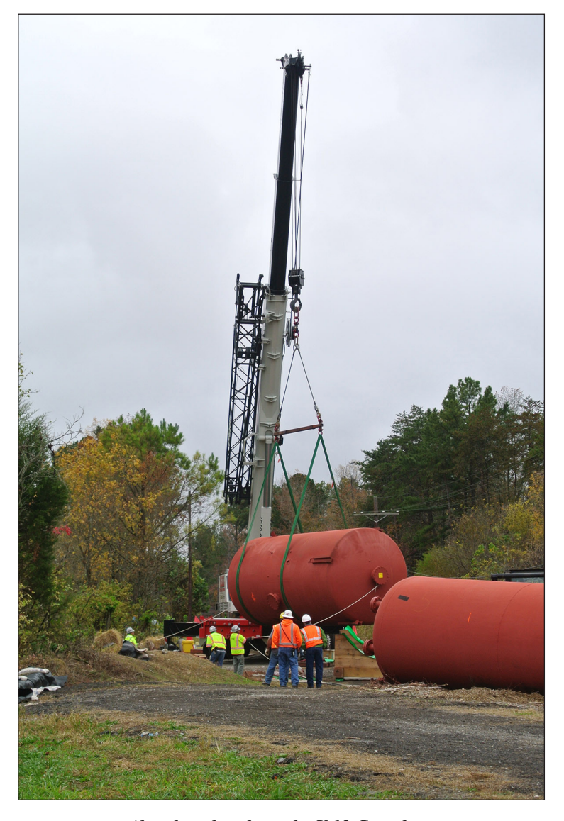
Abandoned tanks at the Y-12 Complex

Work on a draft Conceptual Design Report (CDR) and a supporting Bench Scale Treatability Study Project for OF200 were initiated in FY 2012 using American Recovery and Rein-