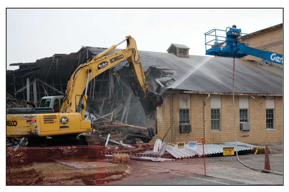
Building 9735 has been demolished.

Deactivating the recovery furnace exhaust system reduced exposure from potential release of radiological and hazardous materials in out-of-service equipment. Deactivation also eliminated the need for daily monitoring of the process systems and was a key step in preparing the building for D&D. The Building