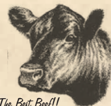
The Best Beef!!

Skinny $3 Sweet Potato $3 Onion Rings $4 Cheese Fries $4