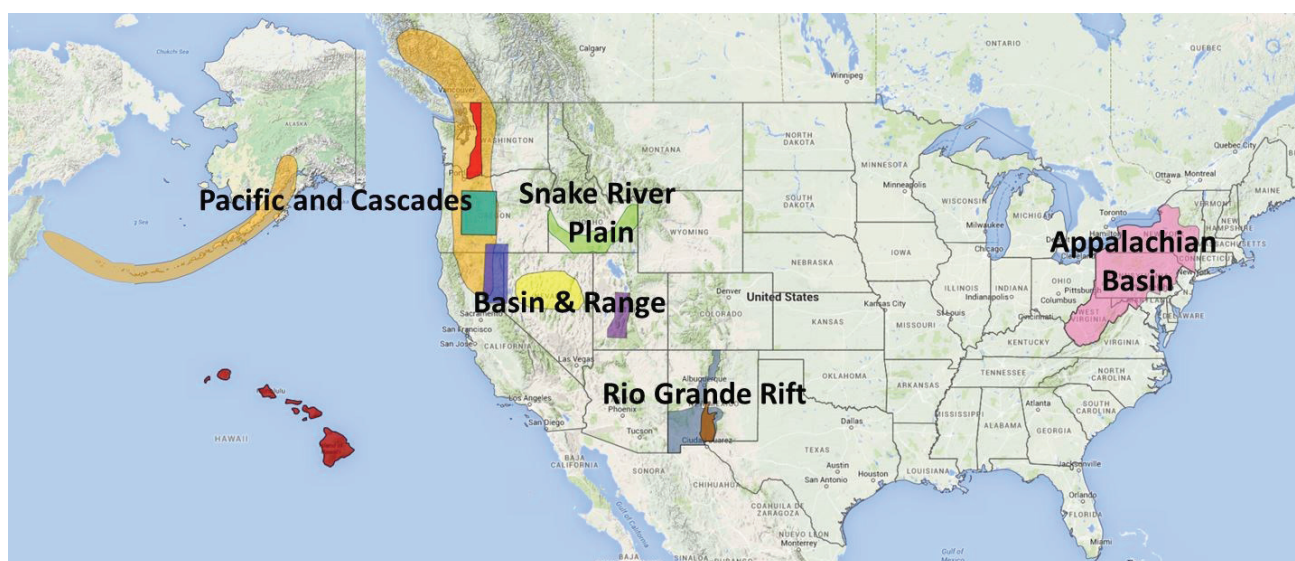
Figure 2: Areas of the United States being studied through this FOA by Play Fairway Analysis.