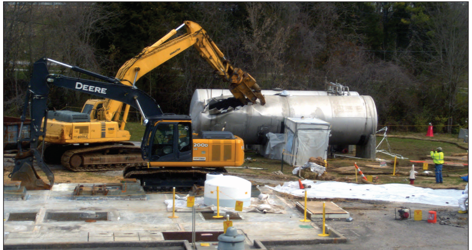
The 3085 tanks were among the non-reactor facilities that were demolished

As part of the 34 Buildings D&D Project, legacy material was removed from more than 32,000 ft 2 of facility space, and a total of 115,600 ft 2 of building space was demolished and the demolition debris disposed. The 34 buildings, located in the busy central campus portion of ORNL, were safely and successfully demolished without impacting adjacent laboratory facilities. This project has eliminated the risk associated with these unused facilities and will allow re-use of the area to support ORNL's ongoing and future research activities.