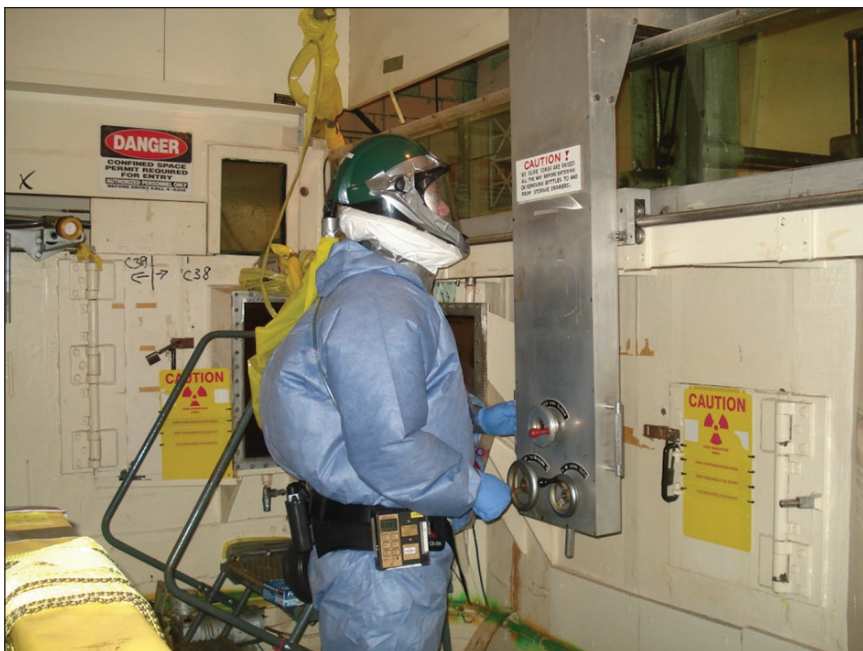
A worker in 3038 uses a glove box to package and dispose of waste.

The ventilation system branches and off-gas system are part of the central gaseous waste system at ORNL that vent through the 3039 Central Stack. The project provides localized ventilation systems to the 4501, 4505, 4500N, and 4507 facilities; stabilizes the hot cells in Building 4507; cleans out filter pits