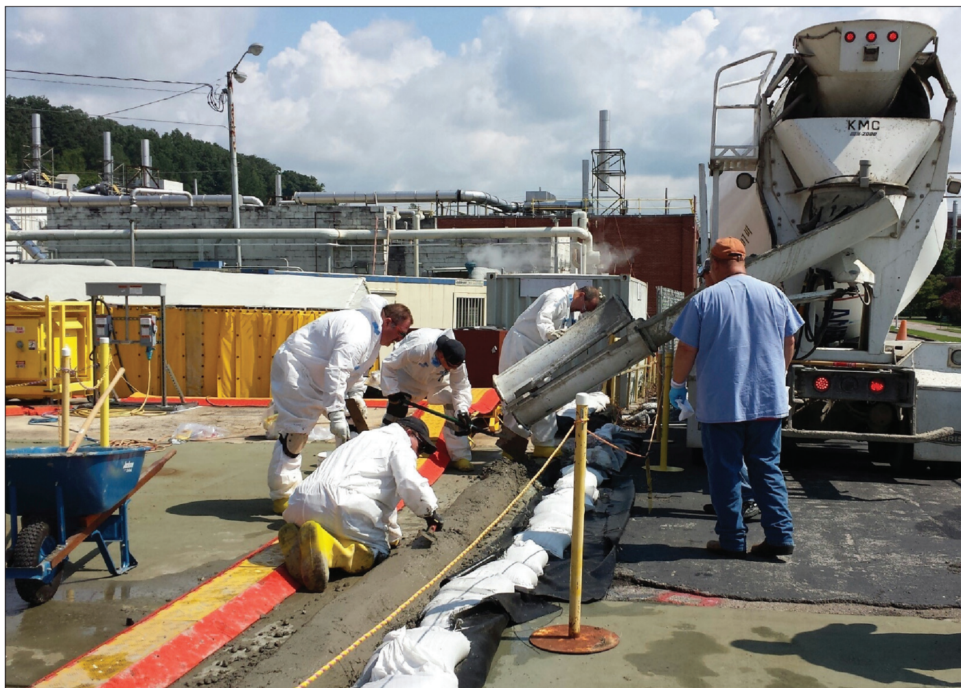
A concrete berm is being poured as part of the 3026 stabilization activities

Legacy material removal and demolition activities have been completed at several ORNL facilities. These contaminated non-reactor facilities are surplus buildings, some dating from the original Manhattan Project, that were no longer needed.