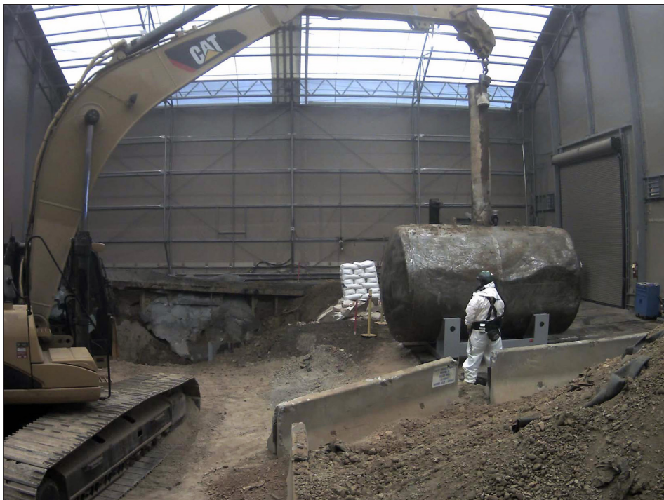
Tank W-1A being removed from the ground