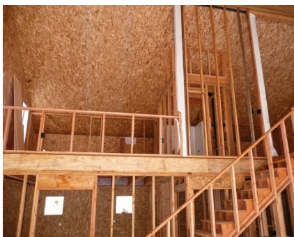
The SIP panels provide insulated attic spaces and cathedral ceilings.

unnecessary in the mild marine climate. One bathroom fan is set to exhaust continuously at a low speed to provide ASHRAE 62.2-required indoor ventilation. Makeup air is provided by a HEPA filtered vent duct. The intake duct has a damper that will open passively whenever the 80-cfm bathroom exhaust fans are operating. The ventilation duct is also equipped with its own fan to push fresh air into the home. The fan will come on full speed when the 206-cfm kitchen range