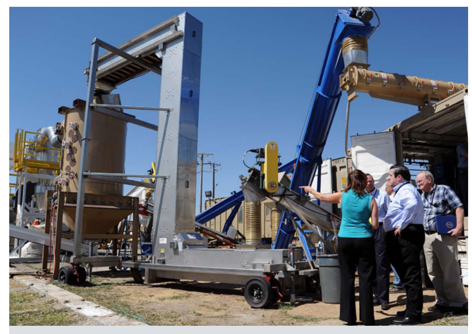
Illustration from BCS Inc.