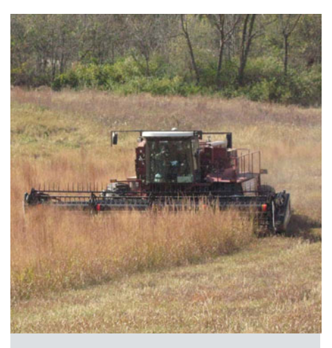
Switchgrass being harvested in Oskaloosa, IA, where researchers are working with Idaho National Laboratory to assess long-term biomass storage options.

Equipment developed by the project teams was subjected to rigorous, industrial-scale field testing to establish cost and productivity benefits. These efficiency enhancements have helped reduce delivered costs, improve net energy ratios, and reduce harmful emissions.