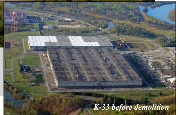
K-33 before demolition