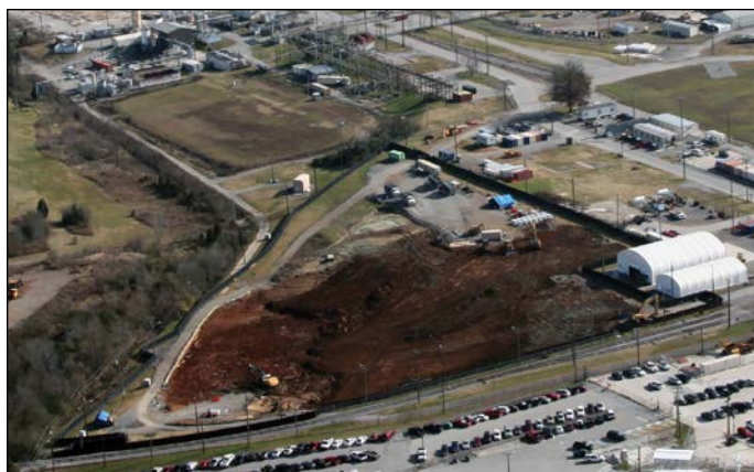
K-1070-B during remediation

Personnel cleaning up the burial ground worked 205,800 accident-free hours while excavating 100,200 cubic yards of soil and debris. A total of 7,790 dump truck loads of waste shipped to EMWMF.