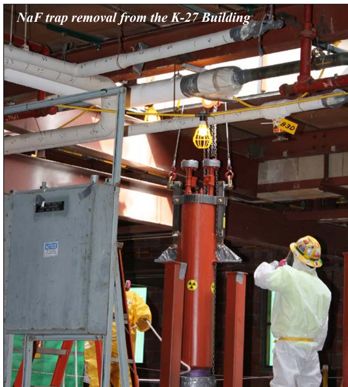
NaF trap removal from the K-27 Building

Two solar arrays have been built at Heritage Center, both by private companies on land transferred from DOE to CROET. Both are demonstration projects that are supplying electricity to the Tennessee Valley Authority.