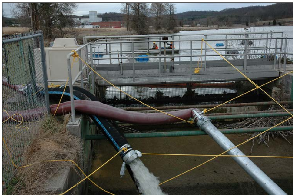
One of the contaminated ponds at ETTP being drained

Remediation of the ETTP 1007-P1 and 901-A Ponds and 720 Slough was completed using ecological enhancement. Ecological enhancement is an innovative approach to remediation that includes fish community restructuring, revegetation, and wildlife management. The goal is to establish a new condition within the ponds that reduces risk from polychlorinated biphenyls (PCBs) by enhancing components of the ecology that minimize PCB uptake. Actions completed were removing fish that bioaccumulate PCBs, restocking with fish (bluegill) that do not bioaccumulate PCBs, planting aquatic vegetation to limit sediment resuspension, and