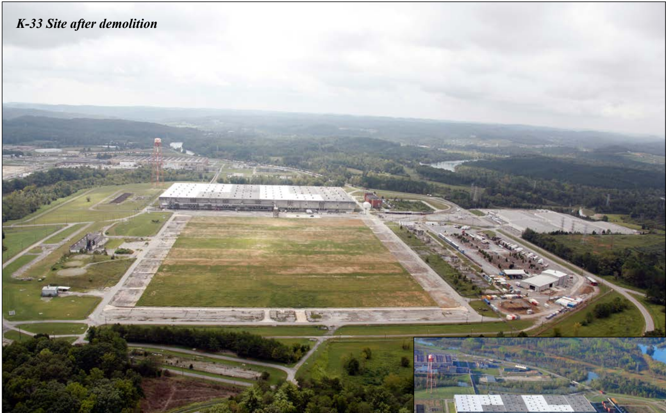
K-33 Site after demolition