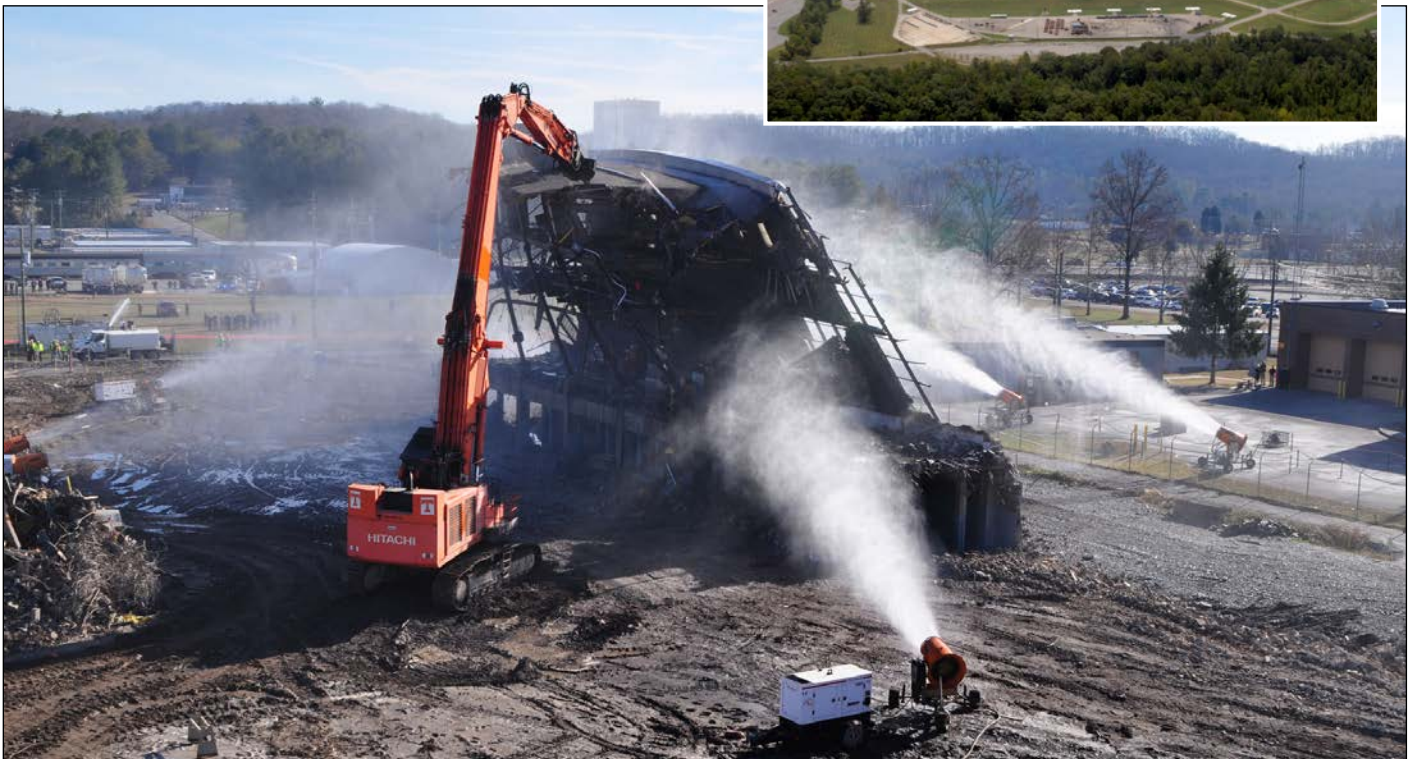
The final section of the K-25 Building was demolished in December 2013.