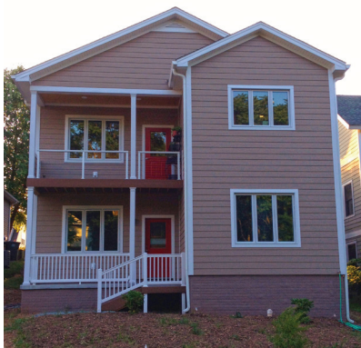
Triple-pane windows let in light while retaining heat.

an HVAC layout that used two mini-split slim-duct units. These are similar in efficiency to ductless heat pumps, but are installed in a dropped ceiling or closet and have short duct runs to adjacent rooms. Each inside unit is tied to an outside compressor unit. The units are highly efficient, having a heating efficiency of 12.2 HSPF and a cooling efficiency of 21 SEER. The upstairs unit is installed in a closet above a dropped ceiling and has ducts into the family room and the kitchen. The downstairs unit is located in the utility room with duct runs going to registers in the three bedroom ceilings.