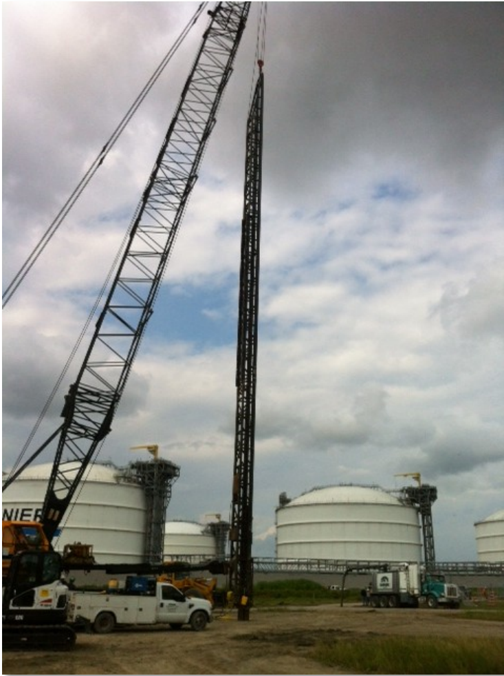
Pile driver setup 22-Aug-2012