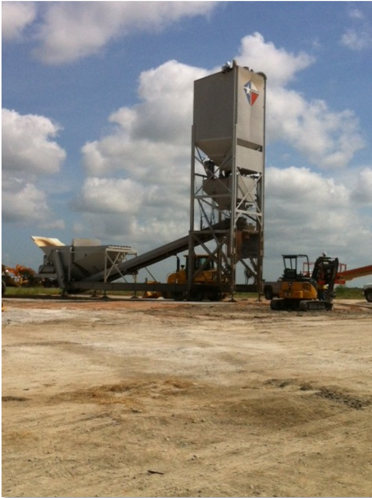
Batch plant 04-Aug-2012