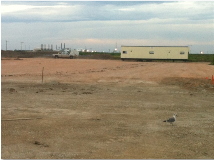
Office trailer area 30-Aug-2012