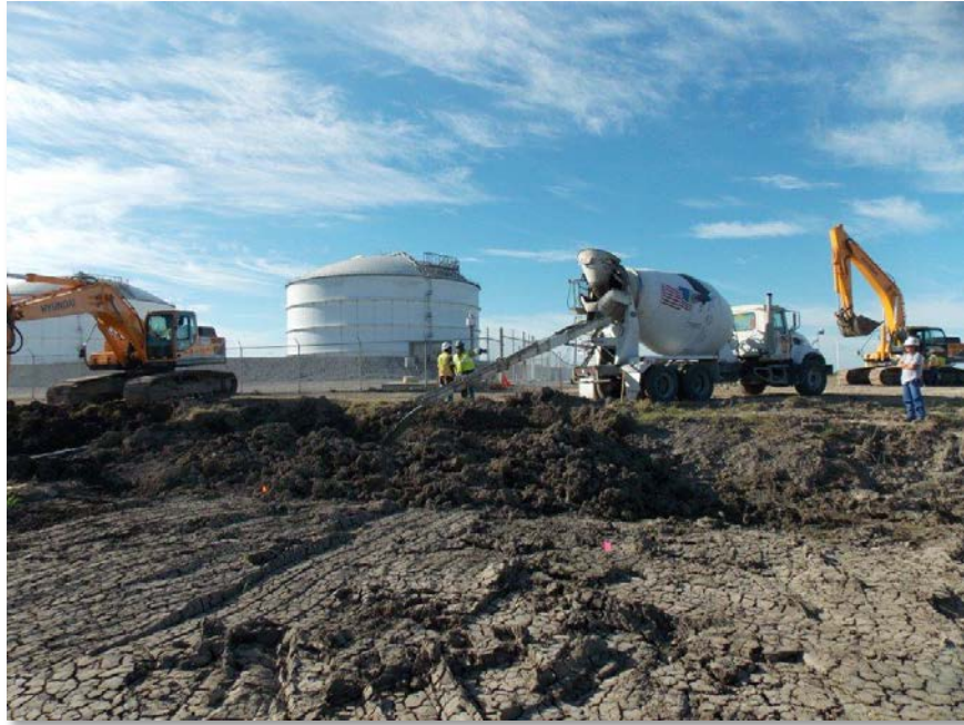
Soil Mixing (11-Sep-2012)