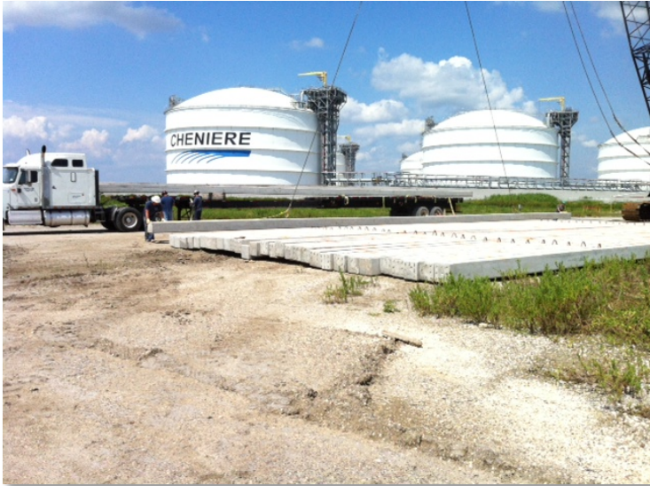
Concrete pile unloading to lay down 21-Aug-2012