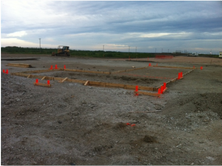
Started batch plant footing/foundation 30-Aug-2012