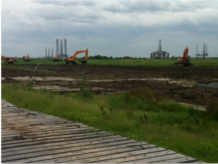
Stripping and grubbing in Train 1 ISBL Area. 29-Aug-2012