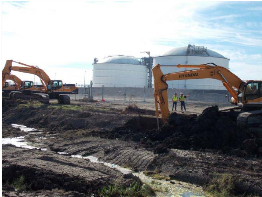
Soil Mixing (11-Sep-2012)