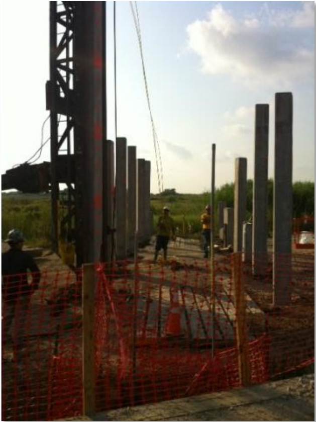
Heavy Haul Road Bridge Piling (24-Sep-2012)