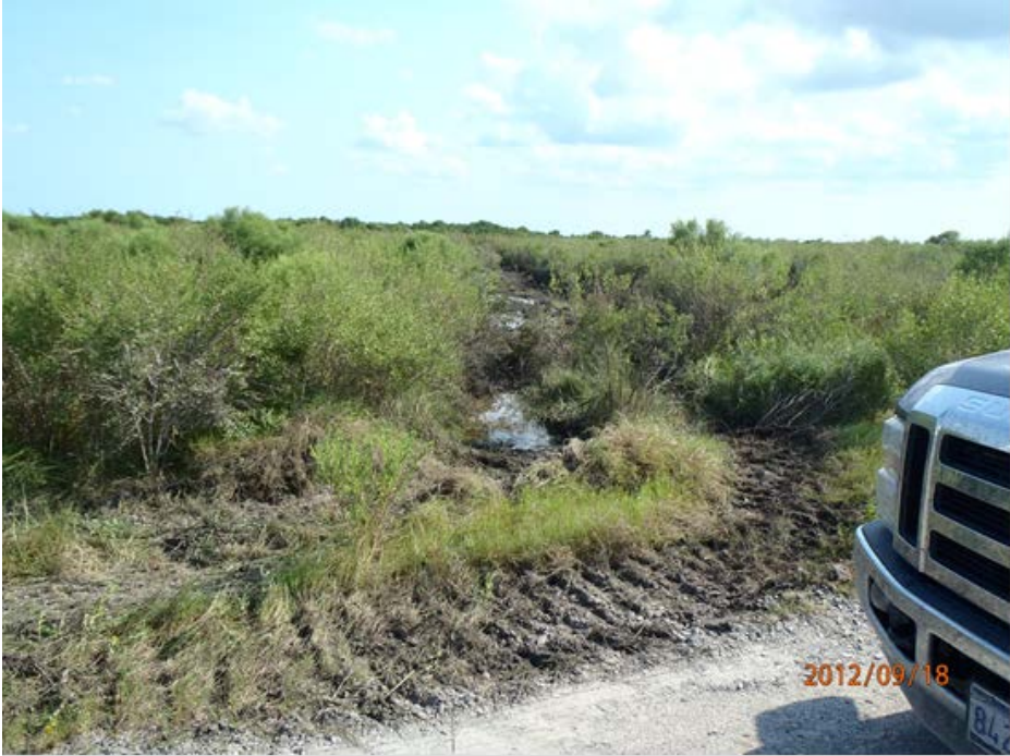
Area on Heavy Haul Rd where dozer went out of the workspace, facing south (18-Sep-2012)