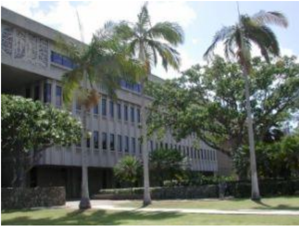
Kalanimoku Building – DAGS headquarters

A $34 million energy performance contract in state facilities is just completing construction, paid for by $3.2 million in annual operational savings and leveraged bond funds. A second phase for other DAGS buildings throughout the islands is now getting underway with another 25 buildings and a projected cost of another $35 million.