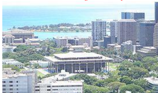
Hawaii's State Capitol

- Governor Linda Lingle, State of Hawaii