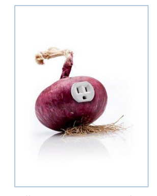
Gills Onions promotes how it is generating electricity using onion waste to power its fuel cells

Green policies may be required when competing for contracts – Walmart is reducing greenhouse gas emissions and is extending this goal beyond its corporate borders, requiring suppliers to reduce their emissions, too. Similarly, Sprint is working toward a goal of having 90% of its suppliers comply with the company's environmental standards by 2017. So far, according to the Prenova survey, only 21% of companies are using renewable sources to meet a portion of their energy needs. By deploying ultra-low emission fuel cells – to power forklifts or cars, to generate electricity, heat, cooling and hot water for buildings, or to provide highly reliable continuous or back-up power – corporations can begin to meet these new "green" requirements and can stand out from their competitors.