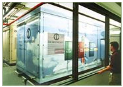
First National Bank of Omaha's fuel cells provide high quality, reliable power to their data processing facility

Data and call centers, in particular, require high quality, reliable power. Power outages collectively cost companies billions of dollars each year, with millions lost by a company for each hour that power is down. In addition, power quality issues, such as voltage sags or surges, can disrupt operations and damage sensitive equipment. Fuel cell technology can meet this need, delivering high quality, reliable power that surpasses the needs of data centers; analysis of the First National Bank of Omaha's fuel cells showed that they are capable of providing 99.99995% availability. The bank's fuel cells were installed in 1999 and the system is still operating today.