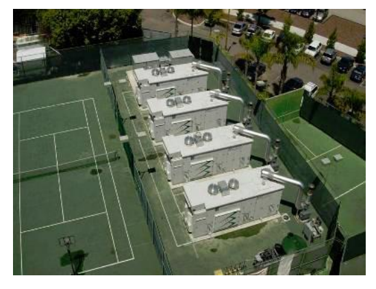
Figure 2: Sheraton San Diego's clean and quiet fuel cells are located next to the hotel's tennis courts

electric power can save money. A survey of nearly 200 retailers by Prenova, Inc. found that 45% consider sustainability a "key component" of their overall business strategy, with 60% saying that cost saving was their primary reason for pursuing sustainable business practices. Fuel cells have shown that they can reduce costs. Fuel cell-powered forklifts, for example, can reduce operational costs and increase productivity through shorter refueling times, smaller infrastructure requirements, longer run times, and greater worker productivity. In power generation, fuel cells reduce dependence on the grid and offer power stability, important to businesses such as