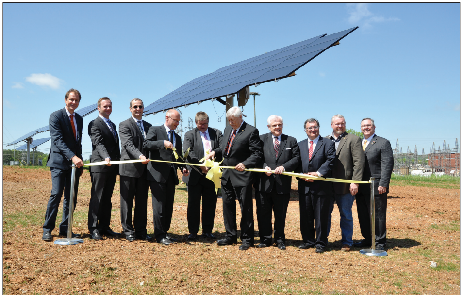
Ribbon-cutting ceremony for ETTP's second solar array

DOE has completed the environmental regulatory documents needed to transfer an additional 98 acres to the public at land parcel ED-13 and is nearing completion for an additional 28 acres at ED-11 and ED-12, which will allow additional industrial development of the site to continue.