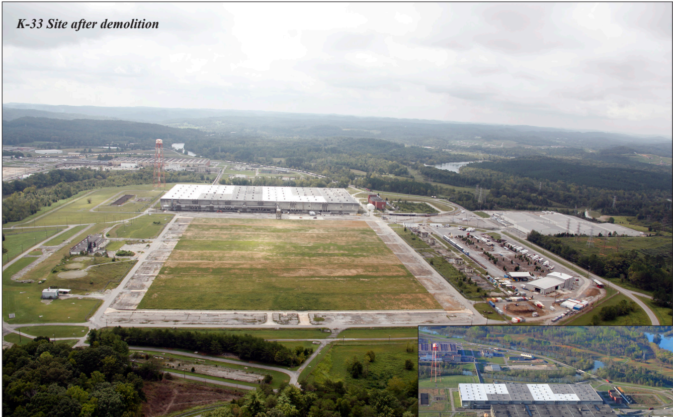
K-33 Site after demolition