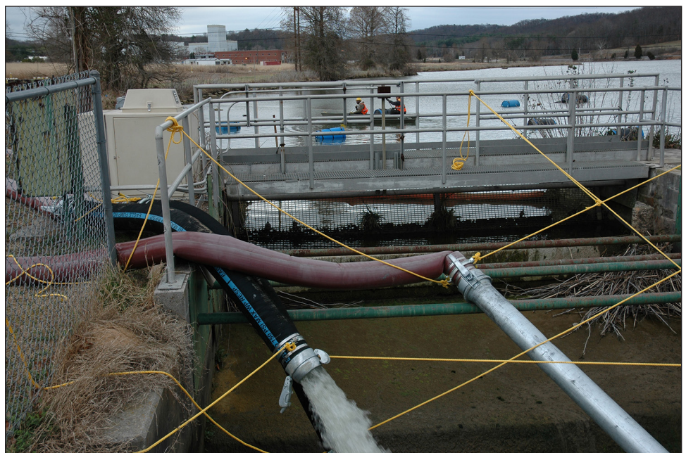
One of the contaminated ponds at ETTP being drained

Remediation of the ETTP 1007-P1 and 901-A Ponds and 720 Slough was completed using ecological enhancement. Ecological enhancement is an innovative approach to remediation that includes fish community restructuring, revegetation, and wildlife management. The goal is to establish a new condition within the ponds that reduces risk from polychlorinated biphenyls (PCBs) by enhancing components of the ecology that minimize PCB uptake. Actions completed were removing fish that bioaccumulate PCBs, restocking with fish (bluegill) that do not bioaccumulate PCBs, planting aquatic vegetation to limit sediment resuspension, and