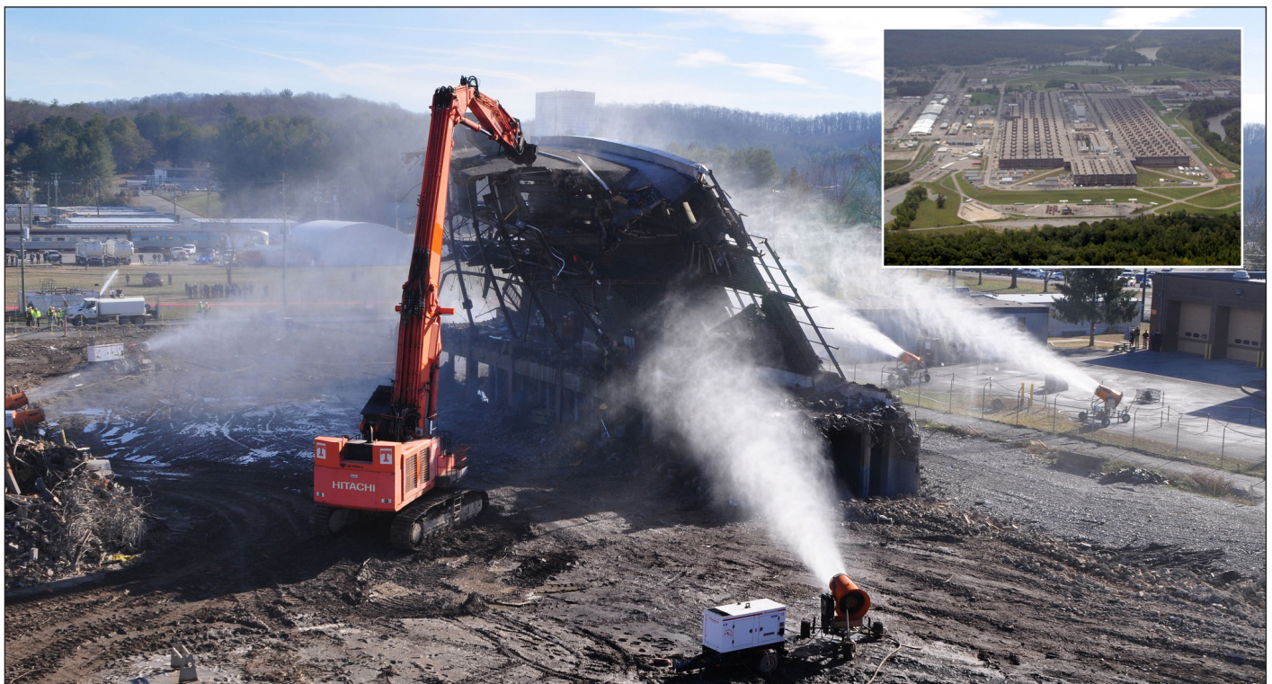
The final section of the K-25 Building was demolished in December 2013.