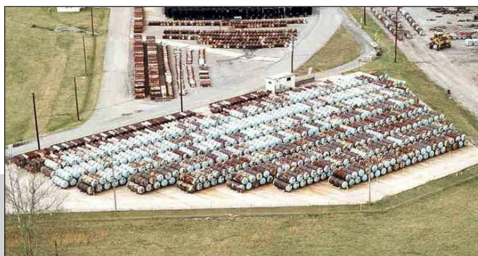
One of ETPP's cylinder yards before and after cylinder removal