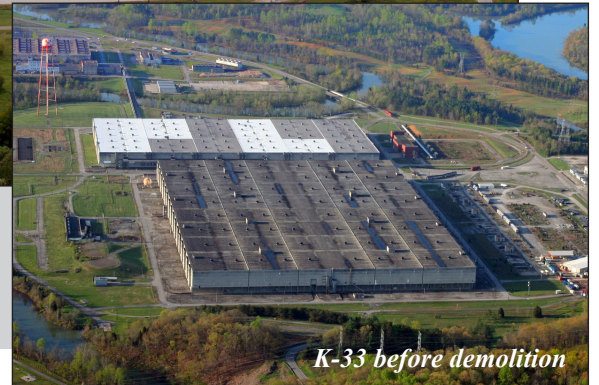
K-33 before demolition